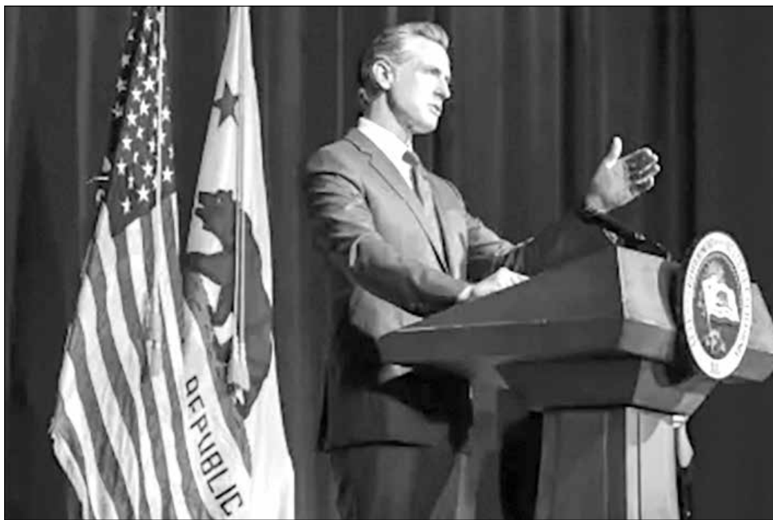
Gov. Gavin Newsom unveils his revised budget proposal for 2023-24 during a press briefing at the state Natural Resources Agency in Sacramento on May 12, 2023.

Under the governor's plan, the state would also borrow $1.2 billion from special funds and increase by $2.5 billion a tax on managed care health plans to address the spending gap. Extensive savings would remain largely untouched, though Newsom did propose to make a $450 million withdrawal from one