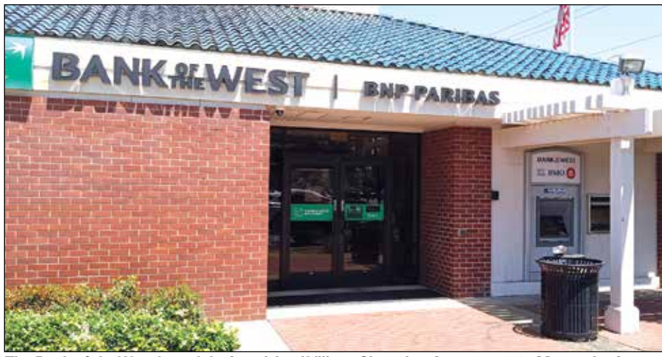
The Bank of the West branch in Carmichael Village Shopping Center at 4001 Manzanita Avenue and Fair Oaks Boulevard is joining the BMO family.