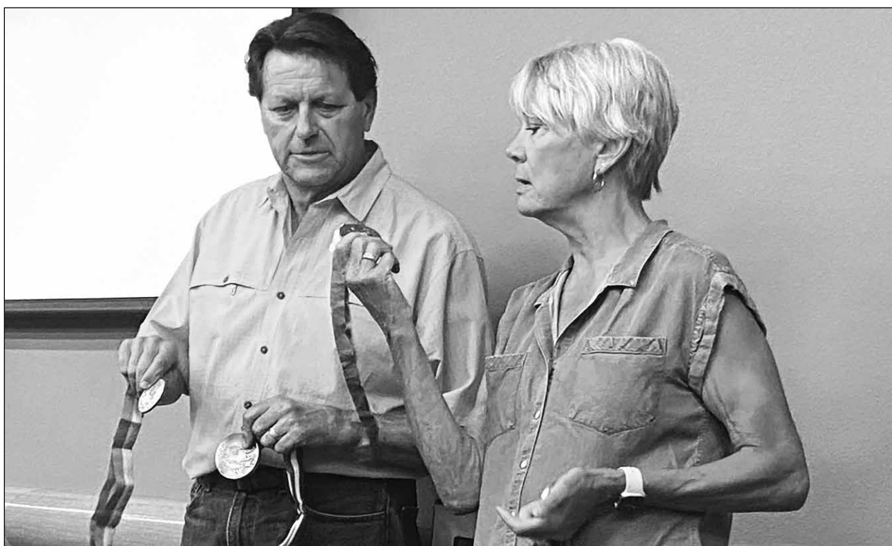
Jeff Float and Debbie Meyer show the overflow crowd their Olympic gold medals.