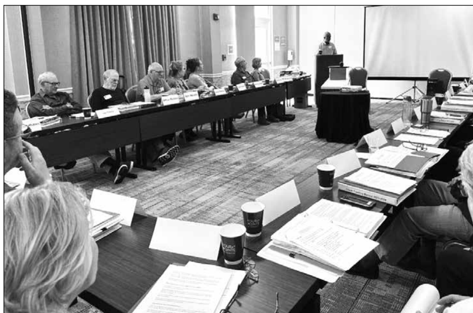
Beginning in late June the trainers will fan out across the State in teams of three or four and begin the challenging work of sharing their experience and knowledge.