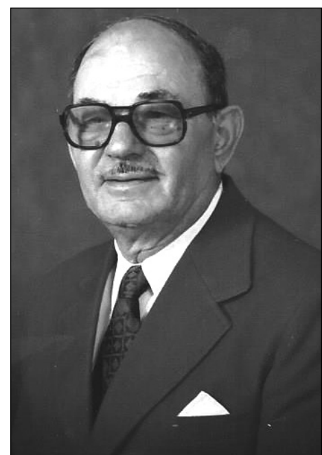
I think it's important to realize that dads do have a significant influence on their daughter's life. My dad taught me to never give up, no matter what the situation. I would like to think he would be proud of my accomplishments today.

He worked long and hard, lying about his age to get whatever job he could get. I don't have enough time to share the whole story, but he became a Furrier and made it to Metro Golden Mayer studios in Hollywood to design fur coats for the stars including Betty Davis. When ulcers took their toll on his health, he worked his way up to making airplane wings in a plant and then turned to, of all things, taking on the arduous task of becoming an Ironworker. Yup, walking