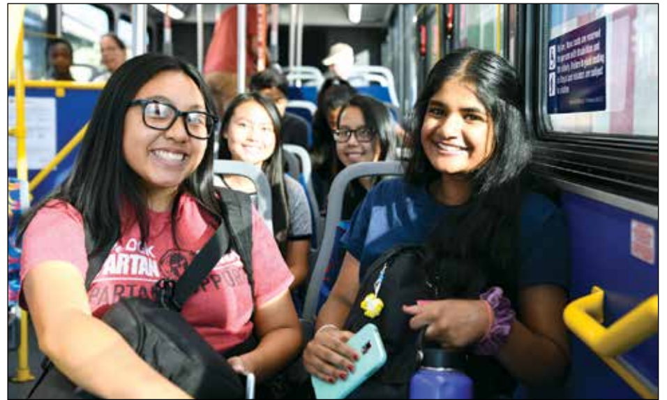
A study by the University of Texas found that RydeFreeRT not only improved school attendance, but it also reduced transportation barriers to get to jobs, internships and extracurricular activities.