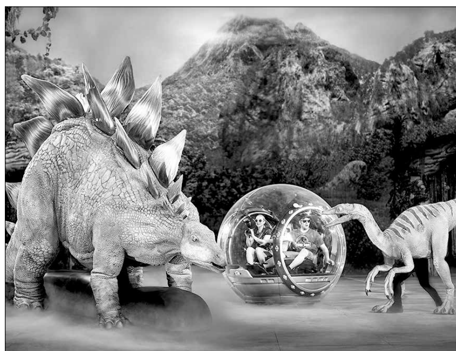
Jurassic World's unmistakable score transforms the arena into the dense jungles of Isla Nublar, where real Gyrospheres roll through the valley and scientists explore the lost world.