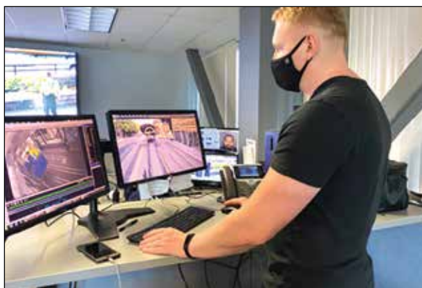
SacRT Receives TSA Gold Standard Award for Transit Security and Emergency Preparedness Programs.

SACRAMENTO, CA (MPG) - The Sacramento Regional Transit District (SacRT) has been awarded the Transportation Security Administration's (TSA) Gold Standard Award for its transit security and emergency preparedness programs. This prestigious award is the highest recognition TSA can give to a transit agency for achieving top scores during an annual review of 17 categories of security and emergency preparedness elements. Out of the 6,800 public transit agencies the TSA oversees, SacRT is one of only four nationwide to receive this recognition this year. SacRT was presented the award during the SacRT Board of Directors meeting on January 23, 2023.