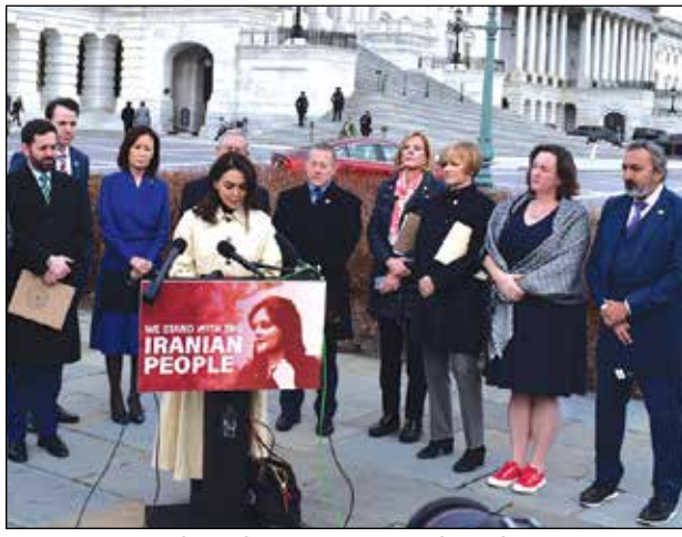
Ami Bera, M.D. (D-CA) and Kevin Kiley (R-CA) participated on January 27, 2023, in a bipartisan event at the U.S. Capitol in support of human rights protestors in Iran.