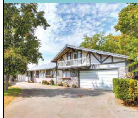
3988 Orval Way, Carmichael | $869,000