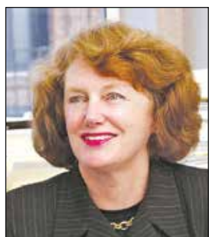
Commentary by Sally C. Pipes

As a Republican-controlled House of Representatives with a small majority opens for business in January, one member has especially big ideas for saving patients money on prescription drug costs and the research to back it up.