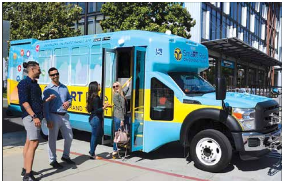
SacRT's mission to dramatically improve safety and security in every corner of its system has resulted in several other national award recognitions.

Continued from page 1 SacRT for continually going above and beyond for our community."