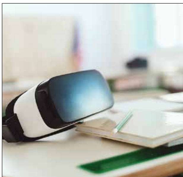
Firefighter training is unique and quite often comes with a calculated risk. VR technology can help reduce some of that risk during training by exposing the firefighter to the experience they will be dealing with firsthand in a completely virtual atmosphere, without the risk.