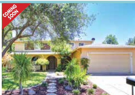
4922 Thor Way, Carmichael

From its charming exterior to its beautifully updated interior, this Sacramento home has it all! Step inside to a spacious floor plan with 4 bedrooms and 3 full baths, separate living and family rooms, and a formal dining area. The living room features beautiful hardwood flooring and a cozy fireplace for those long winter nights. Relax and unwind in the bright and airy family room, which opens up to the private backyard. The kitchen is appointed with granite countertops and stainless steel appliances. Entertain outdoors with a roomy backyard, complete with a sparkling pool, outdoor patio, play structure, tool shed and more! 3-car garage with possible RV access. Just steps away from Mission Park and close to Raley's, Bel Air, great shopping and restaurants.