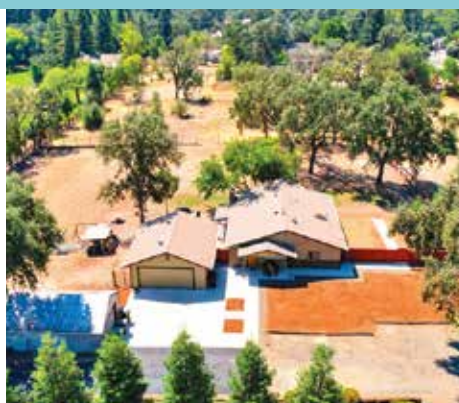
3840 Valle Vista Road, Carmichael | $789,900

Fantastic Opportunity for multi-generational housing or an investment property that will cash flow! This spacious 2,500 square foot house has 4 bedrooms and 3 full baths. This home has a separate living room, family room and huge sunroom. The kitchen/dining combo offers plenty of storage space. Attached with a separate entrance is a 2 bedroom and one bath home. Each home has its own 2-car garage and backyard. Zoned Rd-10, it is possible to convert this home into a triplex. Great location just minutes away from excellent shops, restaurants and schools. Convenient access to freeways. Don't miss this opportunity!