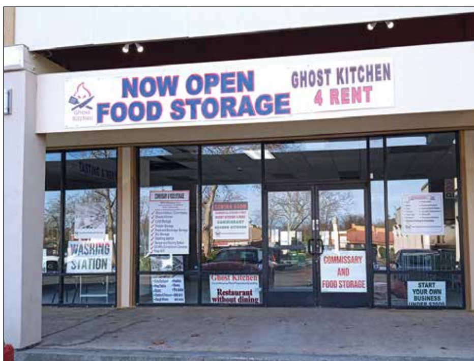
The soon to open 'Ghost Kitchen' Carmichael location is a 4,500-square-foot commissary/commercial kitchen space at 5800 Madison Ave.