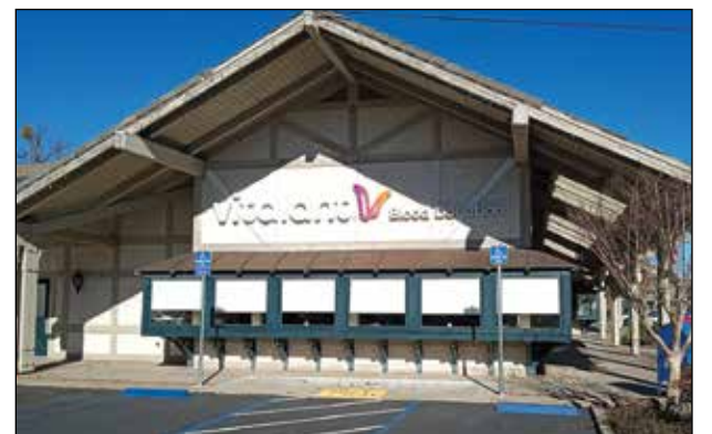
The Vitalant blood donation center at 11713 Fair Oaks Boulevard in Fair Oaks will be temporarily closed for at least eight weeks beginning February 14.

The Fair Oaks center has 15 donation stations, that on average, receive 600 whole blood donations per month. Each whole blood donation takes about 45 minutes