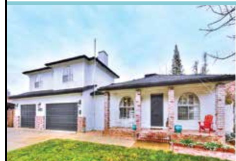
4620 North Avenue, Sacramento | $679,000

This 1.8 acre horse property is tucked away in a fantastic Carmichael neighborhood! This is a possible development property but is presently perfect for your horses or personal hobbies with plenty of land for animals to roam, a fenced backyard, a 700 square feet workshop and a huge detached garage. Enjoy beautiful stone siding and thoughtful updates inside including all new flooring, a beautifully updated kitchen complete with a breakfast bar, and recently remodeled bathrooms. Open open-concept floor plan, dual pane windows that offer great natural lighting, recessed ceilings, and much more!