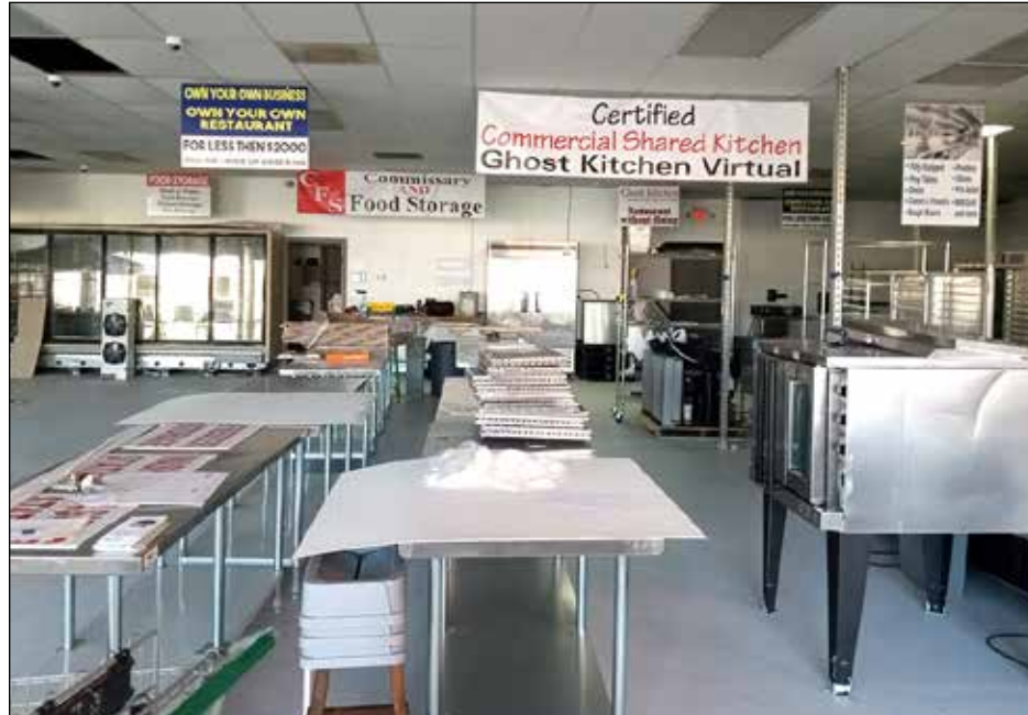
The Carmichael site recently had over $200,000 on equipment and physical improvements done, including $25,000 to correctly re-install a kitchen range hood system.