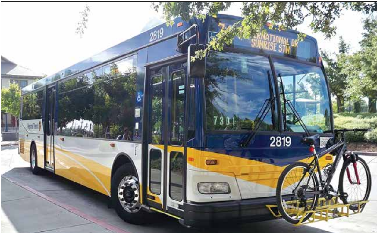
SacRT has been awarded this prestigious award which is the highest recognition TSA can give to a transit agency for achieving top scores during an annual review of 17 categories of security and emergency preparedness elements.