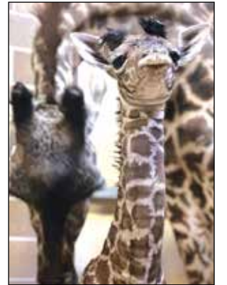
Shani a Masai giraffe gave birth to a female calf on Sunday, January 22, at 12:28pm at the maternity giraffe barn stall of the Sacramento Zoo.