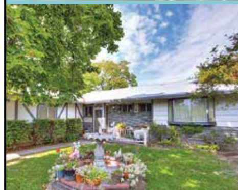
3988 Orval Way, Carmichael | $899,000

Fantastic Opportunity for multi-generational housing or an investment property that will cash flow! This spacious 2,500 square foot house has 4 bedrooms and 3 full baths. This home has a separate living room, family room and huge sunroom. The kitchen/dining combo offers plenty of storage space. Attached with a separate entrance is a 2 bedroom and one bath home. Each home has its own 2-car garage and backyard. Zoned Rd-10, it is possible to convert this home into a triplex. Great location just minutes away from excellent shops, restaurants and schools. Convenient access to freeways. Don't miss this opportunity!