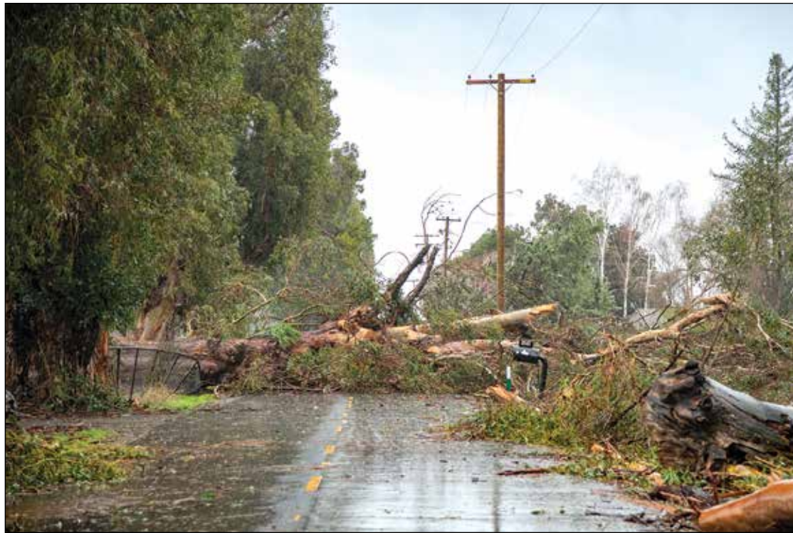
The state has established emergency shelters in Sacramento County and has stockpiled 3.7 million sandbags.