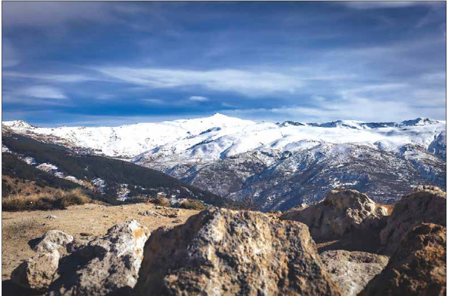
Despite heavy rain and snow, relief from drought conditions still depends on coming months.

More telling than a survey at a single location are DWR's electronic readings from 130 stations placed throughout the state. Measurements indicate