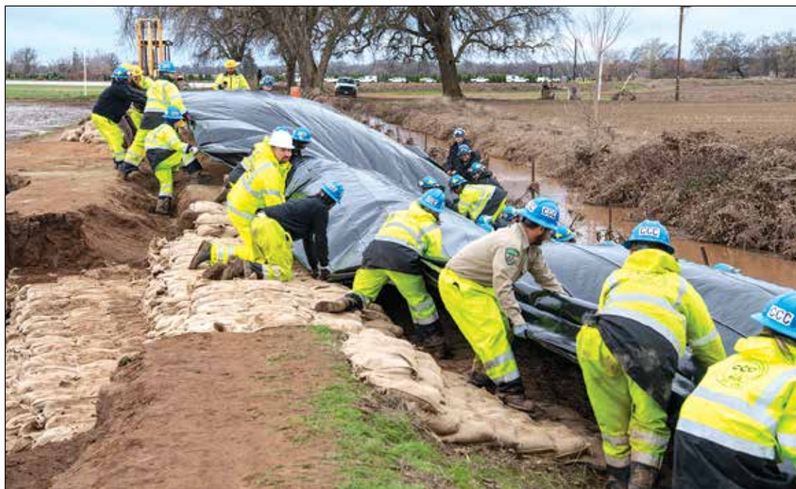
Another dangerous storm is barreling toward the Sacramento Valley, where rains already punched through some levees.

climatologist with the California Department of Water Resources, noted that impacts from the upcoming storm system could escalate to a "worst-case scenario" if it "becomes an unrelenting series of storms."