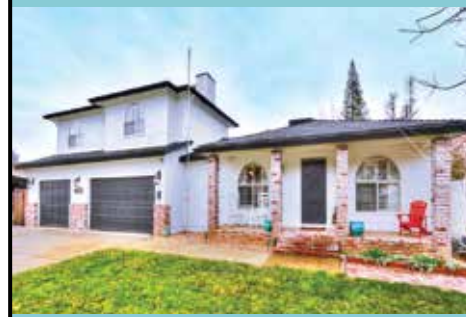
4620 North Avenue, Sacramento | $679,000

This 1.8 acre horse property is tucked away in a fantastic Carmichael neighborhood! This is a possible development property but is presently perfect for your horses or personal hobbies with plenty of land for animals to roam, a fenced backyard, a 700 square feet workshop and a huge detached garage. Enjoy beautiful stone siding and thoughtful updates inside including all new flooring, a beautifully updated kitchen complete with a breakfast bar, and recently remodeled bathrooms. Open open-concept floor plan, dual pane windows that offer great natural lighting, recessed ceilings, and much more!