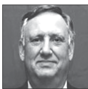
By Dan Walters, CALMatters.org

It's well known that the California Environmental Quality Act, signed by then-Gov. Ronald Reagan in 1970 and meant to protect the natural environment in public and private projects, is routinely misused to stop or delay much-needed housing construction.