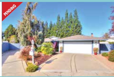
8223 Scarlett Oak Circle, Citrus Heights | $549,900

From its charming exterior to its beautifully updated interior, this Sacramento home has it all! Step inside to a spacious floor plan with 4 bedrooms and 3 full baths, separate living and family rooms, and a formal dining area. The living room features beautiful hardwood flooring and a cozy fireplace for those long winter nights. Relax and unwind in the bright and airy family room, which opens up to the private backyard. The kitchen is appointed with granite countertops and stainless steel appliances. Entertain outdoors with a roomy backyard, complete with a sparkling pool, outdoor patio, play structure, tool shed and more! 3-car garage with possible RV access. Just steps away from Mission Park and close to Raleys, Bel Air, great shopping and restaurants.