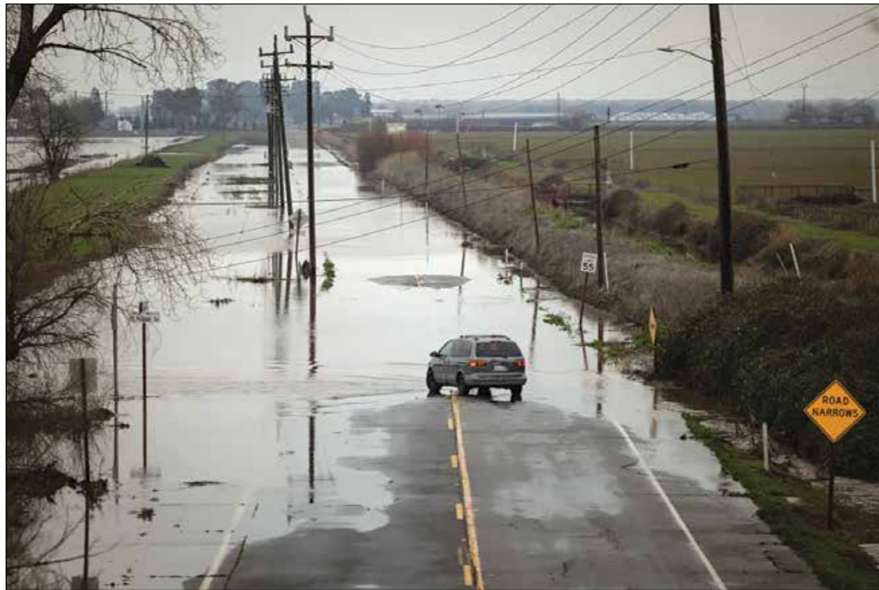
A car stops on a flooded Lambert Road off Interstate 5 in Sacramento County on Jan. 3, 2023. Northern California was hit by a major rainstorm that caused power outages, landslides and flooding over the New Year's holiday weekend.