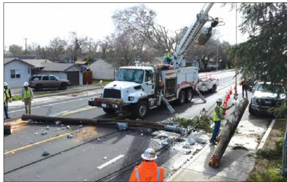
SMUD crews were out in full force to repair damage caused by the high winds.

SMUD line crews, troubleshooters and other field personnel will work 24/7 to restore power to customers if it's safe to work. Crews made steady progress throughout the day Sunday to assess damage,