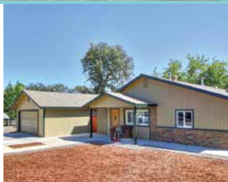
3840 Valle Vista Road, Carmichael | $789,900

Fantastic Opportunity for multi-generational housing or an investment property that will cash flow! This spacious 2,500 square foot house has 4 bedrooms and 3 full baths. This home has a separate living room, family room and huge sunroom. The kitchen/dining combo offers plenty of storage space. Attached with a separate entrance is a 2 bedroom and one bath home. Each home has its own 2-car garage and backyard. Zoned Rd-10, it is possible to convert this home into a triplex. Great location just minutes away from excellent shops, restaurants and schools. Convenient access to freeways. Don't miss this opportunity!