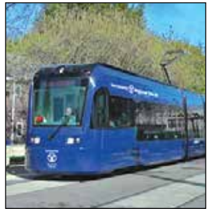
The California State Transportation Agency (CalSTA) awarded SacRT funding to help fund three major projects.