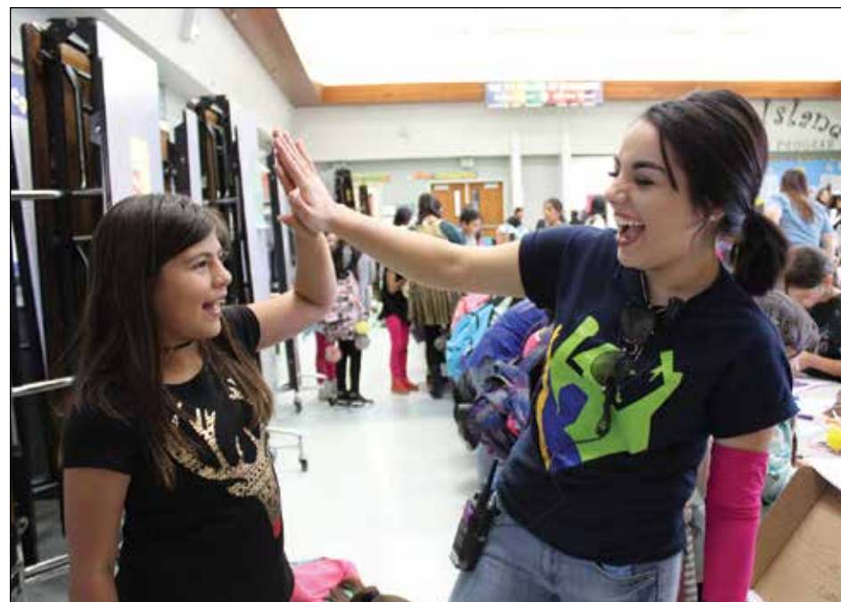
CTFF currently places "teaching fellows" serving at over 300 school sites throughout California.

New teaching fellows who are offered a position by CTFF will have