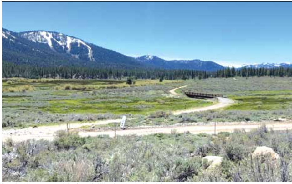
Martis Meadow near Truckee, California.