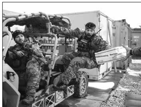
Soldiers deployed overseas are grateful to receive MAF packages reminding them of home and hoping for a safe return.