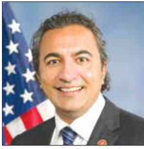
Ami Bera Office of Congressman Ami Bera, M.D.

WASHINGTON, DC (MPG) - Representative Ami Bera, M.D. (D-CA) Chairman of the House Foreign Affairs Subcommittee on Asia, the Pacific, Central Asia, and Nonproliferation, released the following statement on President Biden's decision to continue with the August 31 U.S. withdrawal