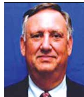
By Dan Walters CALMatters

"The enemy of my enemy is my friend" is an ancient proverb thought to date from a 4th century BC Sanskrit writing on statecraft.