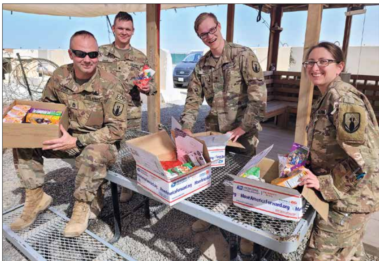
Move America Forward package recipients are Armed Forces soldiers who get a colorful view inside packages sent with care and affection.