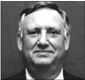
By Dan Walters CALMatters

California's housing crisis is a multi-front guerrilla war, pitting those who want to lower legal and political barriers to construction against those who see new developments as threats to the environment and/or the ambience of their neighborhoods. The conflict is waged in the Legislature, in the state housing bureaucracy, in city councils, in the courts and, increasingly, at the ballot box. Every new offensive assault by pro-housing forces meets stout resistance by defenders of the status quo and over time, it's been something of a stalemate. Housing construction remains well below the levels needed to close the gap between supply and demand, resulting in ever-rising rents and home prices, ever-increasing angst for Californians priced out of the market and an adverse effect on the economy as workers migrate to more affordable communities elsewhere. Get a veteran journalist's take on what's going on in California with a weekly round-up of Dan's column every Friday. The Housing Crisis Act of 2019 was a major thrust by the pro-housing faction. Senate Bill 330 was aimed at blocking local government