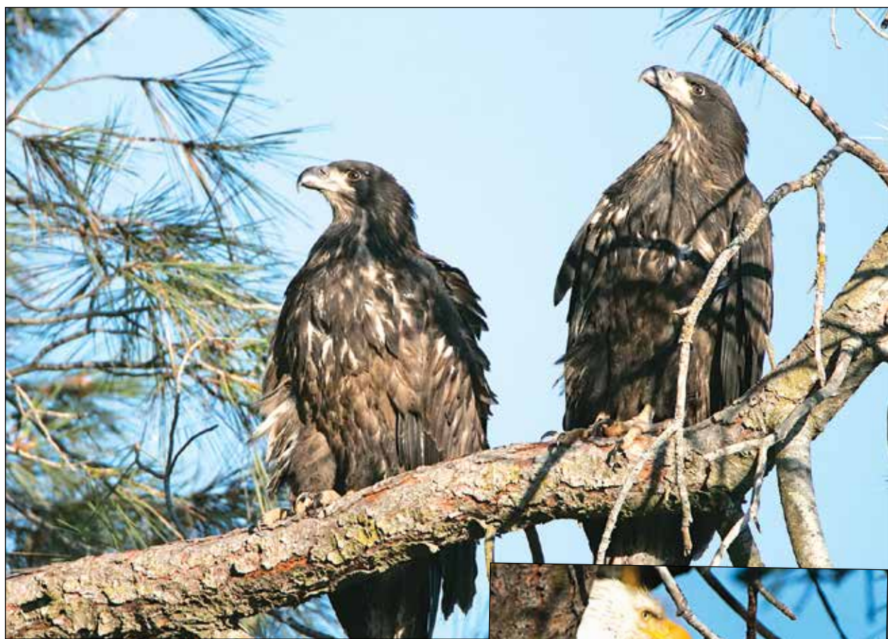
Above: Inseparable before fledging, 2021 eaglets Rio and Lago contemplate their skyward destiny. Right: Vigilant caregiver Papa bald takes a nursery shift while Mama hunts.