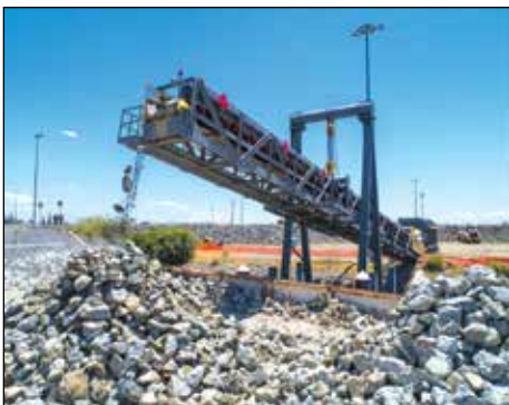
Rock is loaded onto barges at the California Department of Water Resources Weber Rock Yard near the Port of Stockton, California. The purpose of the rock barrier is to prevent the Delta from becoming too salty for irrigation, drinking water, or fish.

Simultaneous to the drought barrier's construction, DWR is pursuing long-term planning and permitting in anticipation of