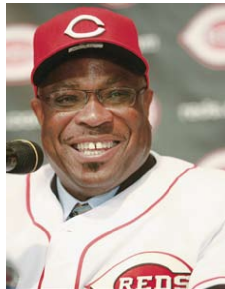
Dusty Baker, Manager Cincinnati Reds

Active outstanding graduates are current major leaguers Geoff Jenkins, Derek Lee, and Darren Oliver and the 2007 Cy Award winner Carsten C.C. Sabathia.