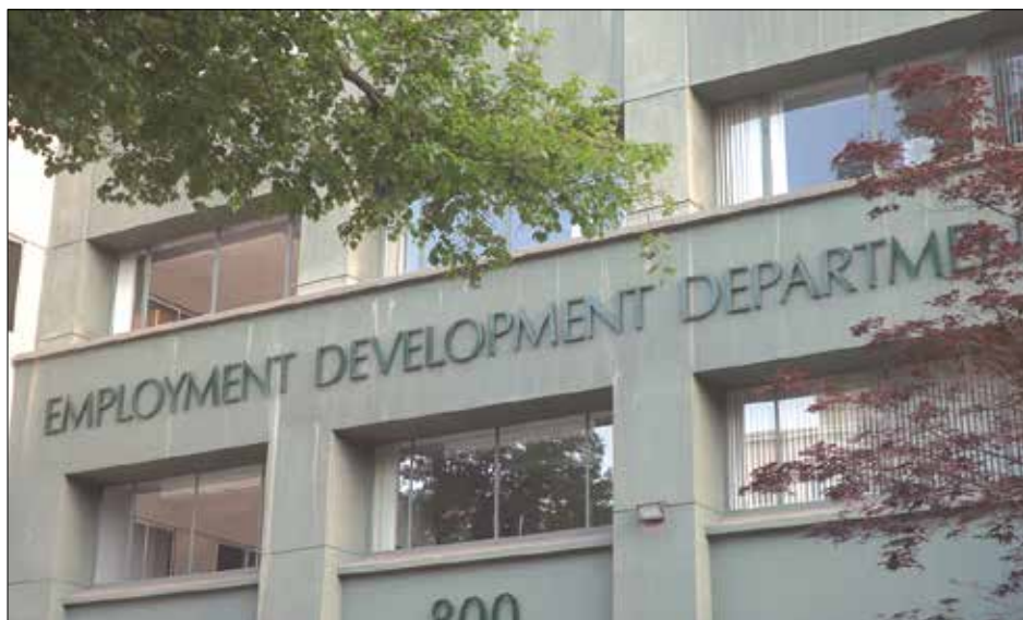
Originally, the EDD had estimated it would take only seven years to pay the debt and end the ever-growing surcharge on businesses.

That means the current EDD unemployment insurance (UI) trust fund debt of $17.6 billion dollars will grow to about $20.3 billion by the end of 2024, despite the extra $1.2 billion dollars in extra taxes, according to the agency's May UI Fund Forecast released today.