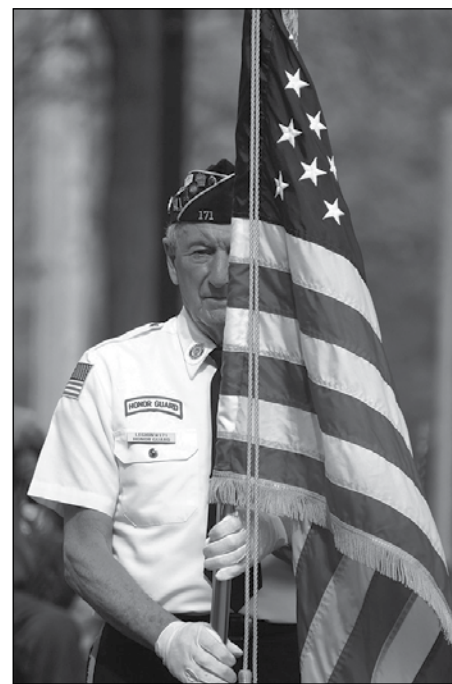
Congress changed the name to Memorial Day. And after WWII it was changed to honor all soldiers who lost their lives in all wars.

So I ask you to REMEMBER and pass that remembrance on to your children and grandchildren. Fly the flag with pride and honor and stay dedicated to what we stand for in our country... freedom! Let go of the discord we are facing on so many levels, and marvel at what the founding fathers created and the lives lost to keep that dream. At 3 PM on Memorial Day, we are all encouraged to take a moment of silence from our activities to reflect about what this day means. Please think of all those men and women who gave their lives so we could celebrate in the land of the free! God Bless them and God Bless America!!! ★