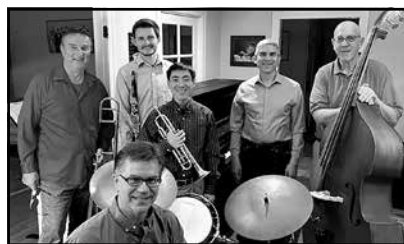
SAC JAZZ EXPRESS

Dance Floors in each Venue! Food and Beverages(full bar) Available for Purchase. Kids under 18 Free at this Family Friendly event.