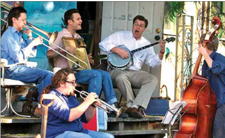
The Crescent Katz are sure to please with their performance.