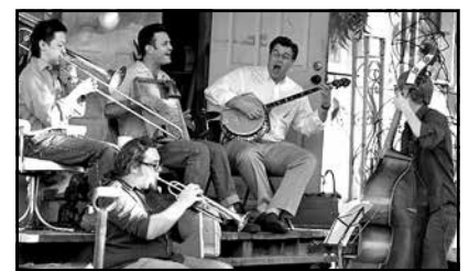
THE CRESCENT KATZ