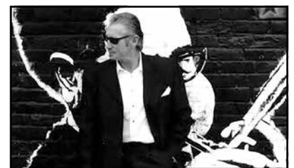
TWO-TONE STEINY AND THE CADILLACS