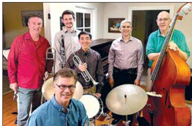
SacJazz Express will keep your toes tapping.