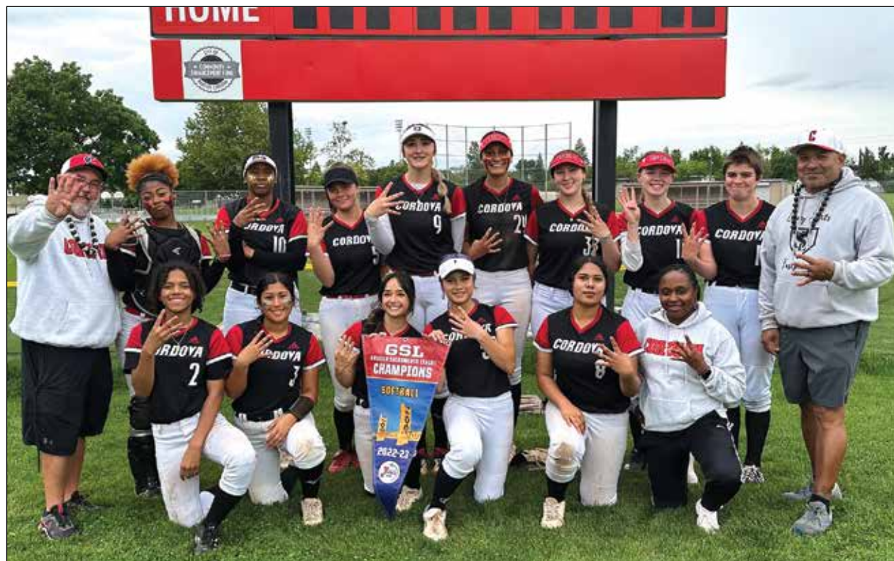
The Cordova Lancer 2023 Championship Softball Team.

Cordova Wins Fourth Straight League Championship