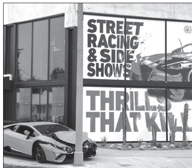
A new CHP multi-media campaign features an actual Lamborghini crashed into a light pole along Melrose Avenue in Los Angeles, Calif.

SACRAMENTO, CA (MPG) - The California Highway Patrol (CHP) is accelerating its efforts to halt illegal street racing and sideshows plaguing the state's roadways and destroying the lives of innocent victims. To increase awareness about the devastation and destruction caused by this illegal and dangerous driving behavior, the CHP unveiled a new multi-media campaign while standing amid a three-dimensional installation featuring an actual crashed vehicle along Melrose Avenue in Los Angeles.