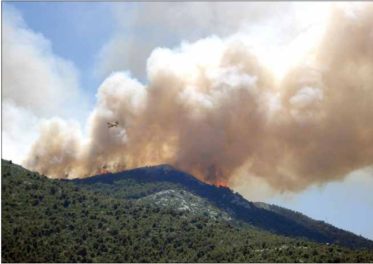
How Does Wildfire Smoke Impact Pregnancy and Children? Researchers awarded $1.35 million EPA grant to study impact of wildfire smoke on pregnancy, health, and development.