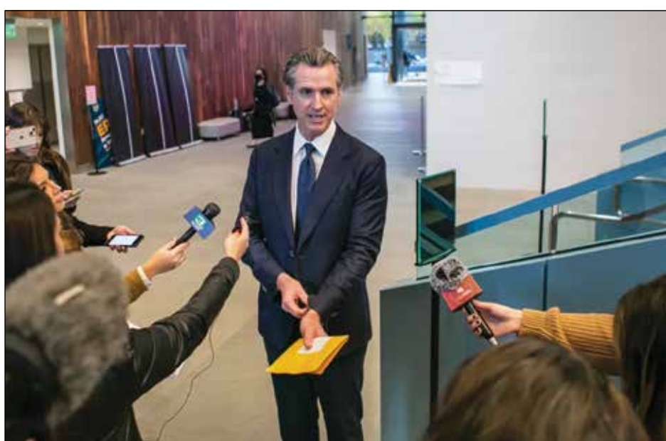
Gov. Gavin Newsom addresses the media after a meeting with local leaders on homelessness in Sacramento on Nov. 18, 2022.

Last month, the Capitol Correspondents Association of California, which represents journalists who cover the state Capitol and advocates for improved press access, distributed guidelines to its members about how to handle some of the increasingly common hurdles they encounter, including government agencies asking for questions