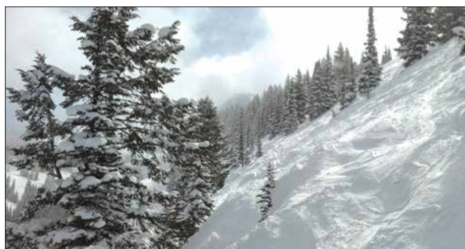
Record snowfall anticipated to bring high, fast rivers and streams this spring. State parks, Dept. of Water Resources and Cal Fire urge the public to take extra precautions as snowmelt increases.

Continued from page 1 moving into the spring and summer months.”