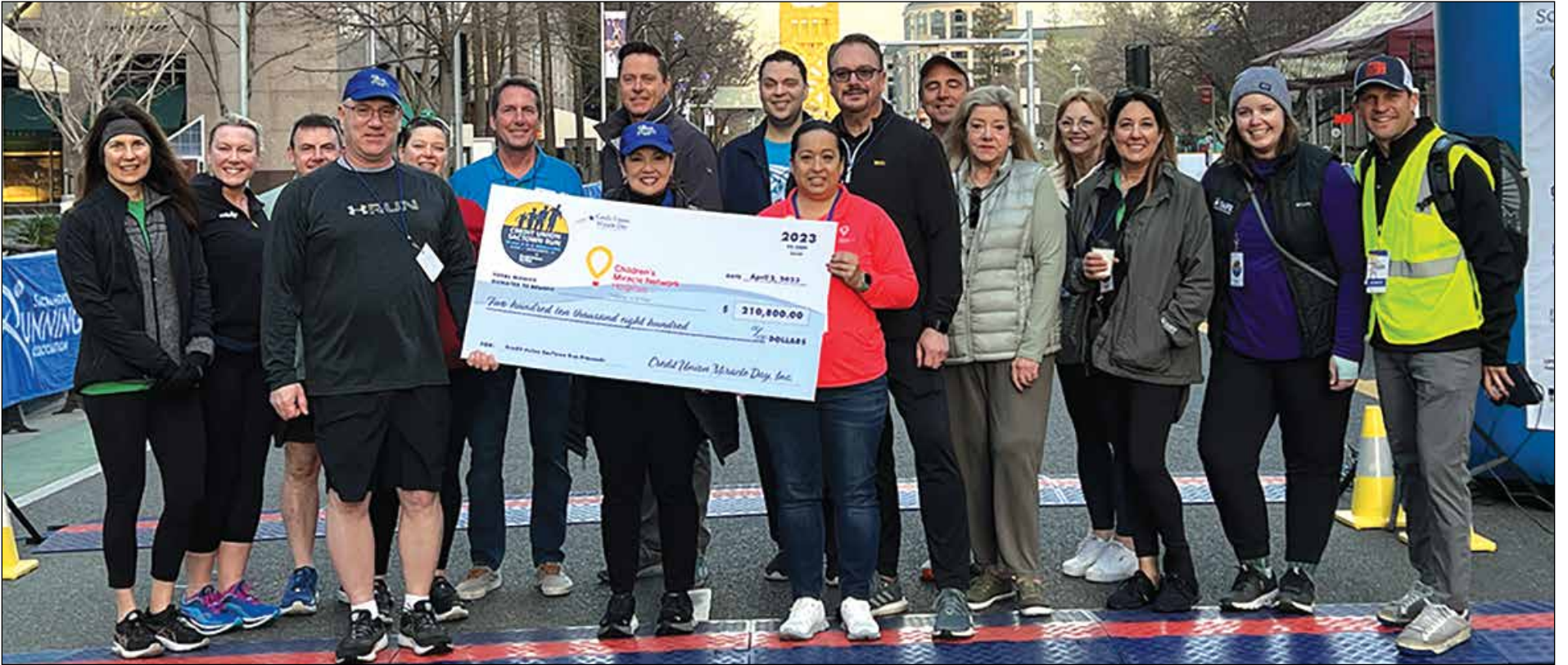
The Annual Credit Union SACTOWN Run held on Sunday, April 2, 2023, raised over $210,800 for Children's Miracle Network Hospitals (CMN) and included 69 credit unions and 1,800 runners.