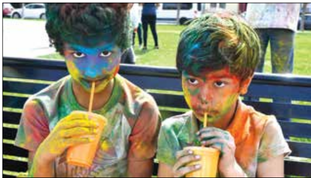
Two friends enjoy a cool drink sitting at a Village Green Park bench during the Holi Festival.