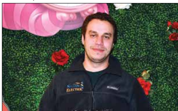
Sagan Electric was recognized for its response to the flooding of the Rancho Cordova Food Locker during the rainy season.