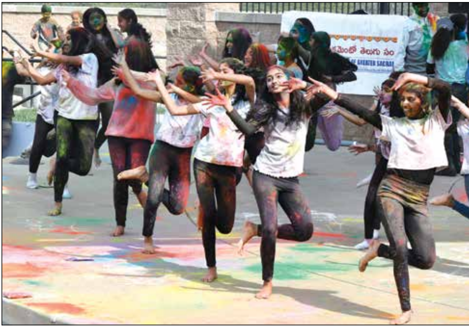
The Holi Festival celebrated in Rancho Cordova draws over 2,000 attendees from the northern California region on an annual basis.