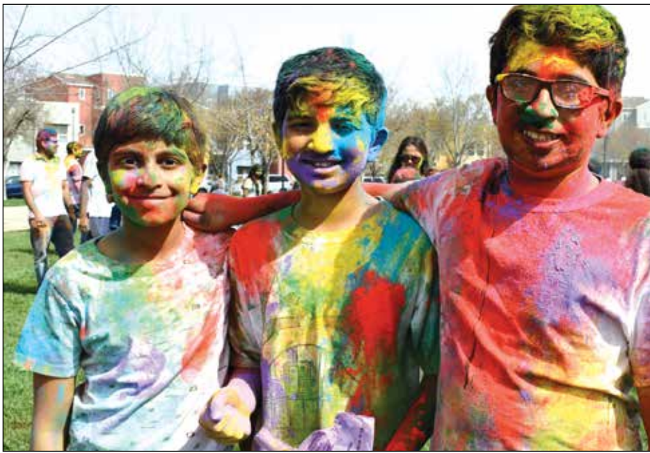
Local kids have a blast with their friends during the Holi Festival celebrated on Saturday, March 18, in Rancho Cordova.