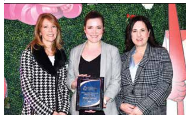
Western Contract was recognized for its response to the flooding of the Rancho Cordova Food Locker during the rainy season.