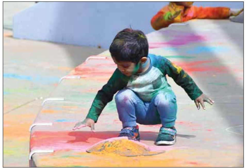
A child is introduced to the rich cultural heritage of India.