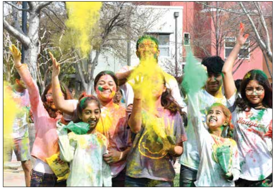
Kids play a hand in welcoming spring with a vibrant canvas of colors during the festival of Holi.