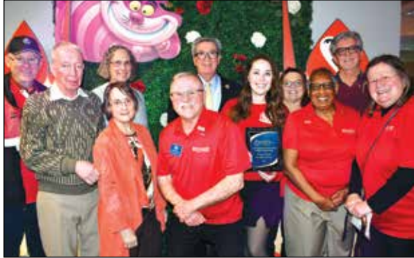
Kiwanis Club of Rancho Cordova was recognized this year for their formation of Book Buddies Club, which supplies books for children.

For detailed descriptions of contributions of award winners, visit www.cordovacouncil.org/community-volunteer-award-honorees . ★