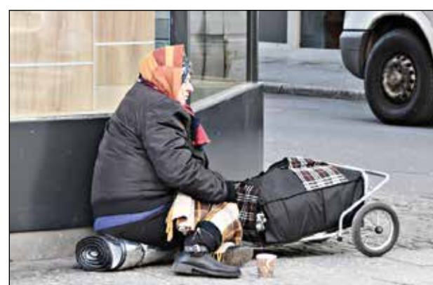
Never feel reluctant to take advantage of all of the services that can support you so you can stand on your own two feet.

You might be thinking, how can I prevent my family and I from going homeless? First, look at your immediate needs. You can call 2-1-1 in Sacramento or (916) 498-1000 for outside the area and go to: https://www.211sacramento.org/211/guided-search/ for information on over 1,600 services through the Sacramento Community Resource Directory. When you call, a caring specialist at Sacramento 211 will do a holistic evaluation of your situation and provide internal referrals to the agencies and organizations that are able to fulfill your immediate needs, whether to prevent homelessness or aid you while you are experiencing it. Your case management could involve: eviction prevention, housing subsidies, shelter, medical care, legal, elderly, veteran, financial assistance, transportation, food,