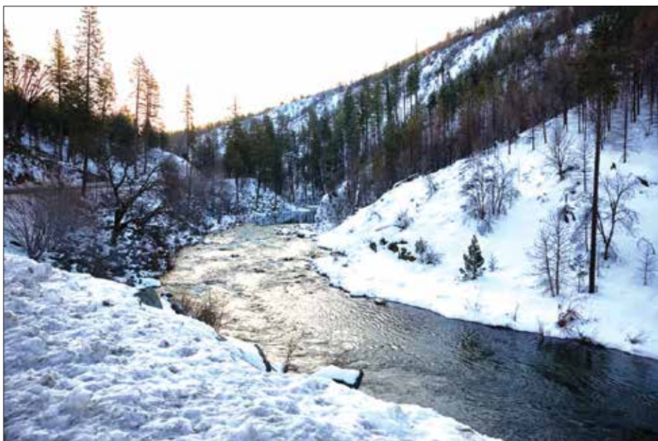
Snow melted into the South Fork of the American River in the Sierra Nevada on March 3, 2023.

The expected surge of mountain runoff forced state officials on Wednesday to open the “floodgates” of Lake Oroville and other large reservoirs that store water for millions of Southern Californians and Central Valley farms. Releasing the water will make room for the storm’s water and melted snow, prevent the reservoirs from flooding