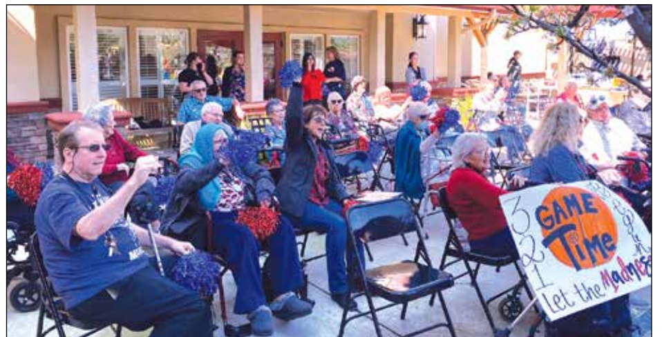
Residents of Summerset Senior Living cheer their favorite team during the 3 on 3 basketball game between the winning 'RC Police' and 'Sac Metro Fire' 11-7 match on Thursday, March 16, 2023.