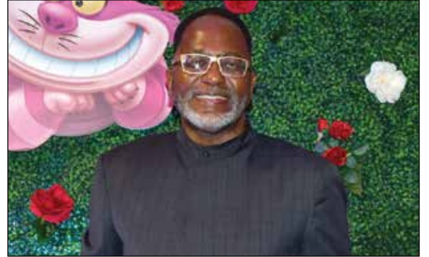
Center of Praise Ministries was awarded for Distinguished Service by a Faith Community for the donation of Rancho Cordova Youth Center.