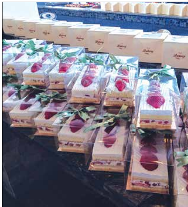
All guests to the luncheon were treated with a take home dessert.