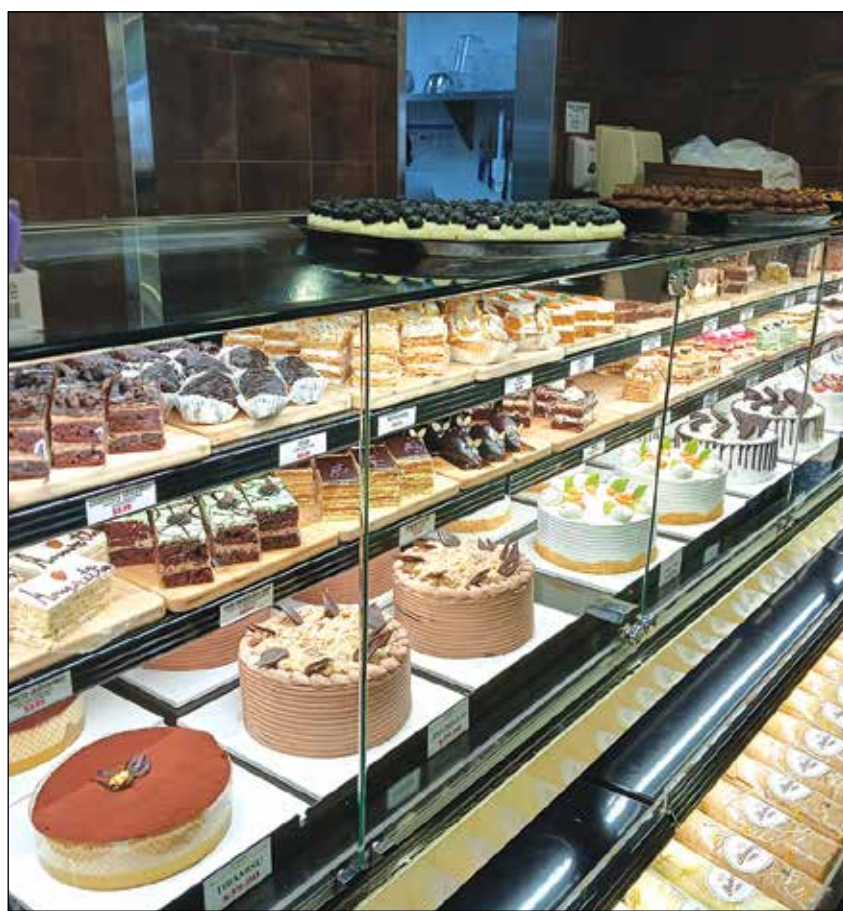
How is anyone supposed to choose from such a great selection?