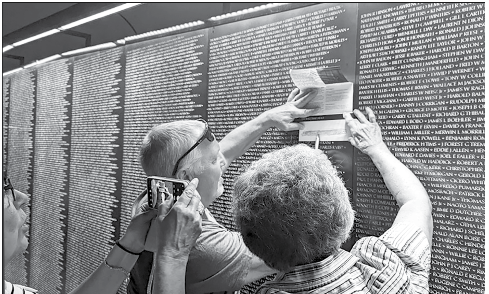
The Wall That Heals honors the more than 3 million Americans who served during the Vietnam War and it bears the names of the 58,281 men and women who made the ultimate sacrifice in Vietnam.

The Wall That Heals is transported from community to community in a 53-foot trailer. When parked, the trailer opens with exhibits built into its sides, allowing it to serve as a mobile Education Center telling the story of the Vietnam War, The Wall and the divisive era in American history.