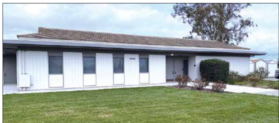
To be eligible for Nottoli Place, Sacramento County individuals of +60 years of age must be involved with Adult Protective Services.