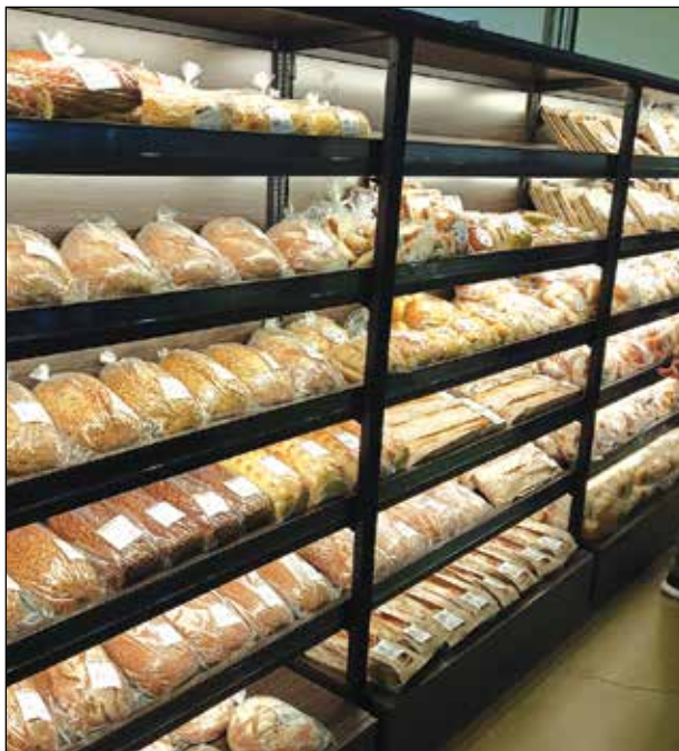
Baked breads to make your mouth water!