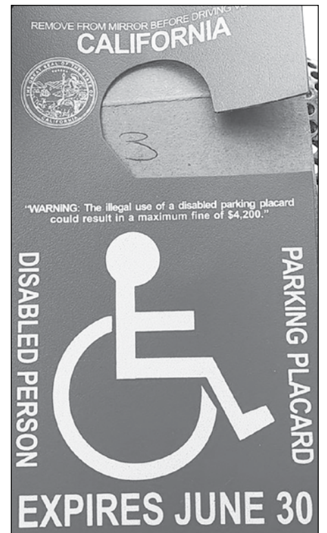
The DMV is sending notices to Californians who have had their permanent Disabled Person Parking Placard for at least six years and asking them to confirm that they are still in need of one.

This law exempts vehicles registered to veterans displaying specialized license plates from paying tolls on roads, bridges, highways, vehicular crossings, or other toll facilities. The exemption applies only to vehicles with license plates that are issued