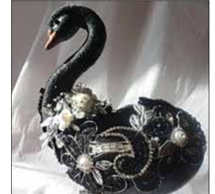
Pictured here are some examples of the fantastic artwork to be seen at this year's show.