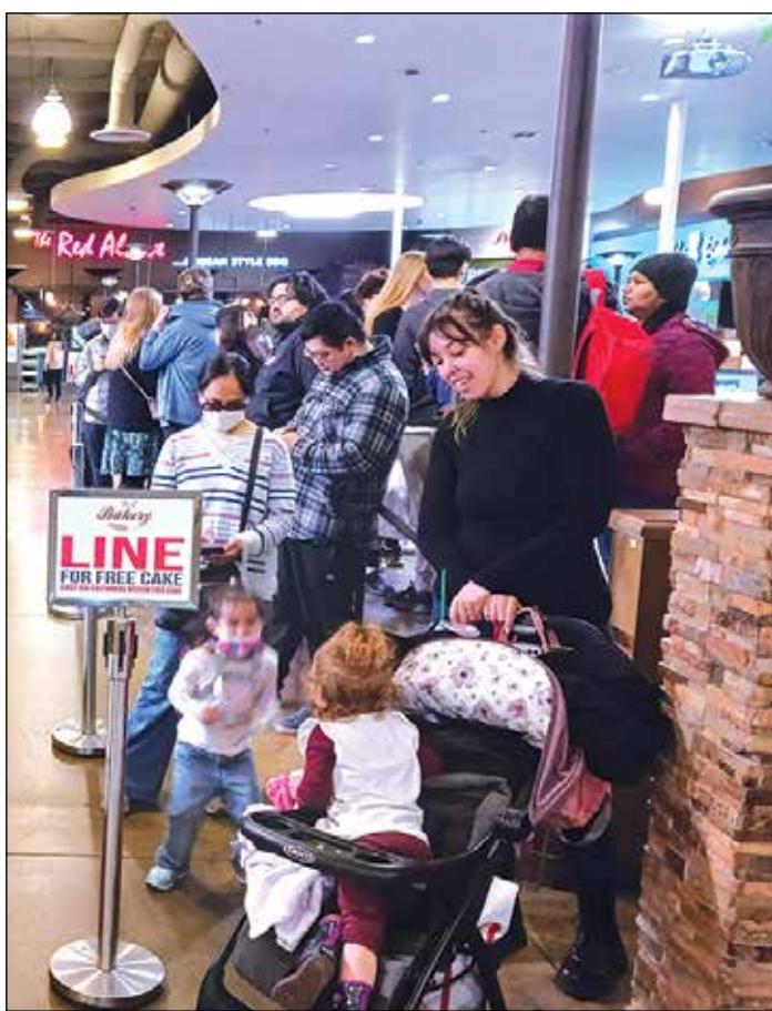
Anxious attendees can't wait to get a taste of the baked cakes and cookies.

KP International has 165 employees, with 12 being dedicated to the bakery. ★