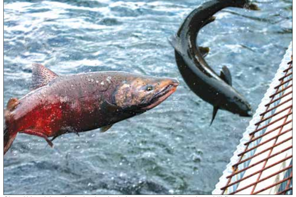
Giant Chinook leap from the river in their eagerness to follow the uphill flow.