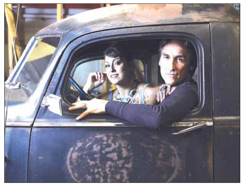
The American Pickers are coming to California in January 2023 and are looking for leads to explore hidden treasure.