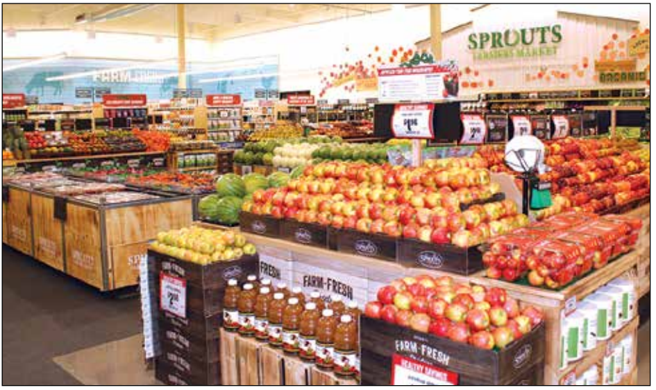
The new Sprouts Farmers Market is located at 10846 Bear Hollow Dr. in Rancho Cordova.

The Rancho Cordova Food Locker is lending a helping hand to support our community this holiday season. The annual Christmas Grocery Giveaway takes place on Monday, December 19 from 9:30 AM to 1 PM at the Food Locker, 10497 Coloma Road. All are welcome, and families will receive a cart full of groceries, including meat, produce and bread. Visit RanchoCordovaFoodLocker.org to learn more.