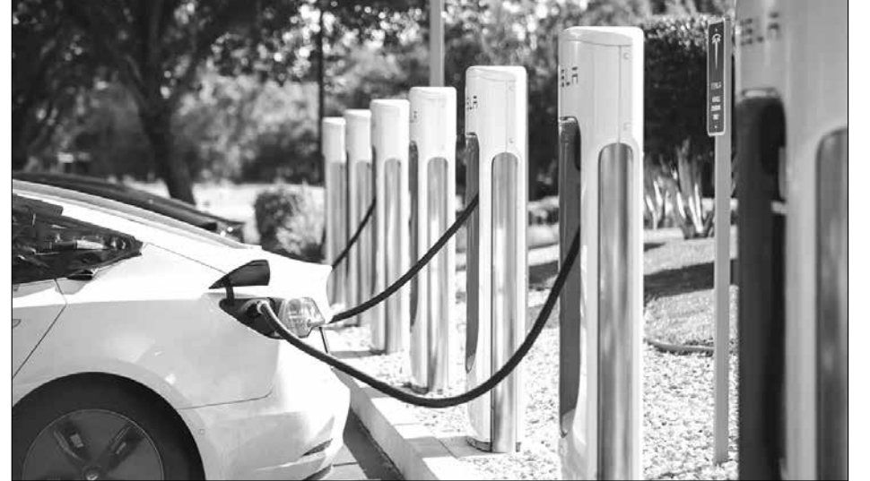
A Tesla supercharger charging station in Sacramento on July 29, 2022.

number of billionaires against it, it had complete falsehoods thrown at it, and it had the most popular Democratic leader in the state against it," she said. "And we still got 40% of the vote."