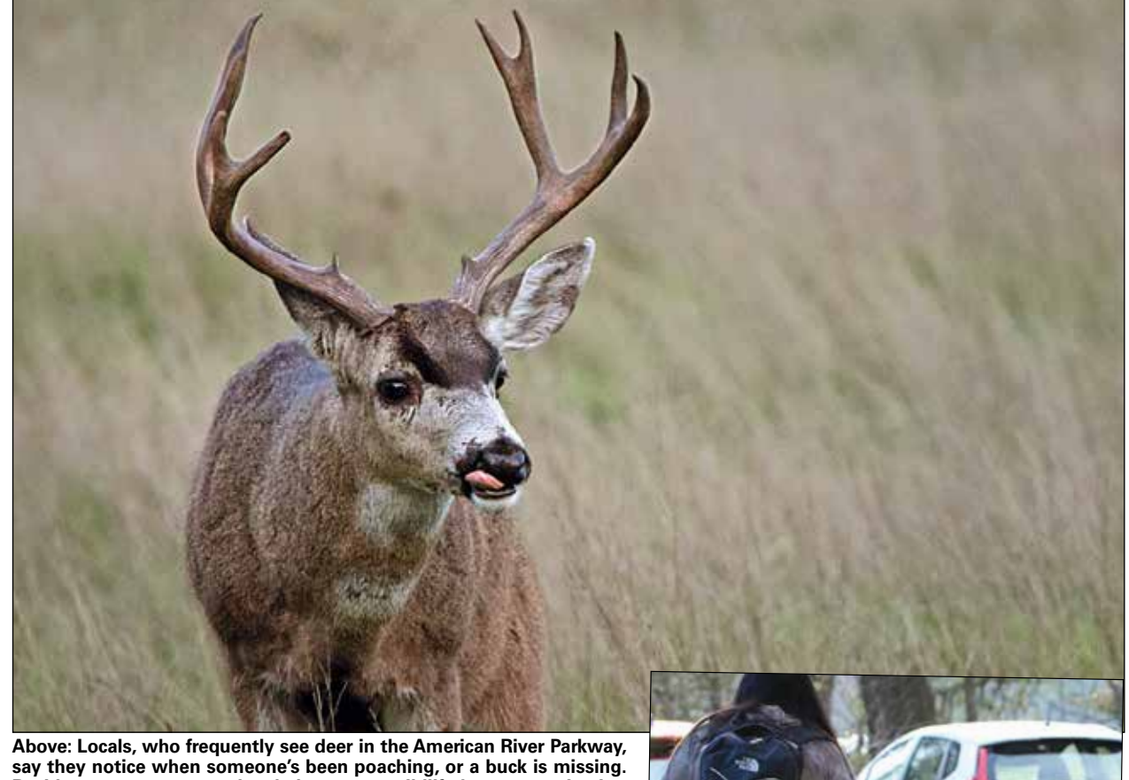
say they notice when someone's been poaching, or a buck is missing. Residents are encouraged to help protect wildlife by communicating with rangers. Right: Signs at the Effie Yeaw Nature Center alert visitors to poaching activity.