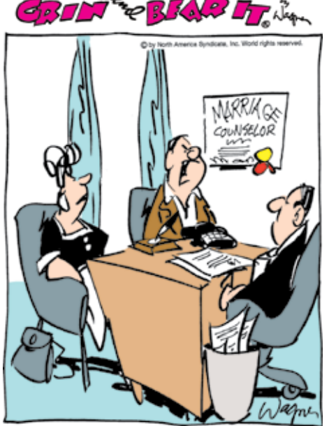
"I've been on time-out ever since the kids