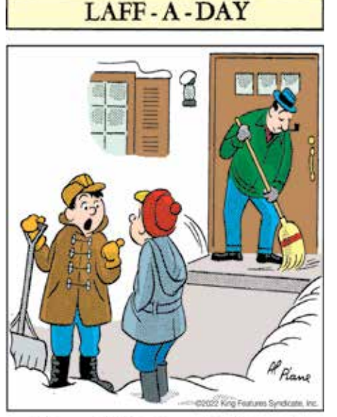
"Just once I'd like to have a job that wasn't harder to do when he was a boy."