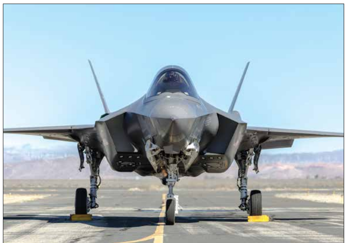
Come see the amazing F35 perform.

Tickets are only available for purchase online ahead of the show. For more information about the Afterburnin' Drive-In Airshow, visit https://californiacapitalairshow.com/friday-afterburnin-drive-in-airshow/ . ★