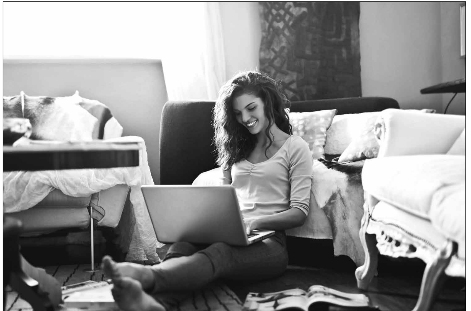
"Many employees now expect to be able to work flexibly. Some companies will use a hybrid approach, and others will go back to full-time in the office. But if employees are not given the choice to work from home, some will look for other employers that do offer that."

The WFH type. "At this point, it should be relatively easy to assess who is thriving and who