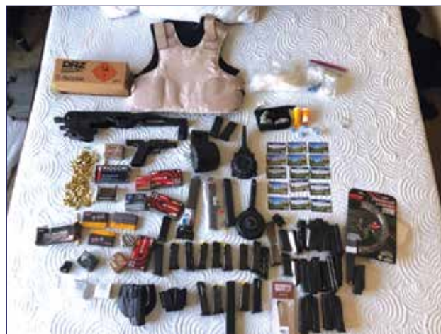
We continue to see staggering amounts of fraudulent EDD activity combined with illegal firearms in our communities.

The seized narcotics included 1.2 lbs. of methamphetamine, 19.8 grams of fentanyl, 28 grams of heroin, 24 grams of cocaine, and approximately 400 oxycodone pills. Officers also located evidence of weapons trafficking including an unregistered firearm, 42 illegal extended magazines, a large amount of