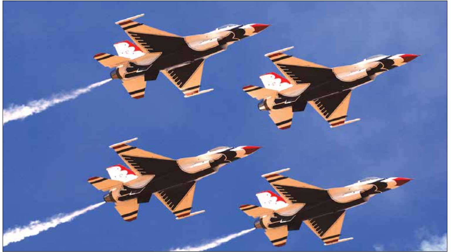
The California Capital Airshow is offering guests a new way to experience the excitement, with the Afterburnin' Drive-In Airshow on Friday, September 24. The show will feature three hours of flight performances by more than 25 military jets.

Gates will open at 2:00 PM on September 24, with opening ceremonies scheduled to start at 3:30 PM. Only 2,000 tickets are available for this unique event. Tickets are purchased per vehicle, with up to six people included in each ticket.