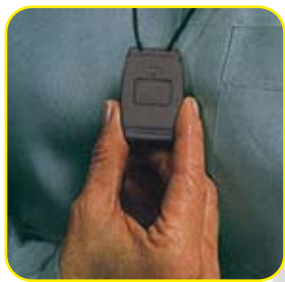
HELP AT THE PUSH OF A BUTTON!