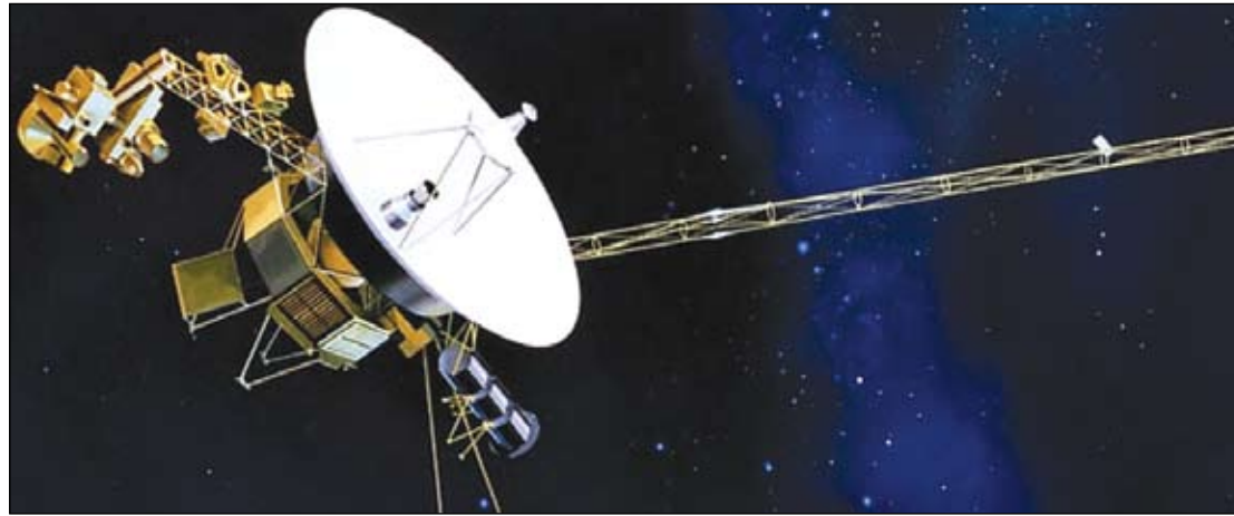
Voyager 1.