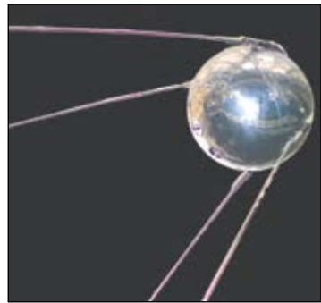
The first man-made object to leave Earth's atmosphere was Sputnik.

My family gathered around the TV to listen to Walter Cronkite announce the events of the lunar landing. My father took pictures of the television screen with his 35 mm camera – he deemed the event that important. For the first time in the history of the world, we had put spacecraft and people on the moon, exploring places which had been seen from Earth but never before been visited.