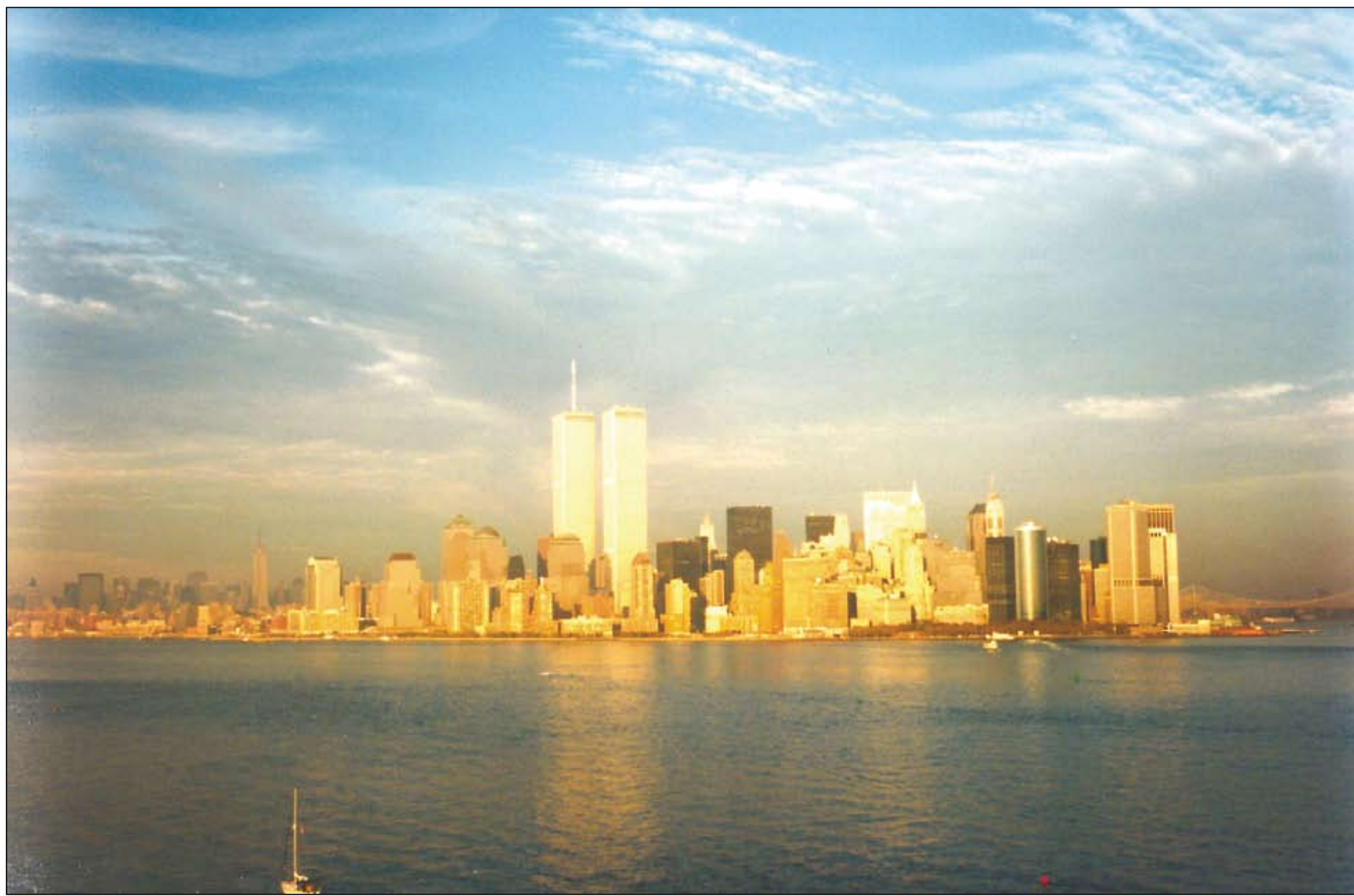
One last look of the Twin Towers and the New York City skyline from the Staten Island Ferry just a few months prior to 9/11.

Some of my friends were emergency workers and were on the scene at Ground Zero. It took months for them to even be able to talk about it. They were never the same, with "life" being taken out of them. Those