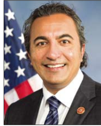
Congressman Ami Bera

SACRAMENTO COUNTY, CA (MPG) - Congressman Ami Bera, M.D. (CA-7) called for investment in Sacramento County infrastructure recently, after touring several local transportation projects with representatives from the Sacramento County Department of Transportation (SACDOT), the Sacramento Area Council of Governments (SACOG), Operating Engineers Local 3, and Laborers Local 185. The tour featured recently completed, active, and planned transportation projects near or along Highway 50 in the Rancho Cordova area.