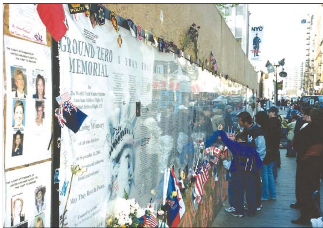
Grieving New Yorkers and visitors honored the fallen at the memorial walls surrounding Ground Zero over the following months. I read through every name on the list searching for the names of friends. A miracle, not one was listed.

9/11 should be an annual wake up call for every Ameri-