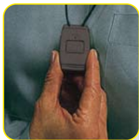
HELP AT THE PUSH OF A BUTTON!