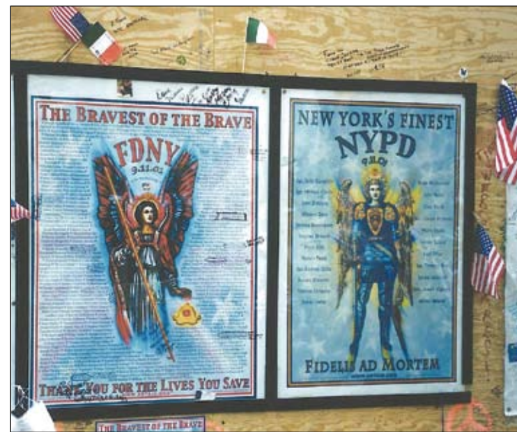
The bravest of the brave.

because we want to finish the next level of some stupid video game. We stop looking for the truth because our favorite team is on T.V. in five minutes.