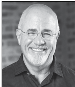
Don't Put All Your Eggs in One Basket

This article is intended for information purposes only and does not represent legal or financial guidance. It presents the opinions and interpretations of the AMAC Foundation's staff, trained and accredited by the National Social Security Association (NSSA). NSSA and the AMAC Foundation and its staff are not affiliated with or endorsed by the Social Security Administration or any other governmental entity. To submit a question, visit our website (amacfoundation.org/programs/social-security-advisory) or email us at ssadvisor@amacfoundation.org. ★