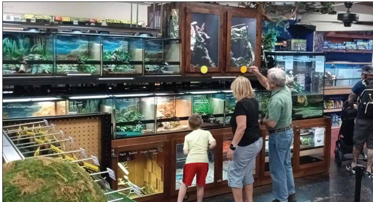
Customers shop at the Aquarium and Reptile Depot which sells a wide range of fish tanks and accessories for both salt and fresh-water environments.