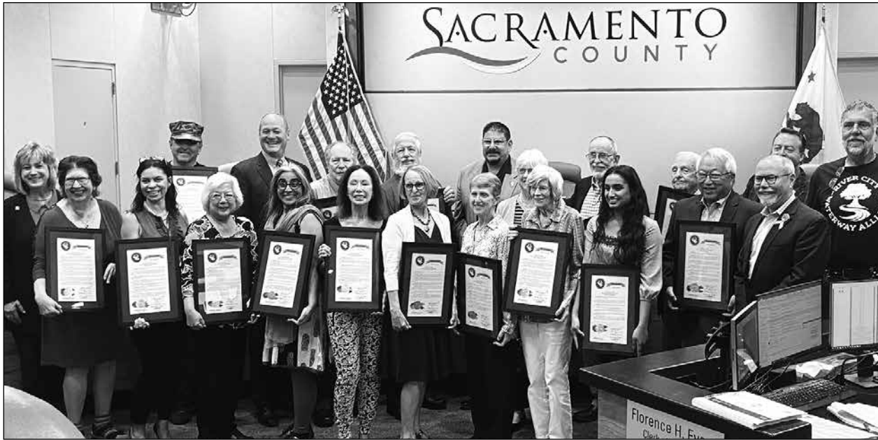
The 5 Over 50 Award recognizes volunteers in the County who are over the age of 50.