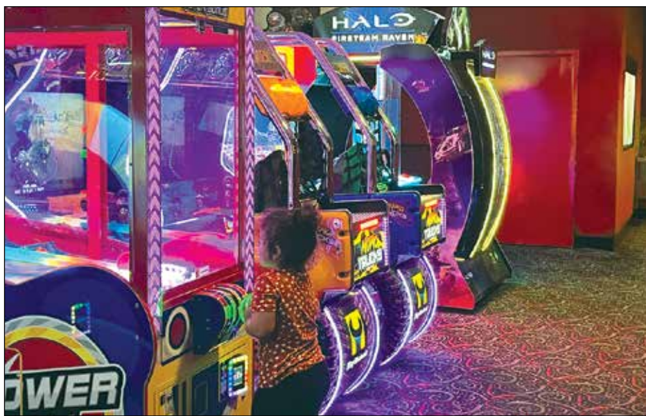
The new arcade at Sunrise Rollerland.