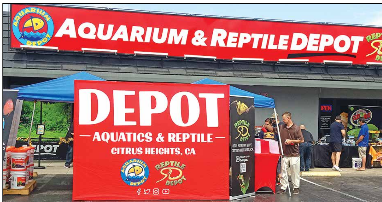
Aquarium and Reptile Depot started originally as a wholesale business and has since shifted into retail. The store celebrates its 10th anniversary.