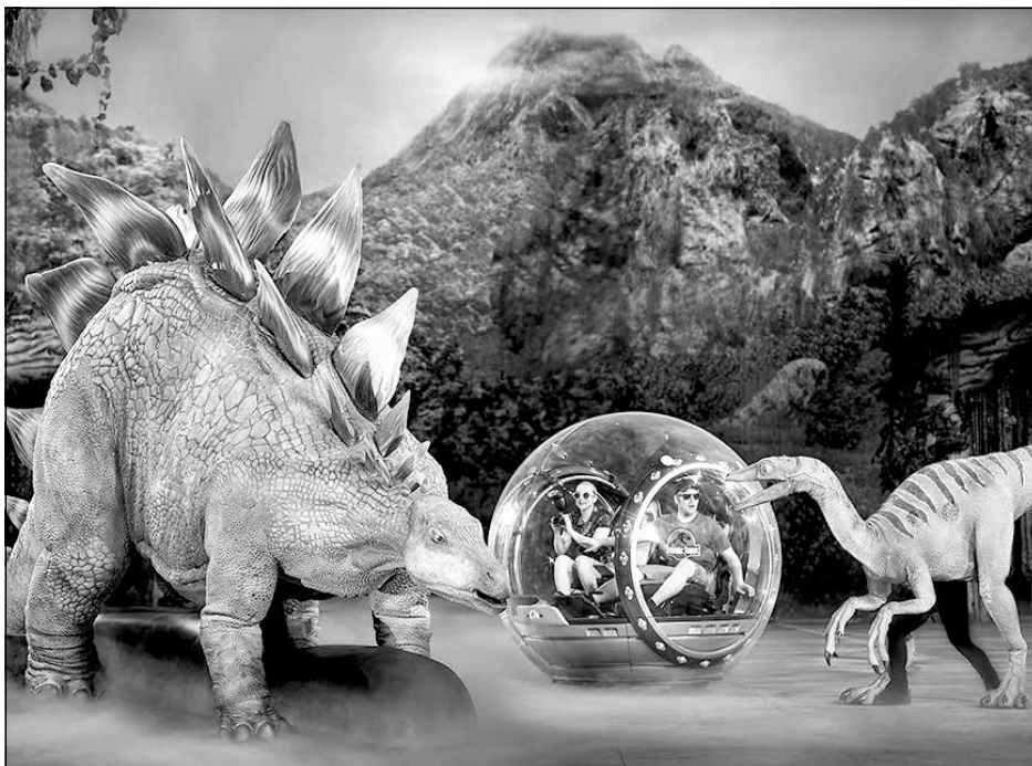
Jurassic World's unmistakable score transforms the arena into the dense jungles of Isla Nublar, where real Gyrospheres roll through the valley and scientists explore the lost world.