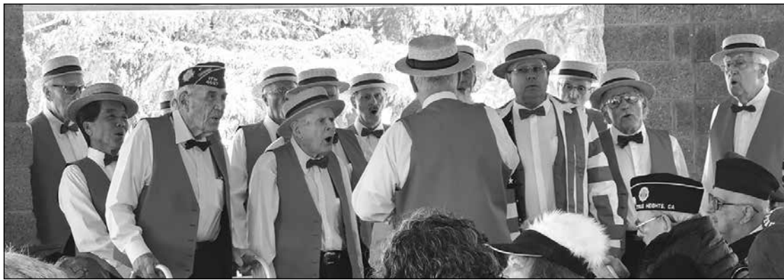
The Harmony Express Men's Choral performs the Armed Forces Medley during the Sylvan Cemetery Memorial Day observance on May 29, 2023.

values and principles upon which our nation was built. We hold others' needs before our own. Those we honor understood the true meaning of duty and knew that freedom is not free.