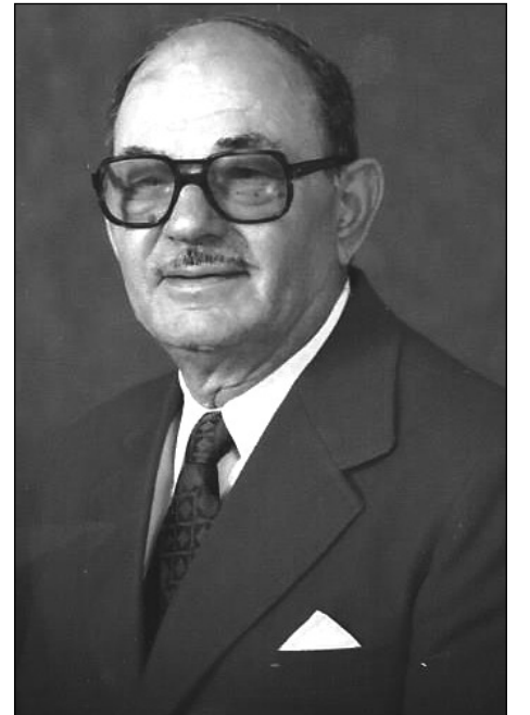
I think it's important to realize that dads do have a significant influence on their daughter's life. My dad taught me to never give up, no matter what the situation. I would like to think he would be proud of my accomplishments today.

He worked long and hard, lying about his age to get whatever job he could get. I don't have enough time to share the whole story, but he became a Furrier and made it to Metro Golden Mayer studios in Hollywood to design fur coats for the stars including Betty Davis. When ulcers took their toll on his health, he worked his way up to making airplane wings in a plant and then turned to, of all things, taking on the arduous task of becoming an Ironworker. Yup, walking