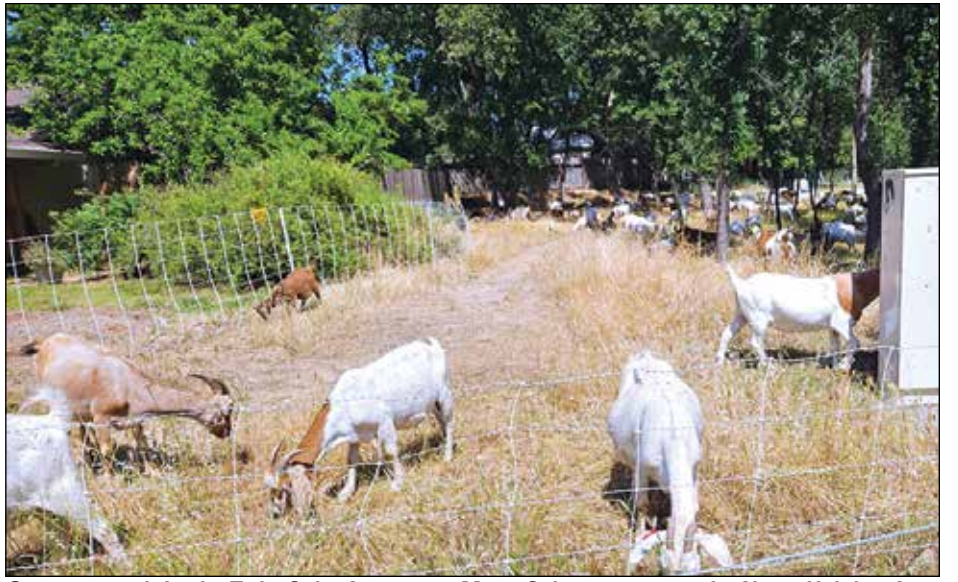
Goats at work in the Twin Oaks-Crestmont-Moss Oak open spaces in Citrus Heights Area Seven, Eight and Nine.