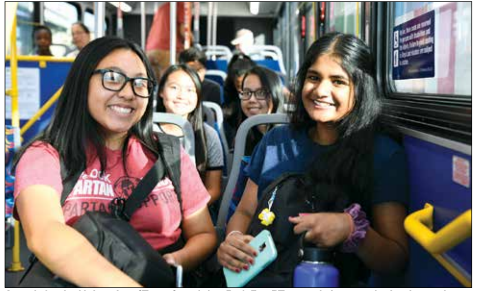
A study by the University of Texas found that RydeFreeRT not only improved school attendance, but it also reduced transportation barriers to get to jobs, internships and extracurricular activities.

To learn more about Family Health and Fitness Day and how parks help keep our communities and families healthy and active, visit the Regional Parks website. ★