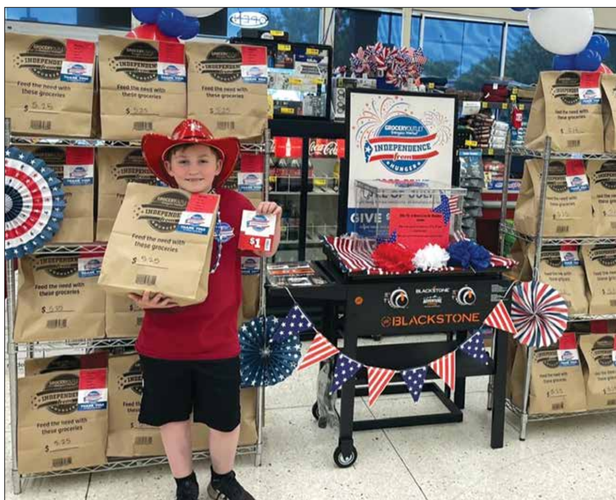
Citrus Heights Grocery Outlet kicks off thirteenth annual 'Independence from Hunger' Food Drive campaign this June 28 to July 31, 2023.

Grocery Outlet Joins Sunrise Christian Food Ministry this Summer