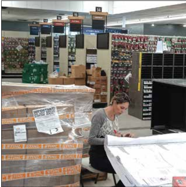
The interior aisles of the new Citrus Heights Miller's Ace Hardware.

The shopping plaza, Almond Orchard, is owned