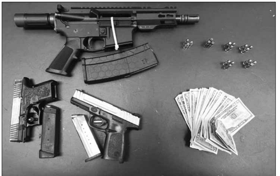
Officers located a rifle and two pistols possessed by the felon, and he was booked additionally for possession of ammunition, negligent discharge of a firearm, possession of narcotics and driving under the influence of narcotics.