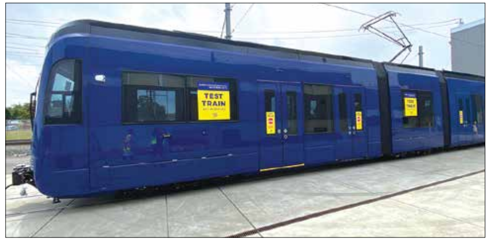
Image of new S700 low-floor light rail train at SacRT light rail facility.