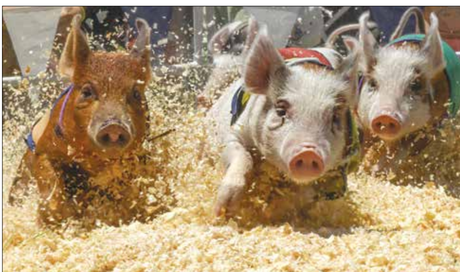
The All-Alaskan Racing Pigs competition is a popular, crowd-pleasing event suitable for all ages at this year's fair.