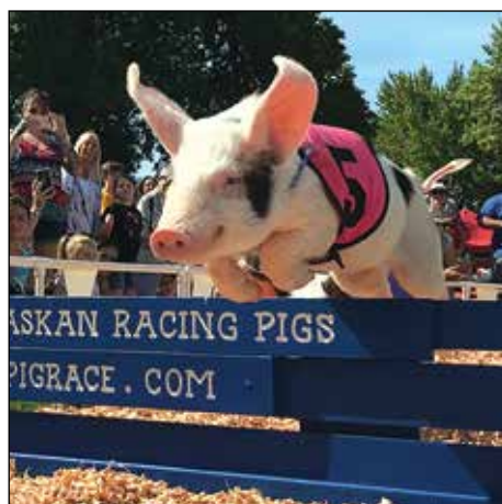
Watch the All-Alaskan Racing Pigs jump obstacles and race to the checkered flag at this year's Sacramento County Fair.