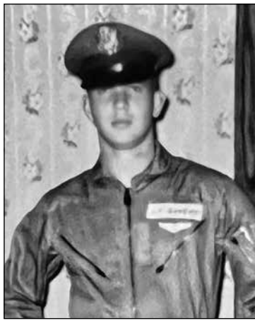
Capt. Mel Savery, USAF.