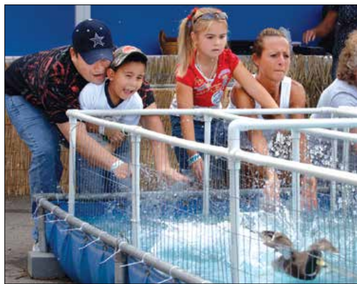
Above and left: The All-American Duck Races show off the high-speed capabilities of the mallard at the 2023 Sacramento County Fair.