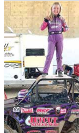
Youth RZR Racing gives young locals the opportunity to race their off-road vehicles around an extreme course.

Sacramento County Fair is just as eager to have these 'big boys' return to the Fair. "What better way to kick off Memorial Day weekend than with some of the toughest monster trucks anywhere at the Sacramento County Fair? Trucks are louder and BIGGER than ever, bringing kids of all ages the classic Fairground entertainment that we all crave," says Cranford.