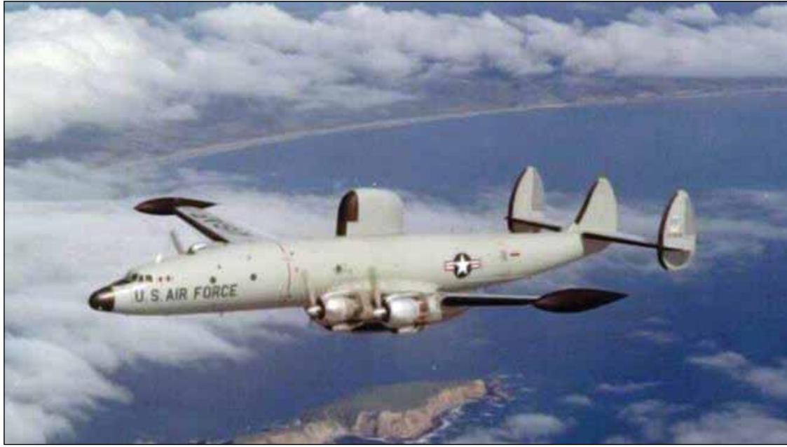
A Lockheed EC-121 Constellation Warning Star was a radar equipped aircraft once flown by US Air Force Major Don Stroup of Roseville and US Air Force Captain Mel Savery as part of the nation's early warning system during the Cold War with the USSR.