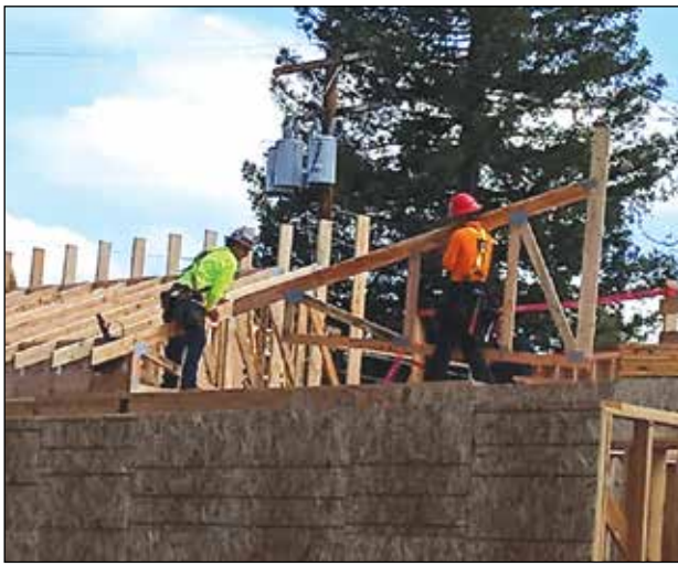
Bobo Construction workers set the trusses for the FORPD Measure J bond-funded construction project.

and significant improvements to Village and Plaza parks. Current work at the Community Clubhouse includes electrical and duct work improvements - and lighting installation preparation, storm drain trenching and placement, electrical installation, and other utility work is happening throughout the site. When all the work is complete, the various Village amenities will be transformed into an interconnected park complex.