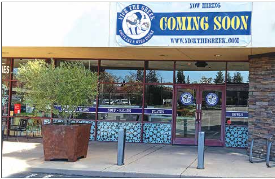
Nick the Greek's Fair Oaks location at 5355 Sunrise Blvd., in the Quail Pointe shopping center.