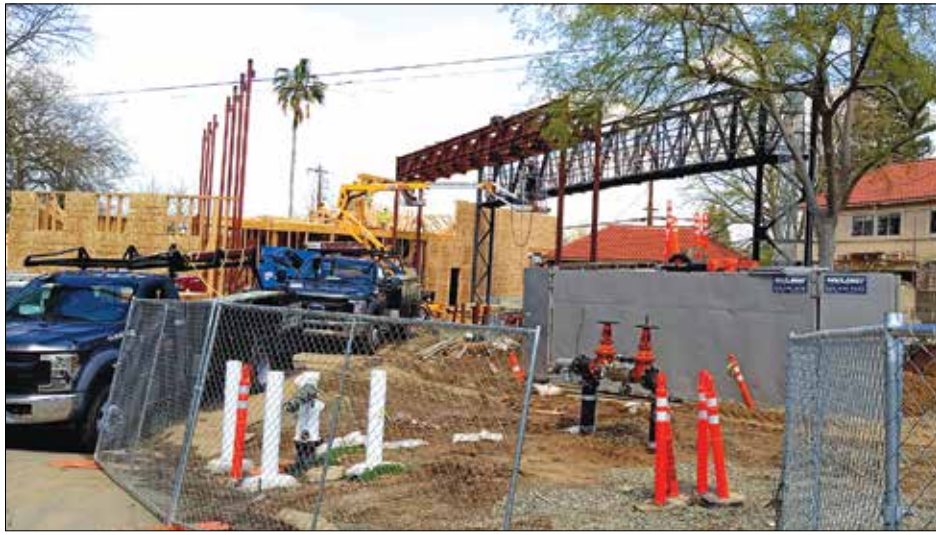
Above and below: Dramatic progress is made on the new Veterans Memorial Amphitheatre, as the walls and roof trusses have gone up, allowing Village visitors to see the building take shape before their eyes.