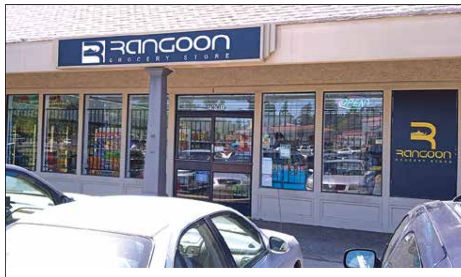
Rangoon Grocery Store is now open daily at 7601 Sunrise Boulevard in Citrus Heights.

"We're delighted that our customers have now discovered us," said