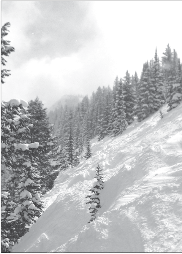
Record snowfall anticipated to bring high, fast rivers and streams this spring. State parks, Dept. of Water Resources and Cal Fire urge the public to take extra precautions as snowmelt increases.