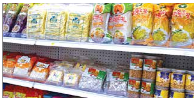
Rangoon Grocery Store's product offerings reflect the cultural heritage of the largest city in Myanmar, serving Asian groceries, noodles and popular snacks to the local neighborhood.

The Rangoon Grocery at 7601 Sunrise Boulevard in Citrus Heights is open daily, Monday through Sunday from 9 am to 8 pm. Call 916-910-9994 for more information. ★