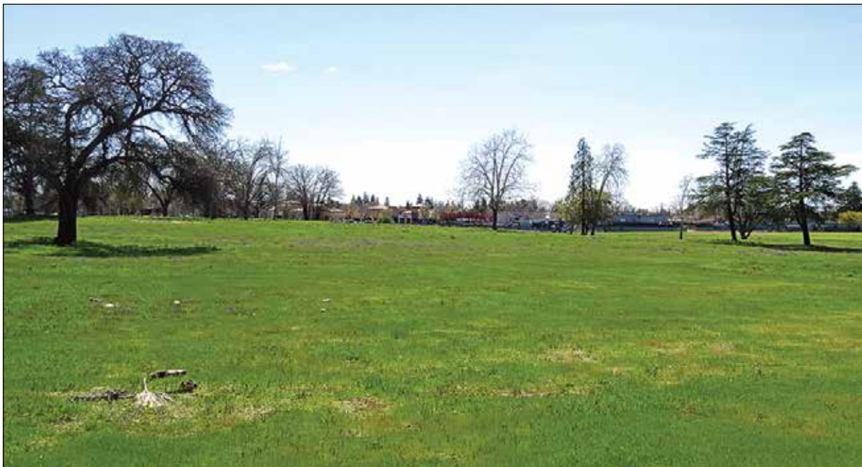
The 11.3-acre site was purchased by the City of Citrus Heights in 2019 from the San Juan Unified School District.