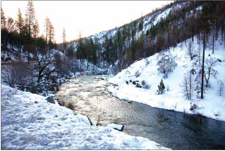
Snow melted into the South Fork of the American River in the Sierra Nevada on March 3, 2023.