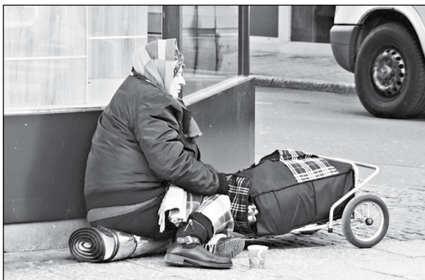
Never feel reluctant to take advantage of all of the services that can support you so you can stand on your own two feet..

You might be thinking, how can I prevent my family and I from going homeless? First, look at your immediate needs. You can call 2-1-1 in Sacramento or (916) 498-1000 for outside the area and go to: https://www.211sacramento.org/211/guided-search/ for information on over 1,600 services through the Sacramento Community Resource Directory. When you call, a caring specialist at Sacramento 211 will do a holistic evaluation of your situation and provide internal referrals to the agencies and organizations that are able to fulfill your immediate needs, whether to prevent homelessness or aid you while you are experiencing it. Your case management could involve: eviction prevention, housing subsidies, shelter, medical care, legal, elderly, veteran, financial assistance, transportation, food,