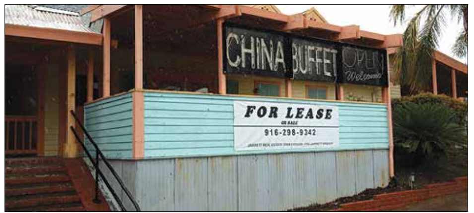
The former China Buffet has been leased for a future Asian fusion-themed restaurant at 5623 Sunrise Boulevard in Citrus Heights.