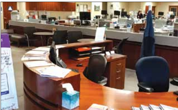
The Fair Oaks Vitalant center at 11713 Fair Oaks Boulevard, which received interior repairs, has 15 donation stations. It is located near Fair Oaks Boulevard and Madison Avenue in the Almond Plaza.