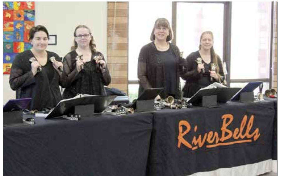
The RiverBells will be presenting a workshop on Saturday, April 1st prior to the "Spring Ring" concert at Centennial United Methodist Church in Sacramento.

Come join RiverBells on Saturday, April 1st, at Centennial United Methodist Church, 5401 Freeport Blvd, Sacramento, CA 95822, USA. ★