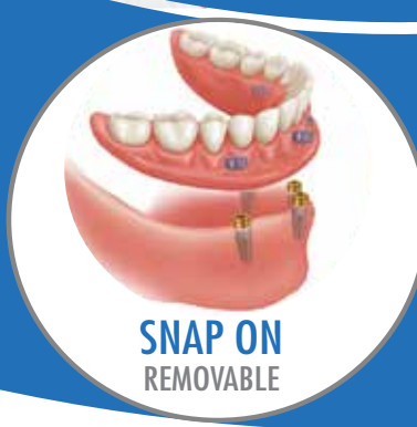
SNAP ON REMOVABLE