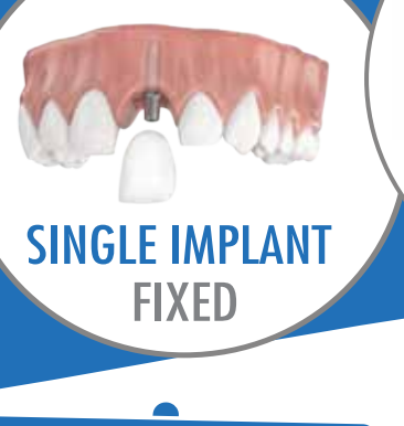
SINGLE IMPLANT FIXED