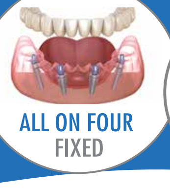
ALL ON FOUR FIXED