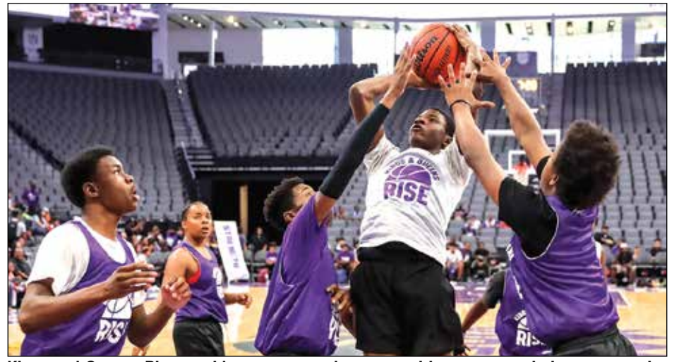
Kings and Queens Rise provides young people opportunities to engage in intercommunity activities, which help prevent and interrupt violence.