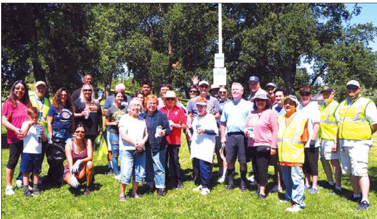
Community Park Cleanup Day Volunteers drink their Kona ice drinks after the work was done.