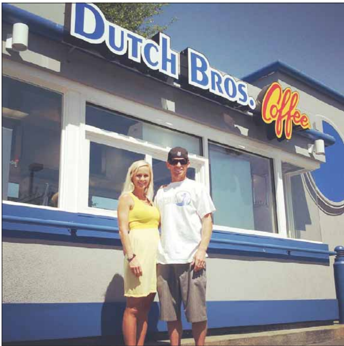
Dutch Bros. Coffee is giving away FREE drinks all day July 13th at its new Citrus Heights location.