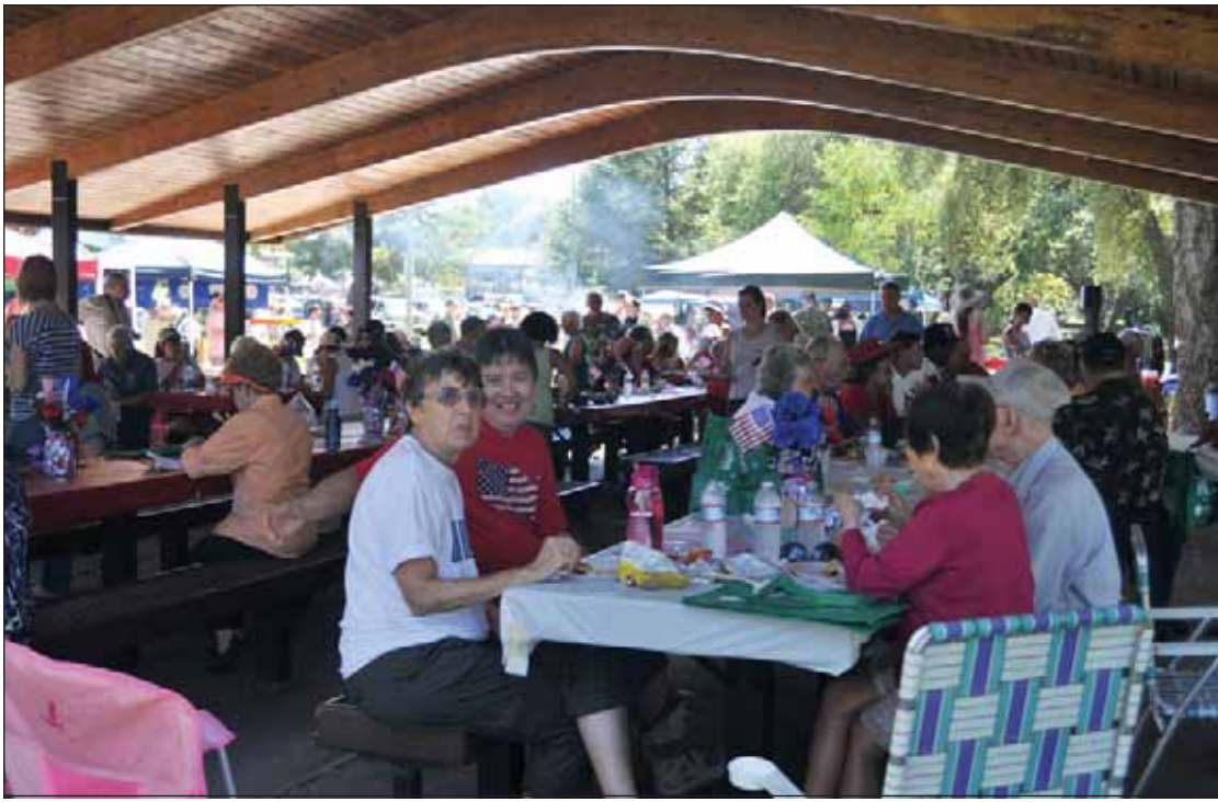
Last year's event was enjoyed by all.