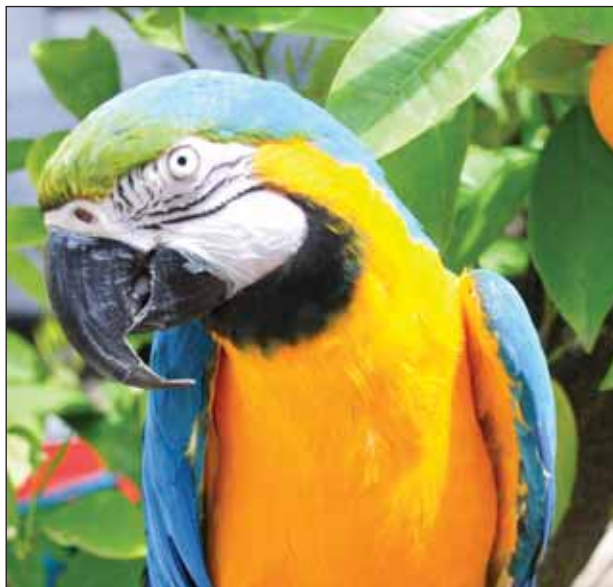
Abused or abandoned feathered friends need your help!

Mickaboo is hosting a free adoption fair on Sunday, March 18, 2012, 11 am - 4 pm at the Carmichael Public Library, 5605 Marconi Avenue, Carmichael. Take advantage of this chance to meet and greet some of the many birds that are up for adoption. Bird care supplies and a free basic bird care class will be available.