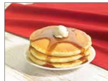
National Pancake Day benefits Children's Miracle Network Hospitals.

SACRAMENTO REGION – For the seventh consecutive year, IHOP restaurants nationwide will offer each guest a free short stack of its famous buttermilk pancakes on National Pancake Day in an effort to raise awareness and funds for Children's Miracle Network Hospitals.