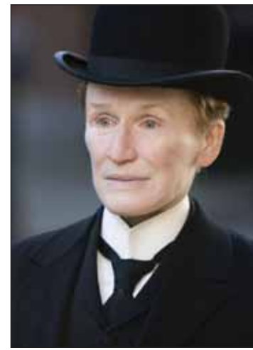
Glenn Close as Albert Nobbs

For 30 years Albert has worked as a devoted and rigid hotel butler, fooling everyone from gossip staff to snooty guests. She lives an isolated