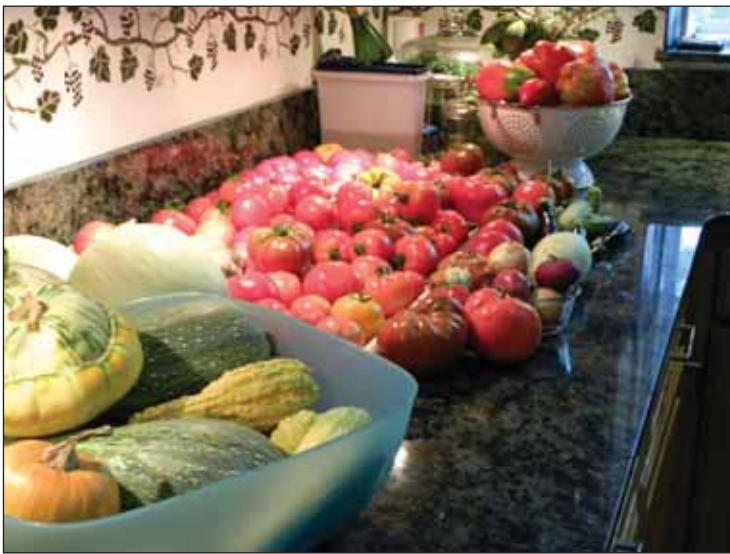
Pick your ripe vegetables early in the day and pick them often.