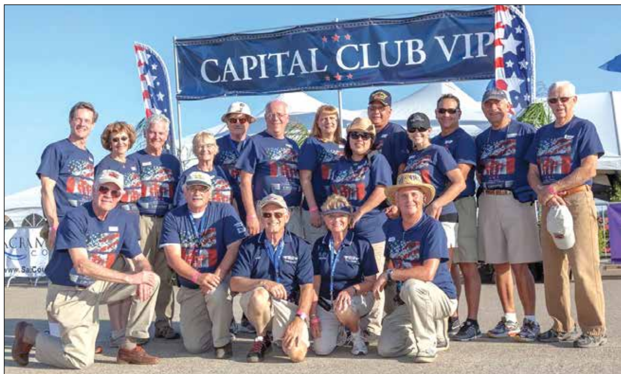
Community members are invited to learn more about exciting volunteer opportunities at the California Capital Airshow.