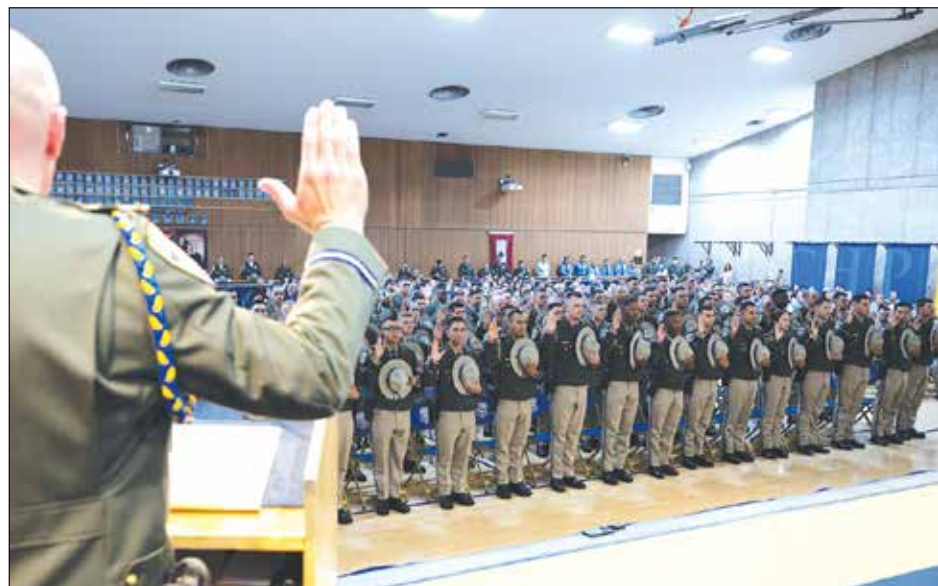
CHP Commissioner Sean Duryee swears in 101 CHP officers during a graduation ceremony at the CHP Academy in West Sacramento.

The mission of the California Highway Patrol is to provide Safety, Service, and Security. ★