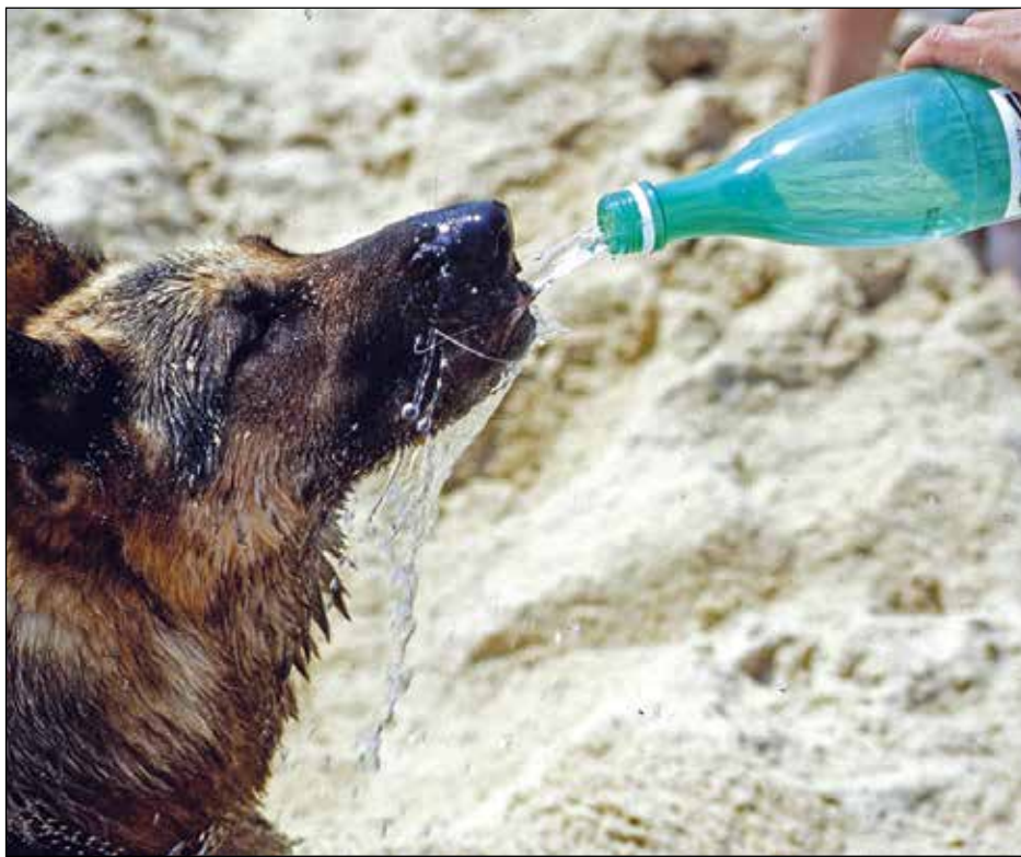
As the mercury rises, it's important for pet owners to take proactive steps to ensure the well-being and safety of their beloved four-legged companions. This summer, make sure you're aware of the potential dangers posed by extreme heat.