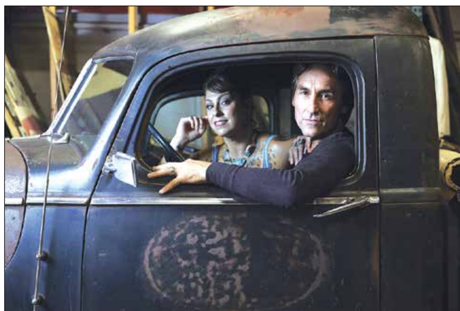
Follow Mike Wolfe and Danielle Colby as they hunt for America's most valuable antiques in the hit show American Pickers.