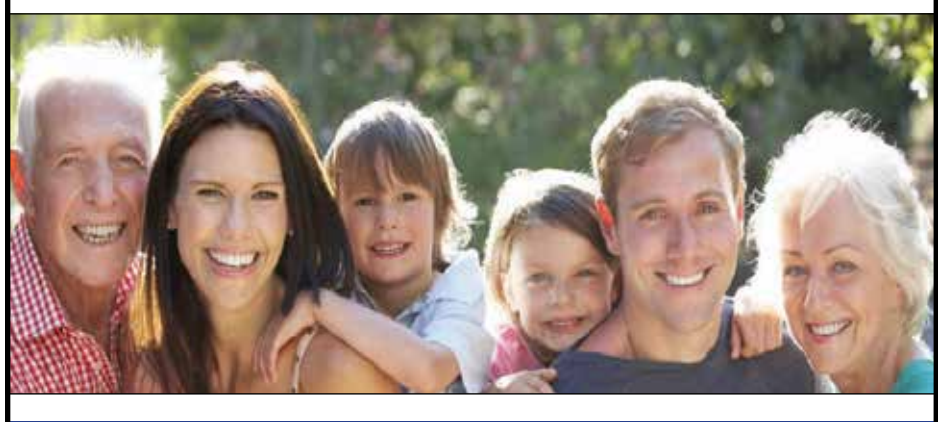
All-inclusive monthly memberships from $35-$55 per visit. CALL or TEXT us today!