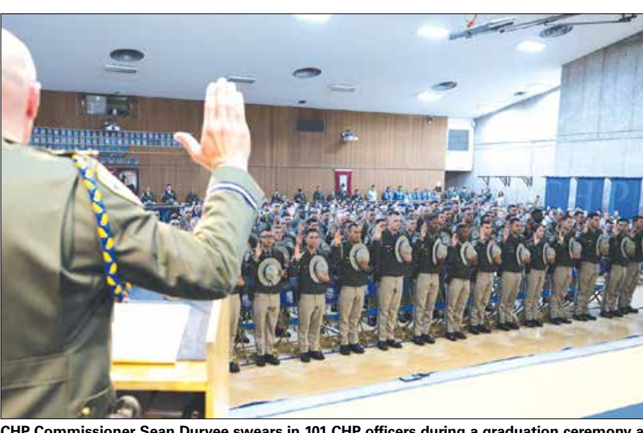
CHP Commissioner Sean Duryee swears in 101 CHP officers during a graduation ceremony at the CHP Academy in West Sacramento.

CHP Cadet Training Class I-23 is one of six