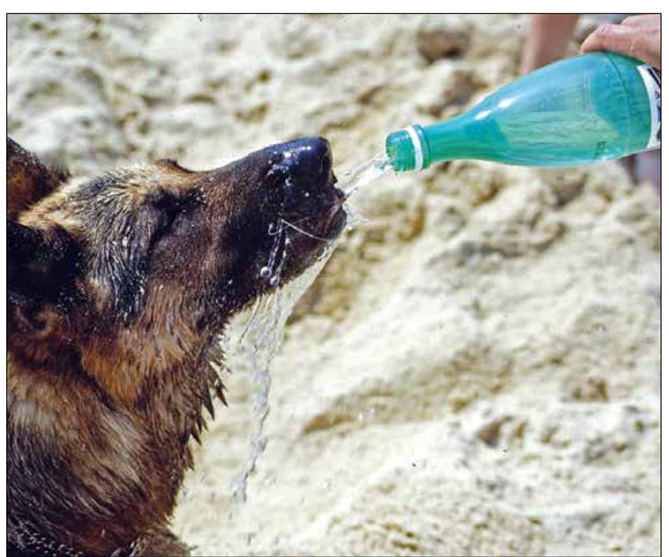
As the mercury rises, it's important for pet owners to take proactive steps to ensure the wellbeing and safety of their beloved four-legged companions. This summer, make sure you're aware of the potential dangers posed by extreme heat.

like people, and if your pet has light skin