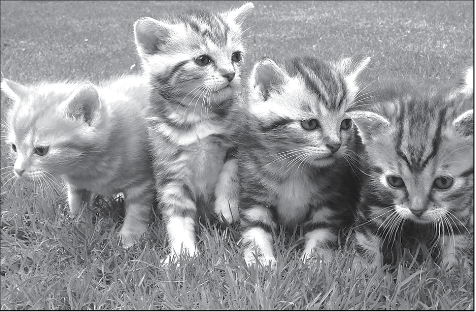
The Bradshaw Shelter's Foster Care Program helps save lives and space during this hectic season.

Continued from page 1 pads, Small nursing bottles, Miracle nipples, Kitten dry food and wet food. Donations are accepted