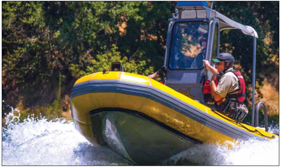
Sacramento County warns those wanting to get in the waters of the American Rivers that cold waters combined with swift flows are a recipe for disasters.