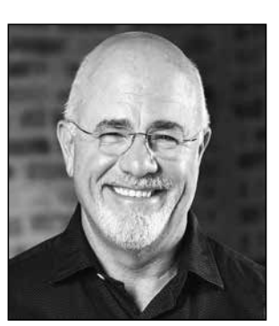
Just Pile Up Money, And Go Do It

This article is intended for information purposes only and does not represent legal or financial guidance. It presents the opinions and interpretations of the AMAC Foundation's staff, trained and accredited by the National Social Security Association (NSSA). NSSA and the AMAC Foundation and its staff are not affiliated with or endorsed by the Social Security Administration or any other governmental entity. To submit a question, visit our website (amacfoundation. org/programs/social-security-advisory) or email us at ssadvisor@amacfoundation.org. *