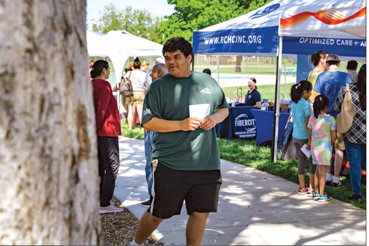
A member of CRPD's Teen Adventure Group (TAG) walks through the celebration.

Environmentalists and Senior Resource Fair Goers Make Friends