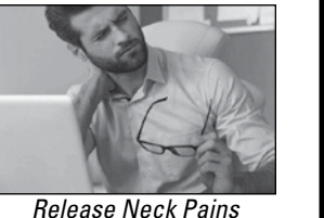
Release Neck Pains