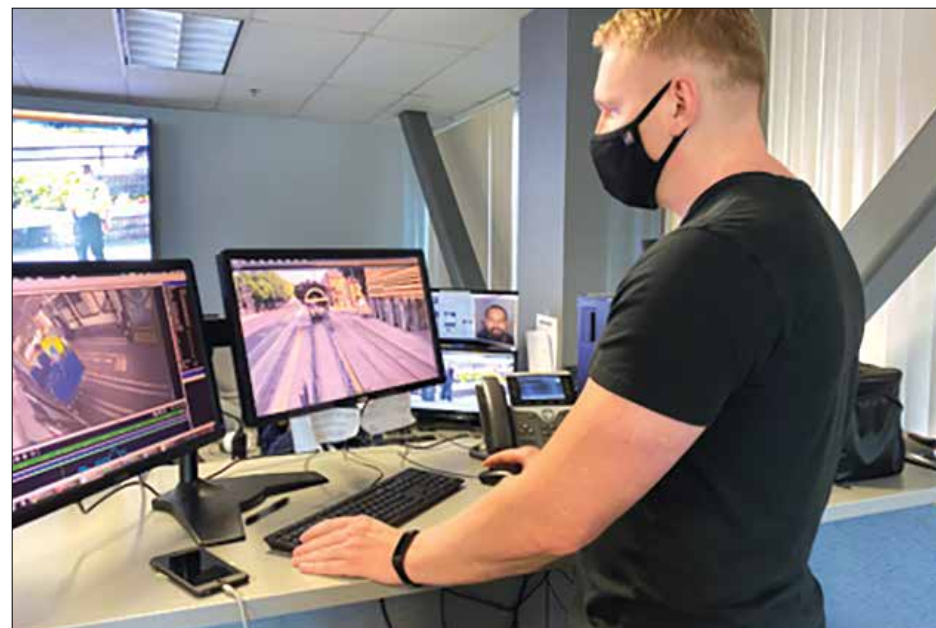
SacRT Receives TSA Gold Standard Award for Transit Security and Emergency Preparedness Programs.