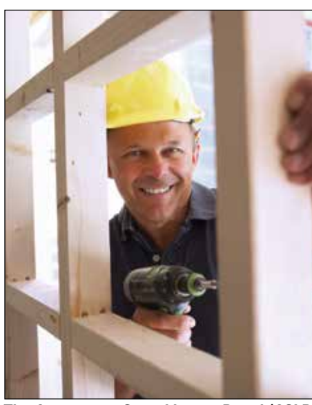
The Contractors State License Board (CSLB) is reminding homeowners to use licensed contractors for any construction repairs above $500.