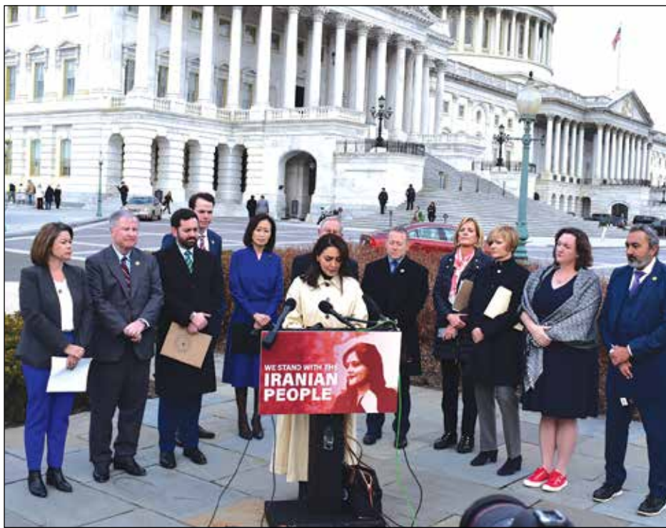
Ami Bera, M.D. (D-CA) and Kevin Kiley (R-CA) participated on January 27, 2023, in a bipartisan event at the U.S. Capitol in support of human rights protestors in Iran.