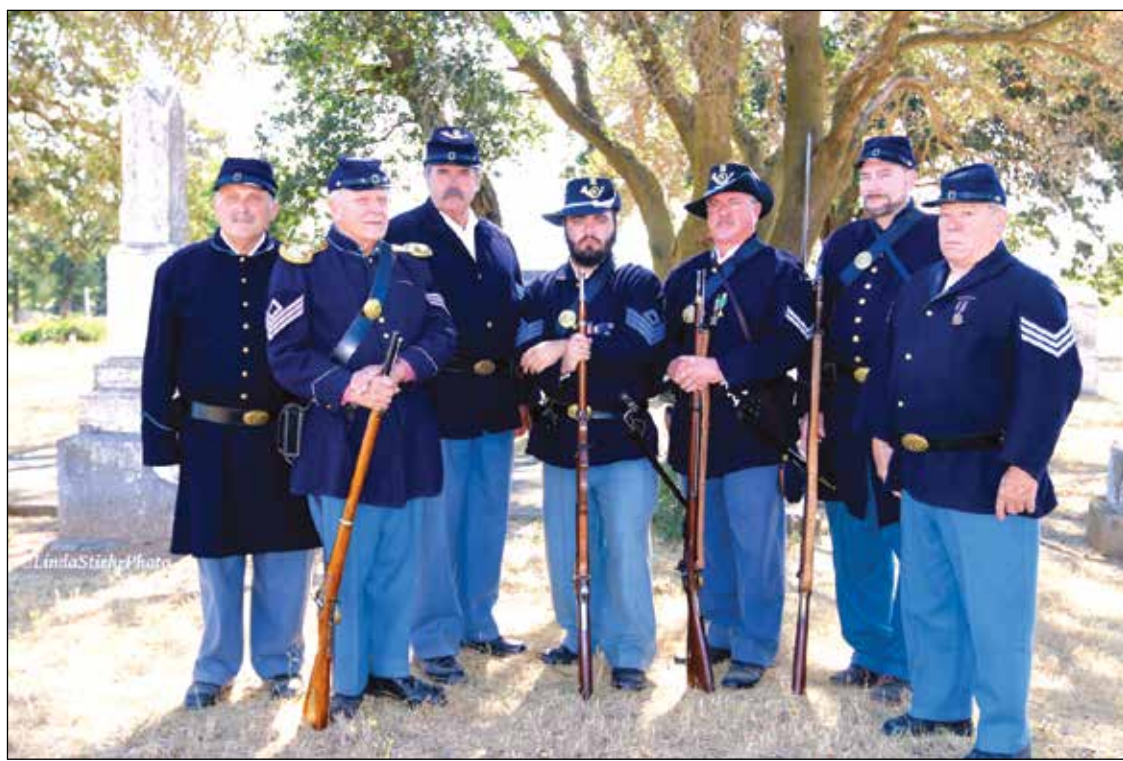
Members of Sacramento Camp 22 of the Sons of Union Veterans of the Civil War at Sylvan Cemetery in Citrus Heights who rendered annual military honors on Memorial Day.

"I'm proud of their individual military service during the