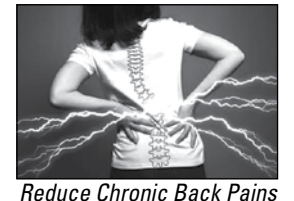
Reduce Chronic Back Pains