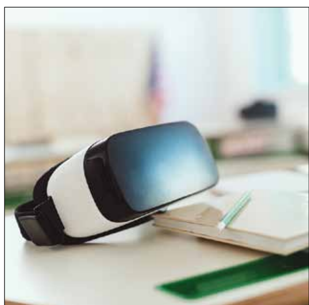
Firefighter training is unique and quite often comes with a calculated risk. VR technology can help reduce some of that risk during training by exposing the firefighter to the experience they will be dealing with firsthand in a completely virtual atmosphere, without the risk.