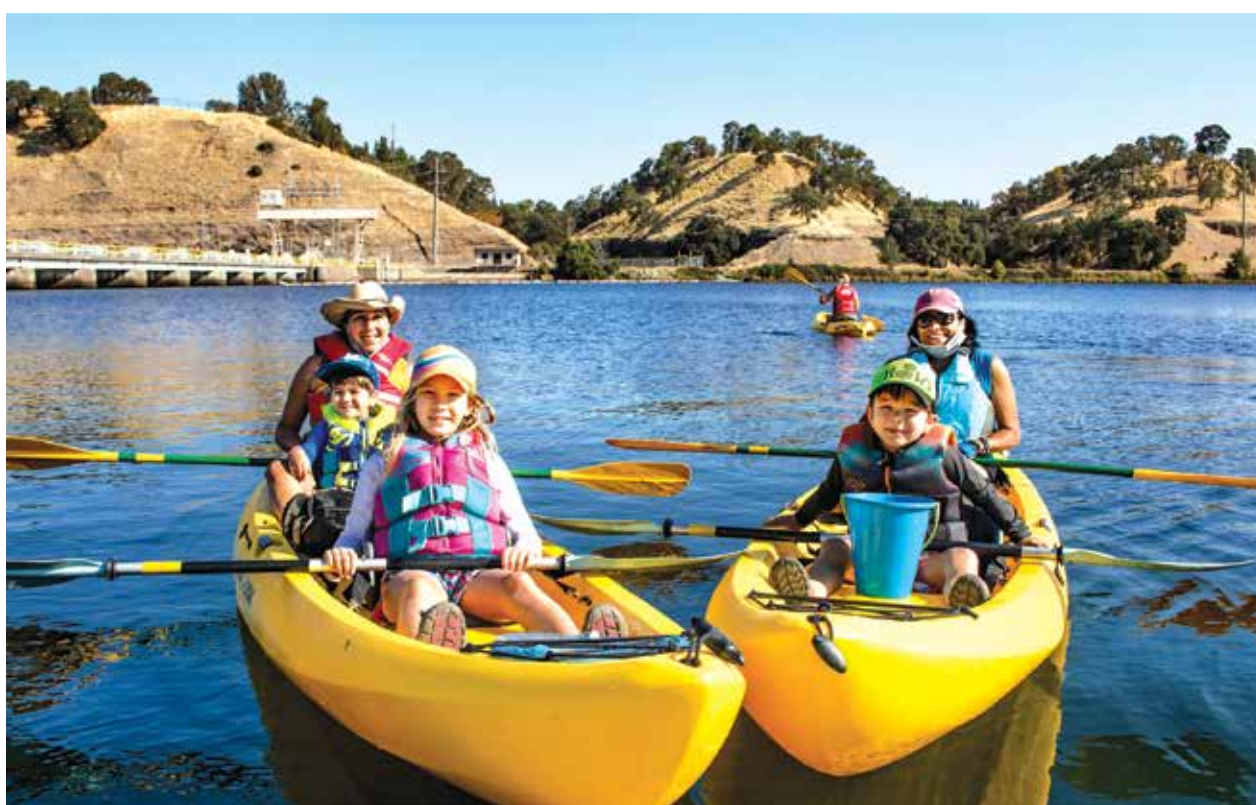
Water sport fans can now push off from the Aquatic Center on Lake Natoma.