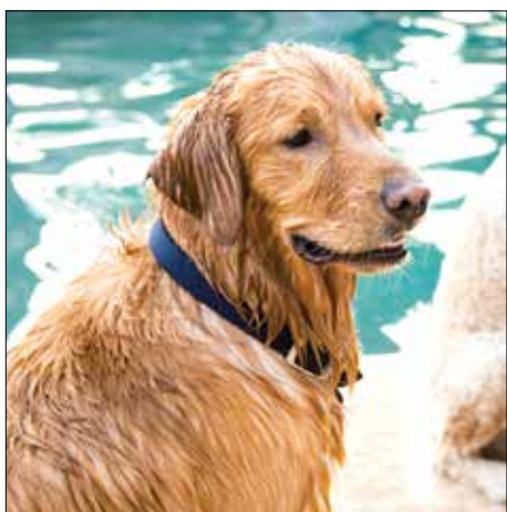
Always supervise pets when swimming either in a pool or in waterways.