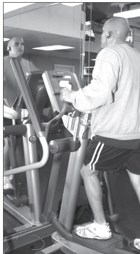
The California Fitness Alliance (CFA) announced that since reopening on June 12, its members have reported no cases of COVID-19 traced to California fitness centers.