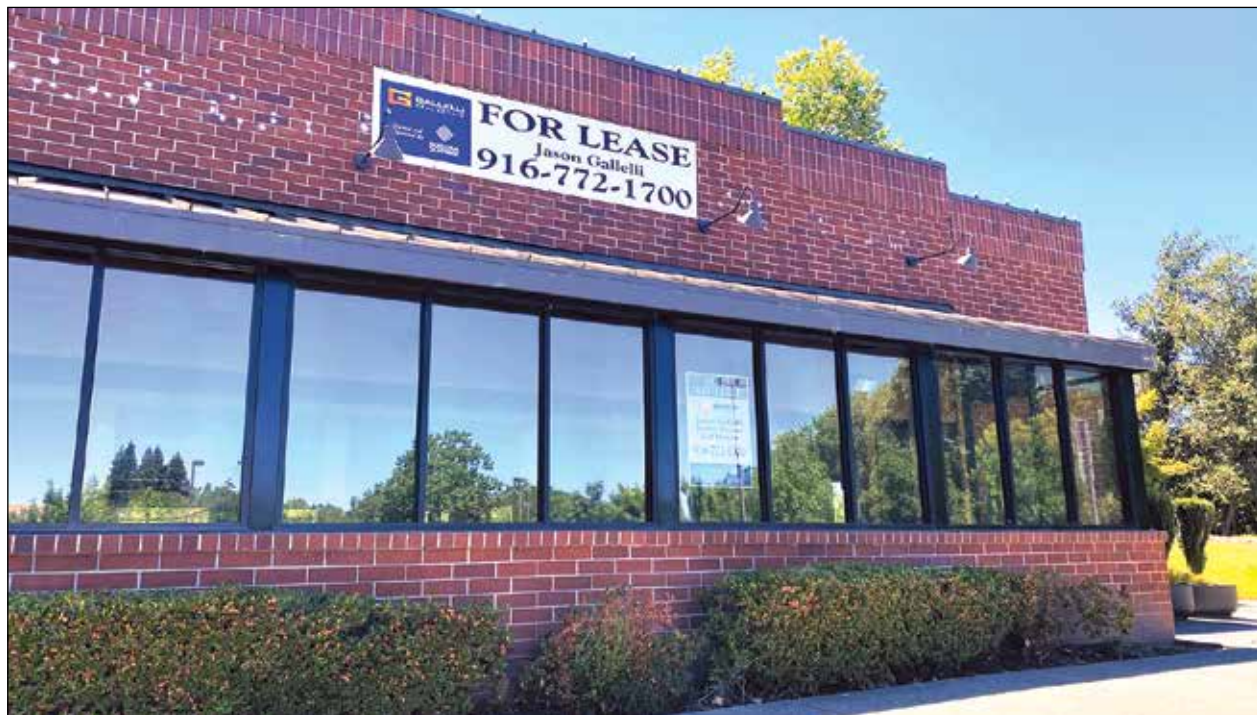
The site of the closed Applebee's would make a great place for an Aisle 1 gas station.

In the two decades living here, I have seen the good, bad and ugly of Gold River. For all but a few of those years, I've shared my thoughts and opinions with you through this monthly column. So, why stop now? Without further ado, here's