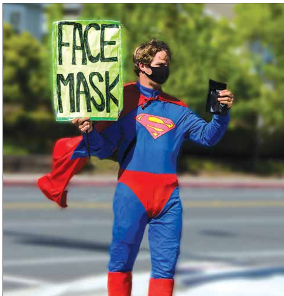
Lawbreakers shouldn't expect to be saved by a mask-peddling Superman.

Well, Mr. Freeze-meister and Mr. Standoffish are Mr. Friendly compared to another man who did the unthinkable early into the shelter-in-place order. Remember when several Gold River Discovery Center teachers caravanned from village to village to the delight of students and parents? It was a wonderful way for them to reconnect in the physical world after Zoom became the virtual classroom. Heartwarming were the reactions from all the townfolk except for the man who flipped off the teachers as they drove past in their festooned vehicles. It was shocking. Maybe his giving the bird was meant as a joke – killjoy-type humor that works for Janeane Garofalo and Larry David, but not by a neighbor in my village and not when it's directed to teachers. They