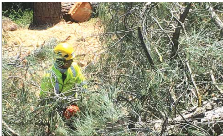
SMUD contract tree pruning workers clear high-fuel vegetation and brush under and near high-voltage transmission lines in Rescue, El Dorado County.

Though SMUD doesn't serve El Dorado County, the community-owned electric company works directly with property owners to plan the work, which in some cases crosses private property near homes and businesses including orchards and vineyards. In many cases, property owners request the removal of trees and brush on their properties as wildfire danger has become considerably more threatening in recent years.