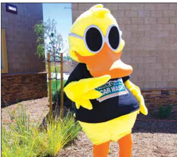
Quackals is your partner to support local businesses and supply Sacramento and Placer Food Banks stock up.

"We realize many businesses were affected by the shelter-in-place order due to the Coronavirus pandemic,"