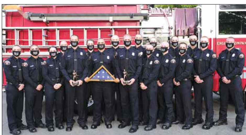
Firefighter Recruit Class 20-1 graduated from the Metro Fire Recruit Academy, receiving their badges and first station assignments.

Due to restrictions on large gatherings the event was celebrated without families of the graduates and only District staff essential to the graduation ceremony was in attendance. ★