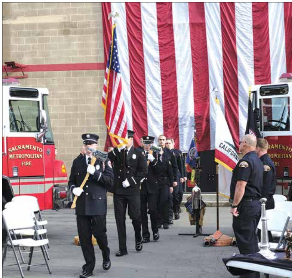
The Sacramento Area Fire Fighters Local 522 Honor Guard marked the opening of the ceremony with the presentation of the Colors.

New Firefighters Graduate to Join Metro Fire