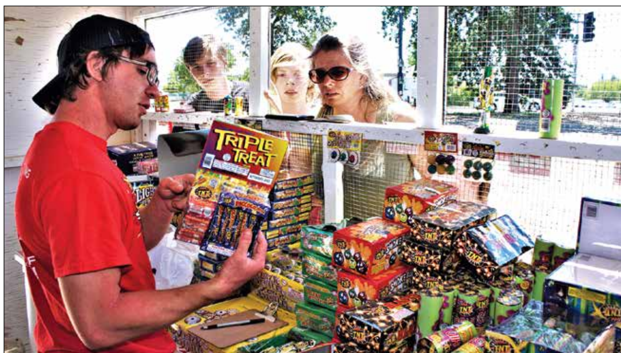
Cash-strapped non-profits are hoping for brisk business with so few professional displays being staged this season.