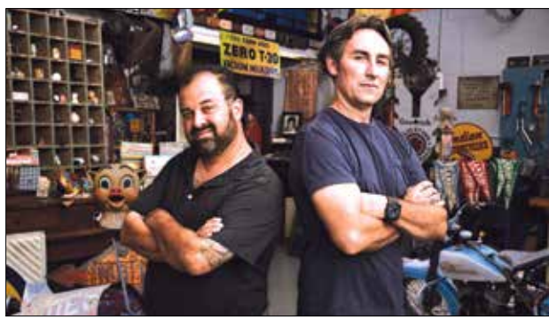
Mike Wolfe (right) and Frank Fritz will be returning to California to film AMERICAN PICKERS.

As they hit the back roads from coast to coast, Mike and Frank are on a mission to recycle and