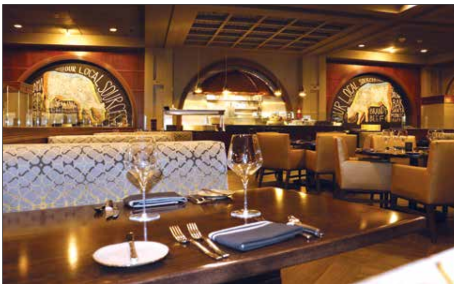
Graduation dinner at the LAX Marriott's JW's Steakhouse makes things easier on guests who need to fly in.

Stanford – The Graduate Palo Alto might not be open in time for Stanford commencement exercises, so for now, my pick is the Westin Palo Alto ( bit.ly/2QuYw2a ). Nothing special, kinda dated, doesn't live up to the 4-star Westin brand, but ... it's clean, friendly and an easy walk to Stanford Stadium, where the