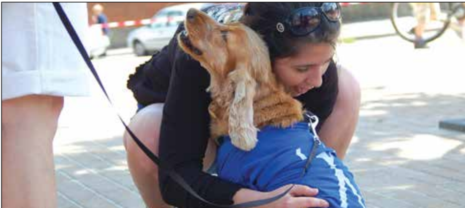
All BARC dogs wear blue vests that say "Pet Me," an open invitation for travelers to say hello.