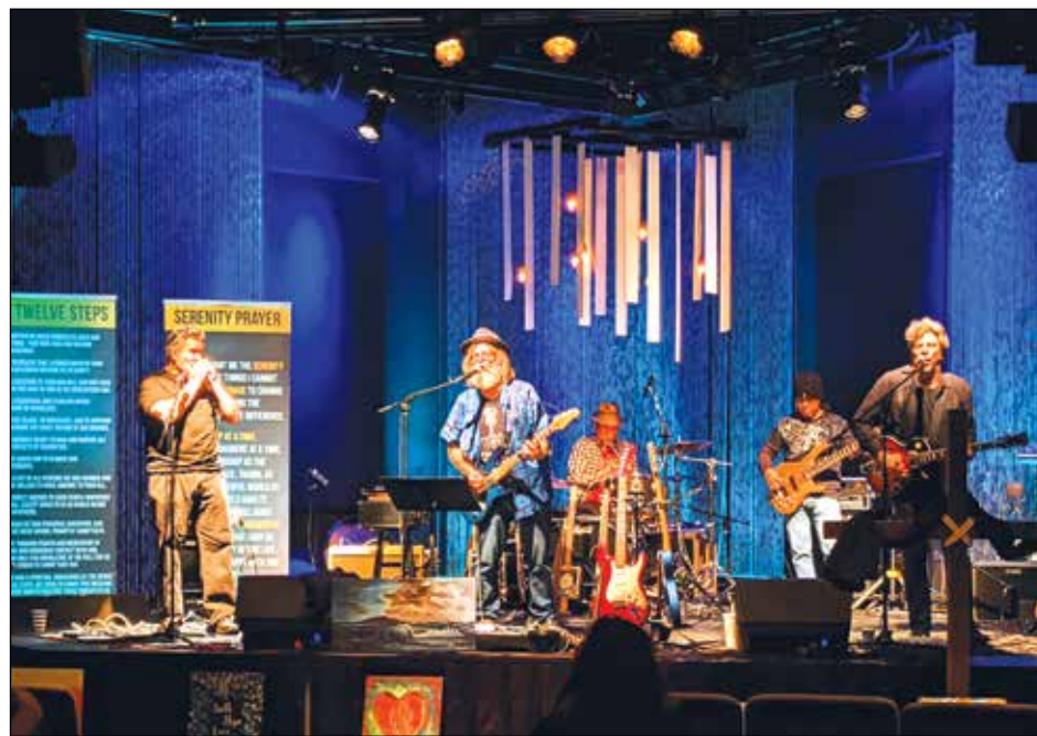
Christian rock band Crimson Blues performs at the Higher Power recovery celebration on January 17.