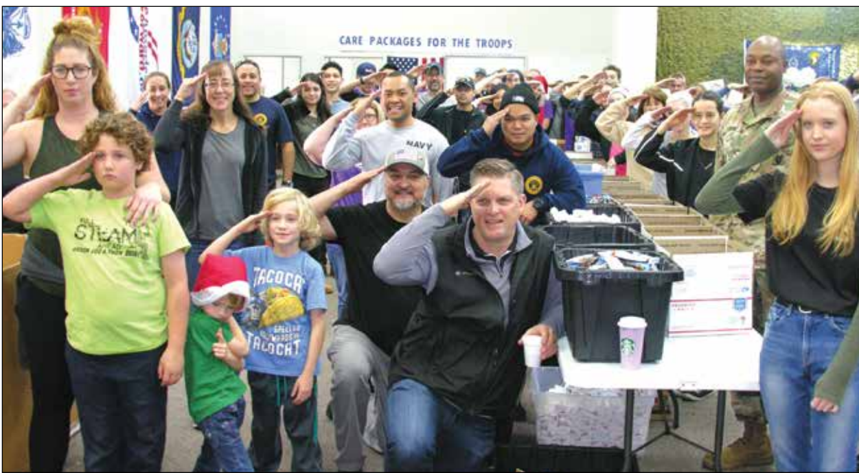
Move America Forward, members of the military community and volunteers stand by their stations, sending a salute to our service men and women.

Sending a Holiday Salute and Care Packages