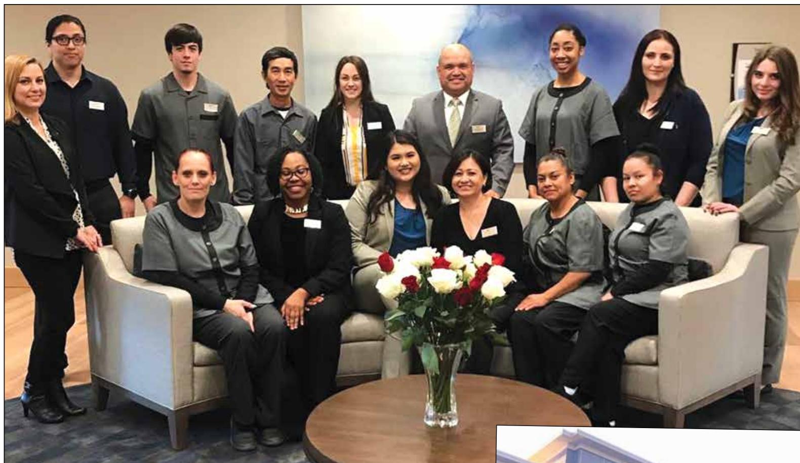
Above: The welcoming staff at the lobby of the newly established Homewood Suites by Hilton Rancho Cordova. Right: Front image of the new Homewood Suites by Hilton in Rancho Cordova.

Developed, owned, and managed by Tharaldson Hospitality, Homewood Suites by Hilton Rancho Cordova offers a combination of studio and one-bedroom accommodations featuring fully-equipped kitchens and separate living and sleeping areas. Guests are also provided all the essentials needed for a smart, reliable and convenient stay including complimentary daily full hot breakfast, evening social Monday-Thursday, Wi-Fi and a grocery shopping service.*