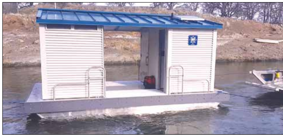
Floating restroom shown during December 2019 deployment at Lake Berryessa. Each ADA compliant unit holds about 500 gallons of sewage.

DBW's Floating Restroom Grant Program helps reduce pollution from recreational boater sewage by providing floating public restrooms in areas with limited landside access. Over the years, DBW floating restrooms have become known as S.S. Relief stations. California State Parks' engineering group re-designed the restrooms this year to achieve ADA compliance. The floating restrooms are solar-powered and the holding tanks