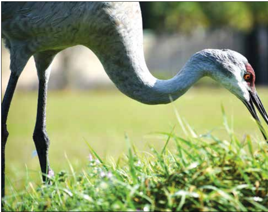
Of the six subspecies of Sandhill Crane found in North America, three can be found in California.