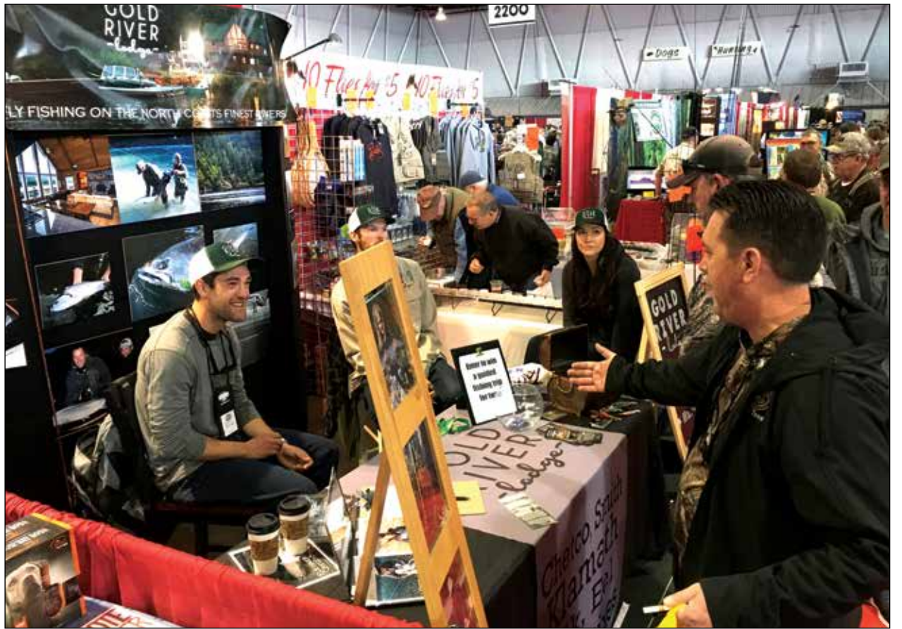
We've got salmon fishing in our backyard, but a different Gold River has so much more outdoors.

For fast food chicken, gotta go with the spicy option at Popeye's on Zinfandel