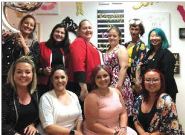
Ladies of the Shine Unit and Fire Unit gear up to bring Holiday cheer to our local "grandparents."

SACRAMENTO REGION, CA (MPG) - It's time for our annual "Adopt a Grandparent" Fundraiser. Local Mary Kay Sales Directors and Beauty Consultants use their businesses as a way to give back to seniors with a program we started calling "Adopt a Grandparent". It breaks my heart that each holiday season, many residents of long term care homes are "forgotten". Nearly 3 million go without visits or gifts. This is where we come in! We put together small gifts to deliver to the residents of care centers that we have chosen to sponsor. Last year our unit sponsored residents at Park Place, Mission Carmichael Health Care Center, and Almond Avenue Residence Club. Such a small gesture can