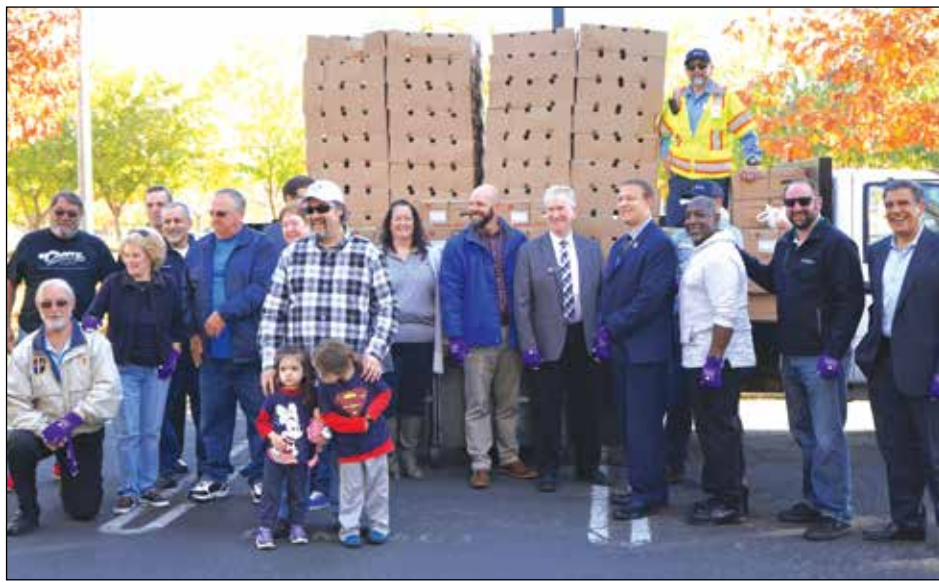
Rancho Cordova City Council, Rotary Club of Rancho Cordova, Grocery Outlet Rancho Cordova and Kiwanis Club of Rancho Cordova members are taking the turkeys to the streets.

By Rachael Serrao , Randle Communications