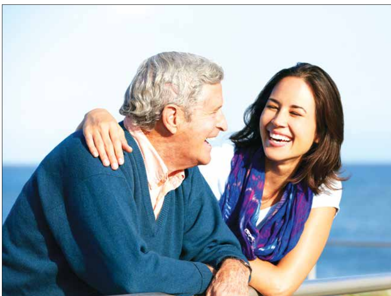
A family caregiver is anyone who helps take care of a family member or friend without any professional training. These caregivers want their loved ones to have the best care possible – at the doctor's office, hospital and home.