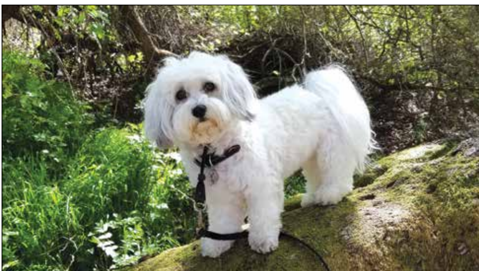
Molly is a natural performer.

Hypoallergenic: Yes Coat: Very soft double coat Life expectancy: 13 – 15 years Mass: 9.9 – 16 lbs (Large Adult) Temperament: Intelligent, Affectionate, Responsive, Companionable, Playful, Gentle Colors: Black, White, Havana Brown, Fawn, Tobacco, Mahogany