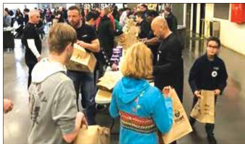
This is the 21st Thanksgiving SMUD employees and family members volunteered to prepare and deliver holiday dinners to the area's homebound seniors. About 150 SMUD Employees' Association volunteers spent Thanksgiving morning preparing, packing and delivering for Meals on Wheels.

For 21 years now, SEA volunteers have enthusiastically prepared and delivered hearty Meals on Wheels to Sacramento County seniors who