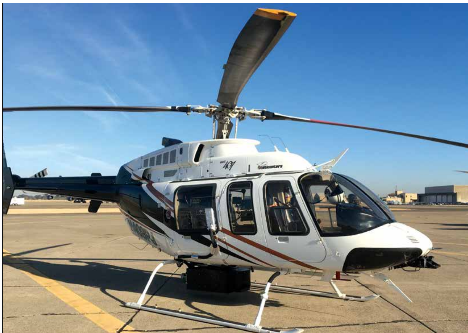
LiDAR technology and orthoimagery equipment mounted under the helicopter enables SMUD to identify potential fire threats and enhance its system reliability.

identifies vegetative growth and even dead and dying trees that pose a threat to public safety and power system reliability. The inspections are valuable not only from a preventive maintenance perspective, but also from the perspective of tree and brush management, ensuring vegetation isn't encroaching on SMUD's lines, which could cause electrical faults and outages.