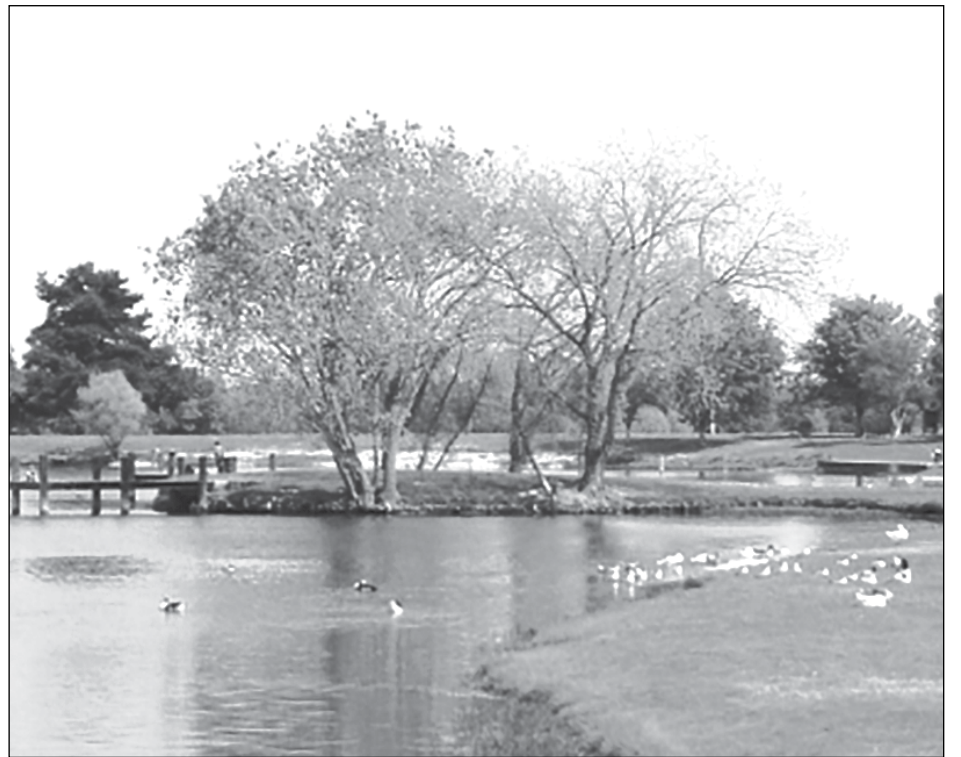
Image of Gibson Ranch Regional Park located at 8556 Gibson Ranch Park Rd, Elverta, CA.