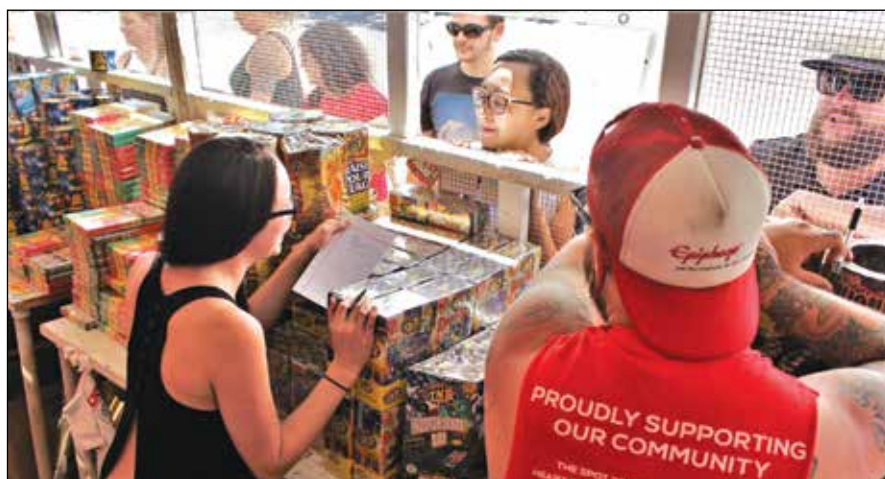
State-approved fireworks of all shapes, sizes and price points are a big fund-raiser for area non-profits from June 28 through the Fourth of July.

Phantom Fireworks is coming out with three new fountains this season. Sold as a