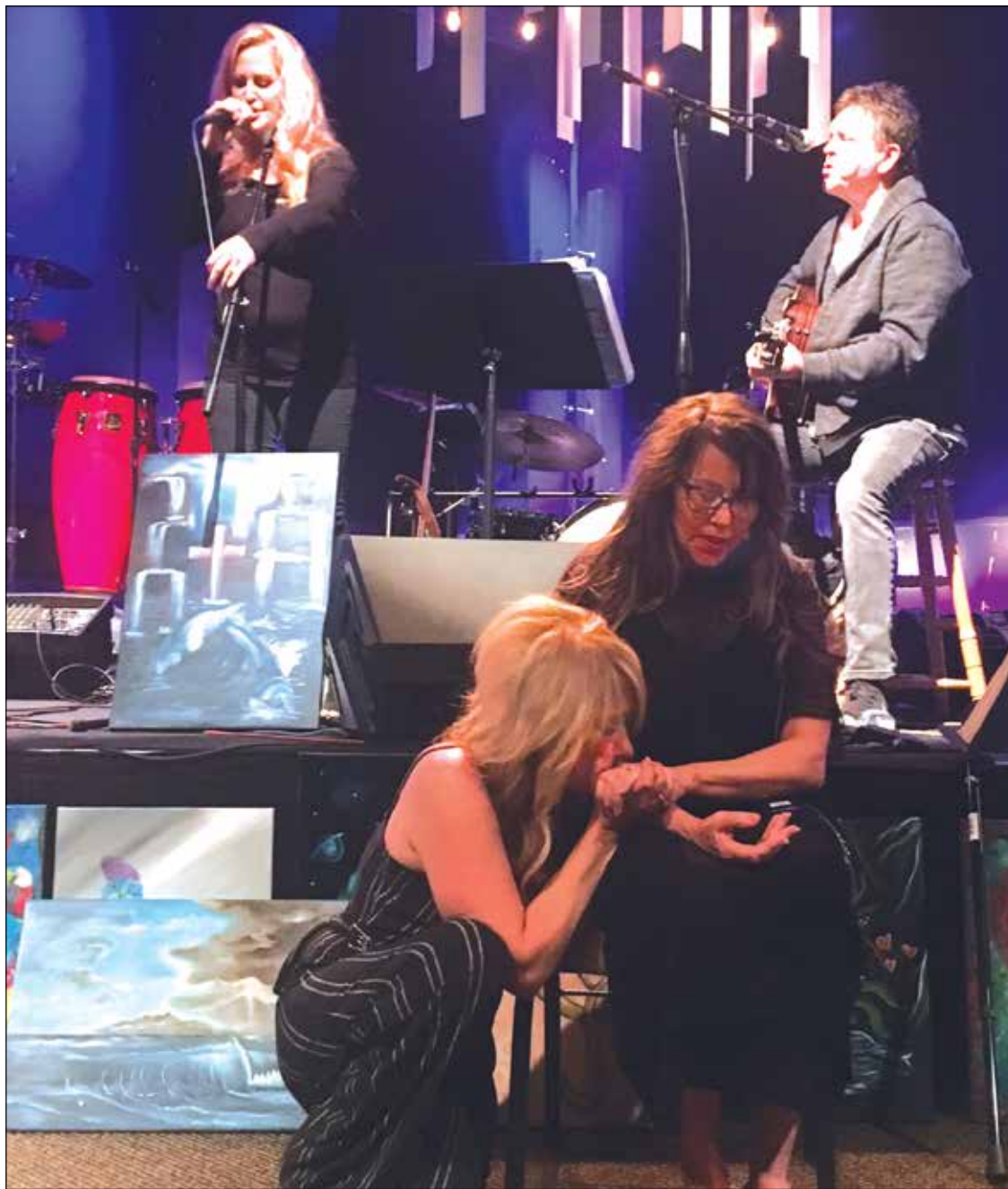
Women pray together at a Higher Power recovery celebration.