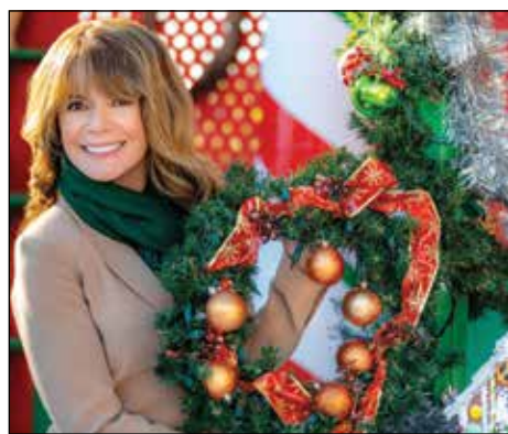
It's not that we don't love the sleigh full of seasonal flicks from the Hallmark Channel, Lifetime, Freeform and Netflix. It's just that there are so many now.

Cheers to Tell Me a Story for booking such a primo cast. From affable James Wolk finally playing dark opposite a refreshingly un-glam (and so good!) Paul Wesley to Kim Cattrall flipping the script on her sassy Sex and the City persona as a compassionate grandmother, CBS All Access's grim twist on classic fairy tales is a treat you should already be addicted to. End of story.