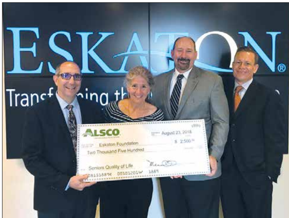
Eskaton management receives the donation from AlSCO executives.