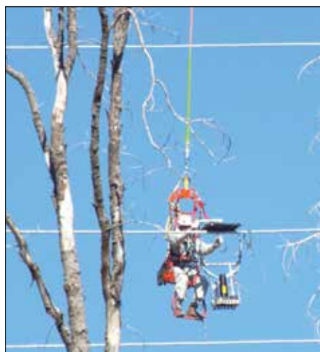
Suspended from a helicopter, a lineworker conducts X-ray photography on a SMUD transmission line in the Sierra. The work helps SMUD identify potential issues in advance so they can be repaired and help avoid power outages that could affect thousands of customers.

Barehanding is a technique that safely allows transmission lineworkers to "bond on" and have direct contact with energized, high-voltage lines to perform work. Special protective clothing, including gloves, socks and boots, place the