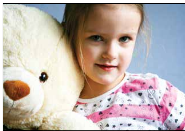
Hundreds of new resource families are needed so that children and youth can live with a caring family in a home-based setting rather than in a group home.

Sacramento County supports, trains and offers guidance, support and