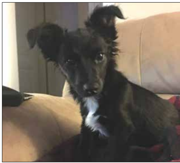
I love playing catch with my ball, wrestling with my cat friends and destroying chew toys.

I scratch the door every morning and bark to wake everyone up and to use the bathroom right away. I Love doing tricks like