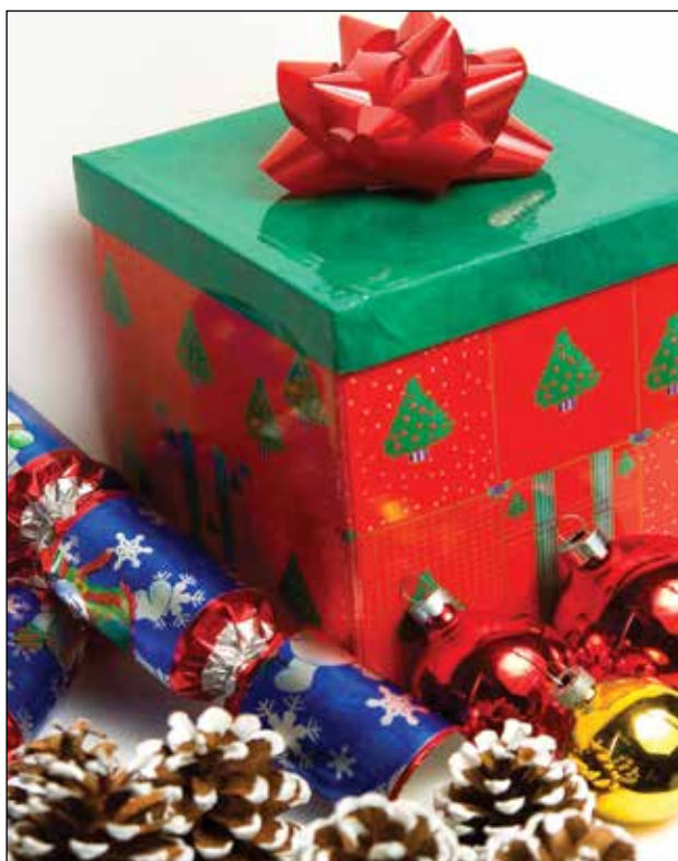
Local community partners and individuals from local businesses, County staff, government agencies, religious organizations, service groups, professional groups and families participate in this annual holiday gift-giving drive.

Consider participating in the Gifts From the Heart