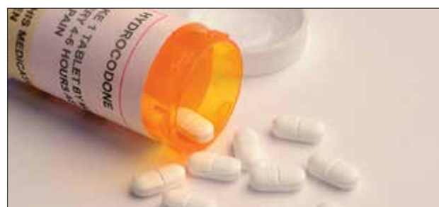
The Sacramento County Opioid Coalition website provides additional information including a list of current stakeholders, upcoming events and a calendar of the group's progress.

The Sacramento County Opioid Coalition goal is to work collaboratively on a comprehensive plan to address the opioid epidemic effectively with the following strategies: promoting safe prescribing; expanding treatment access; promoting safe medication disposal; encouraging early intervention treatment and recovery, overdose prevention; expanding public education and media