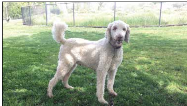
Charlie, is excited to play at the local dog park.