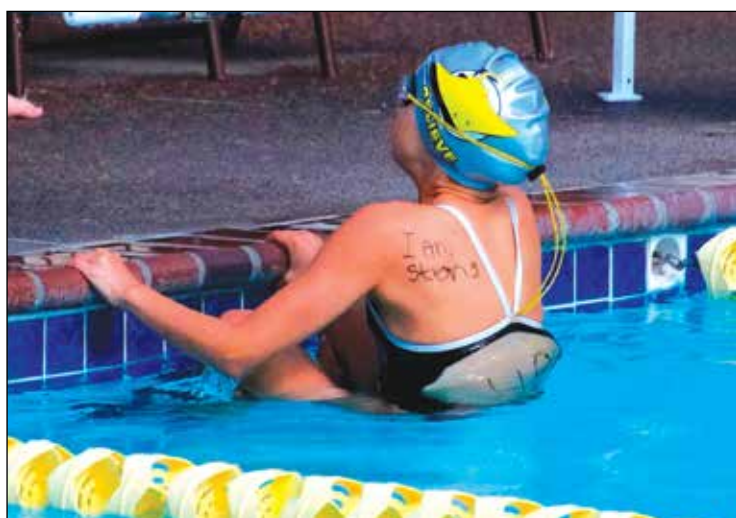
Rounding out May Days, on the 4th and 11th at 5:45, Gold River's Mini-Rays are participating in their first two meets of the season.