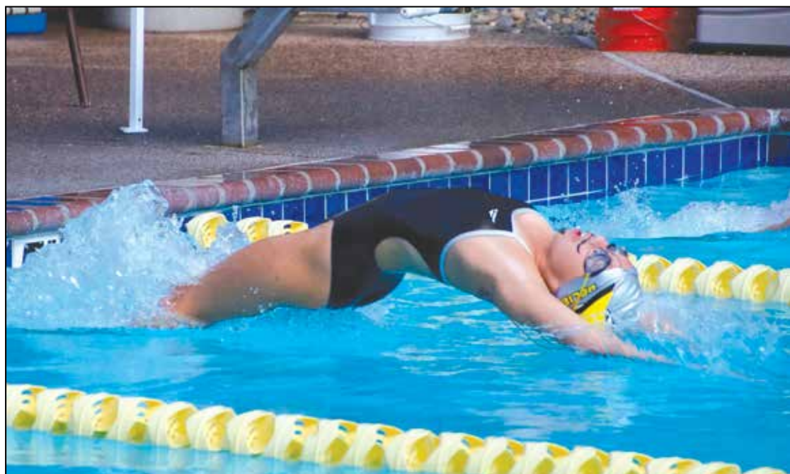
May 5 is Time Trials, when all swimmers establish seed times for their first home meet against Arden Hills on May 12.