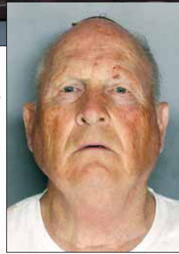
Booking photo: Joseph James DeAngelo Cordova and Citrus Heights, four in Carmichael and two in Orangevale.

The East Area Rapist is believed to be responsible for at least nine sexual assaults in Sacramento, six more in Rancho