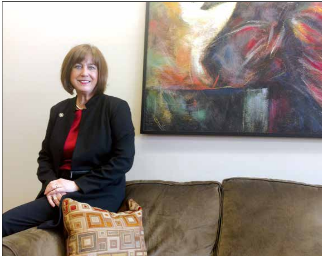
We have sanctuary state laws that I do not support. We get paid about $5 million annually by the federal government to provide prison beds if we cooperate and start processing criminals who are here illegally.

A: A big part of my first year was about getting to know the county and my district, establishing communications with my constituents and raising the bar on how we respond to their concerns. In addition to our initiatives on homelessness, we brought in an economic development consultant to help identify some exciting ideas on how to revitalize the business economy for Orangevale. We have approved a county-wide Veterans' Commission to focus specifically on our veterans' needs. We also are working on a PBID for Antelope; identified funding for arts programs in Folsom, as well as a road safety program in Rancho Murieta, and launched the new, Smart Bus system in Citrus Heights.