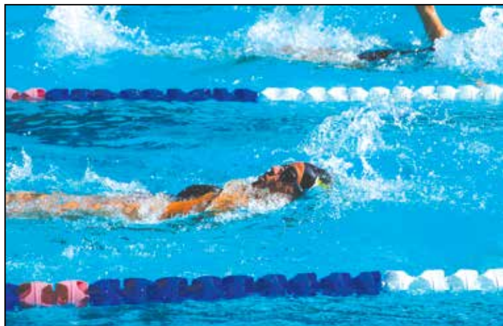
Swimmers, as individuals and a team, challenge themselves and shatter the clock.

All dolphin-kick starts, turns, and finishes are critical