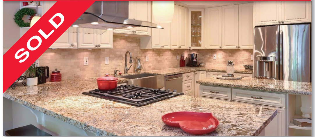
Exquisite remodel to perfection. Chef's dream kitchen, gas cooktop.

2170 Promontory Point Lane Promontory Point Village