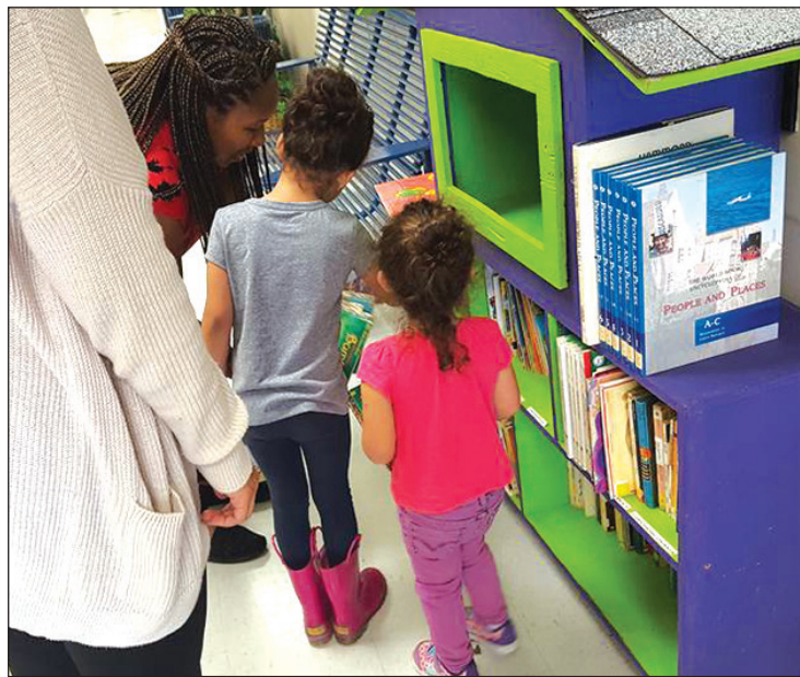
FCCP strives to keep the library filled with books for children that are visiting the Family Resource Center with their parents to encourage early literacy activities.

FCCP strives to keep the library filled with books for children that are visiting the Family Resource Center with their parents to encourage early literacy activities. Studies show children born into poverty will experience 30 million fewer words within the first three years of life than their peers of higher income households. This word gap continues to grow as the year's progress, causing slower development and growth for children who are economically disadvantaged. FCCP's "Little Free Library"