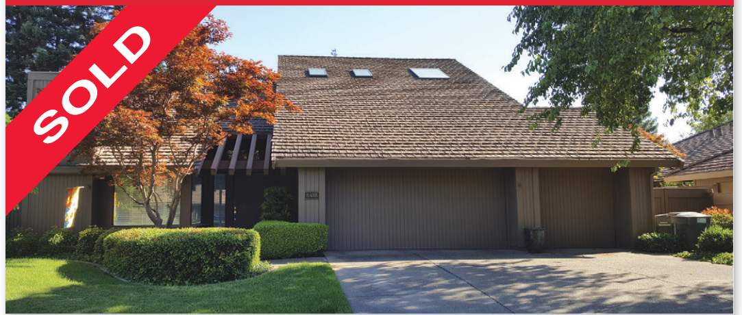
Spacious kitchen with beautiful granite countertops, can lighting.

11488 Forty Niner Circle Argonaut Village