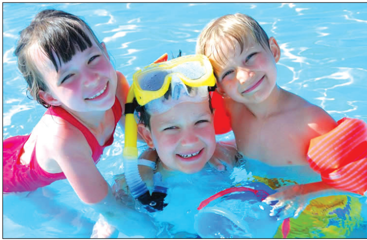
Swimming is fun and has great healthful benefits from the physical activity, but that's why it's also important to keep it clean. The water we swim in is rarely germ free.

warning signs and postings. Do not access a water body if posted warnings indicate it is not safe to do so.