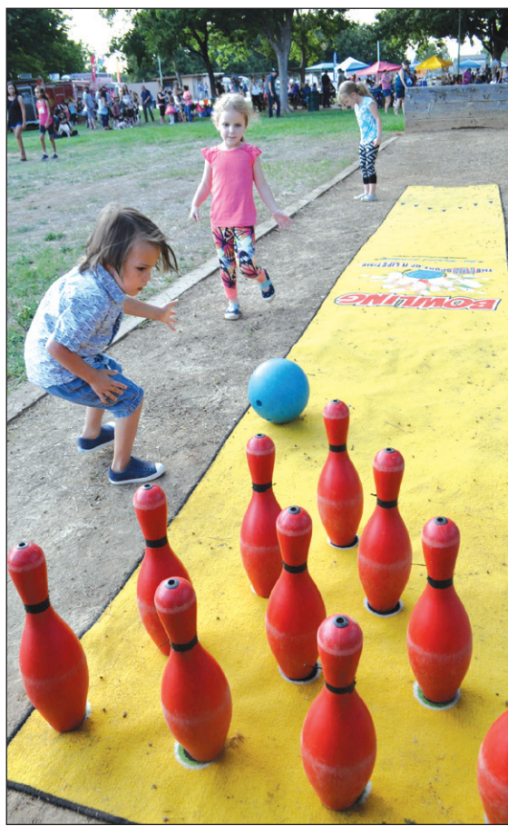
Cordova Recreation and Park District residents of all ages celebrated the District's 60th Anniversary.

Please join the Cordova Recreation and Park District at their next event, visit www.crpdc.com to see the calendar. ★