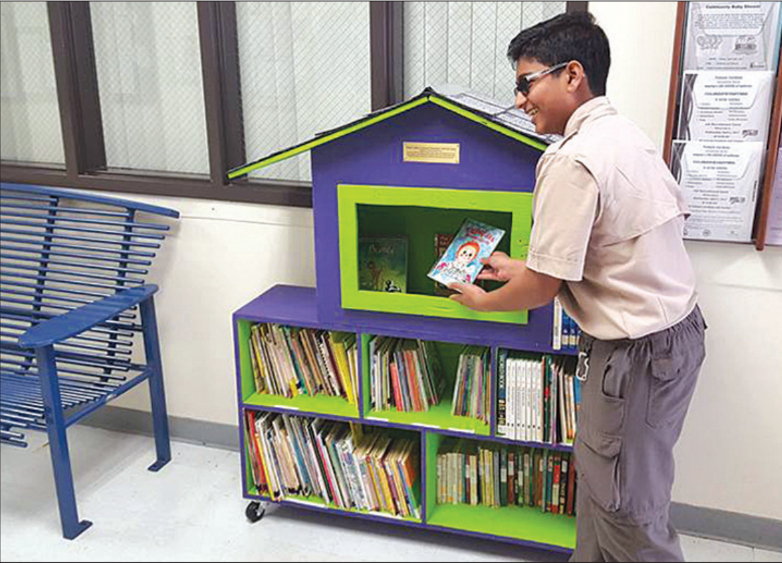
Donations of children's books can be dropped off at the main office or at FCCP's Job Center location at 10826 Gadsten Way in Rancho Cordova.