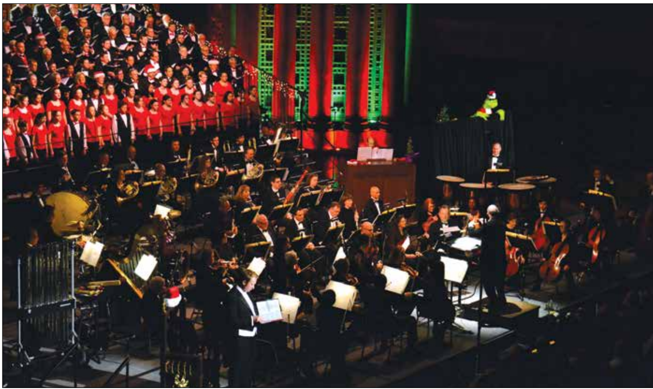
The SCSO is enjoying a strong collaboration with KVIE for their December 9th performances and their PBS documentary is gaining lots of airtime leading up to the concerts.