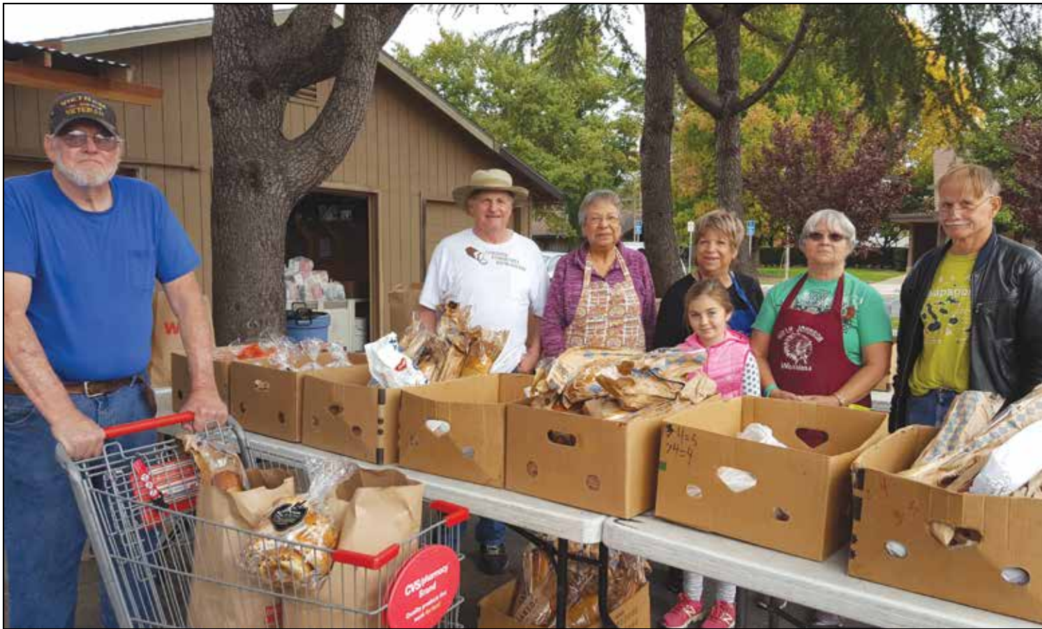
The Cordova Community Food Locker is staffed by volunteers and is open 9:30 a.m. – 1:30 p.m., Mondays, Wednesdays, and Fridays.