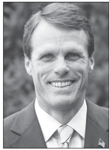
Senator Ted Gaines (R-El Dorado) Commentary by Senator Ted Gaines

The California legislature has descended into policy madhouse where decisions defy every bit of fiscal and economic common sense and serve to put working class people in the poorhouse.