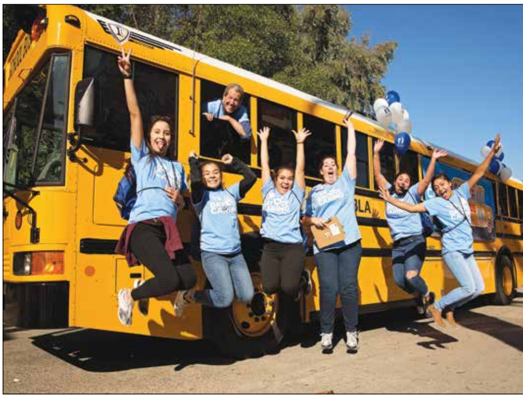
Volunteers celebrate as United Way collects school supplies for its Stuff the Bus campaign, one of dozens of projects that took place during United Way's 2017 Day of Caring in September.