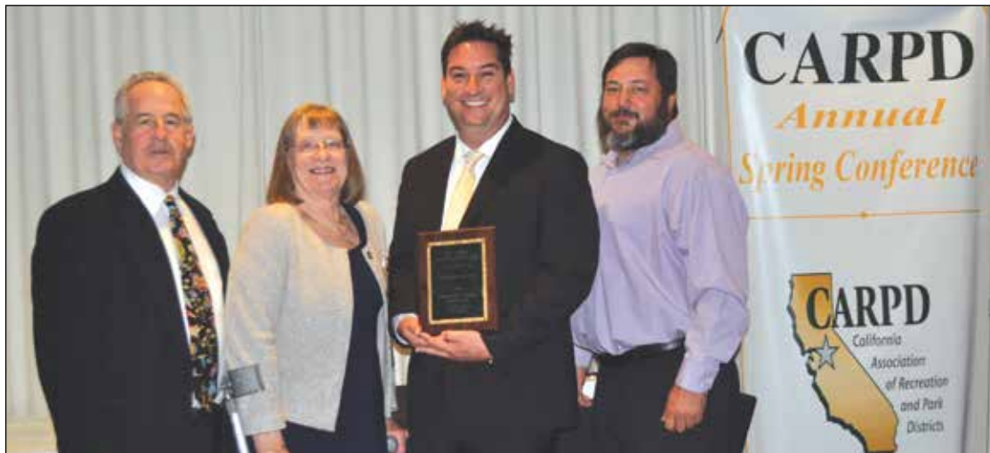
Hillside is the 36th park in the District and opened in June 2016. The park previously was honored by the Sierra Chapter of the American Society for Landscape Architects in November 2016.

SACRAMENTO, CA (MPG) - Hillside Park was awarded as the 2017 Outstanding New Facility by the California Association of Recreation and Park Districts. The distinguished award was presented to the Cordova Recreation and Park District at the 2017 Spring Conference in May.