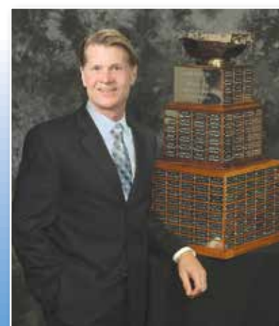
CalBRE Lic. #01110953