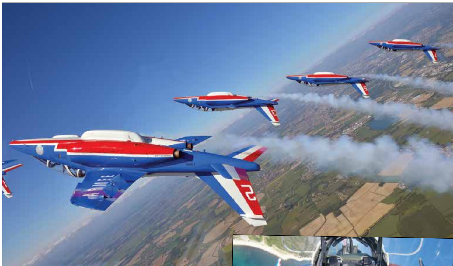
The French Air Force's Elite "Patrouille de France" is set to Perform at Mather Airport on April 15th. This event honors the 100th Anniversary of the U.S. Entering World War I. The event is a tribute from our French allies to the American heroes of World War I and a rare opportunity to experience this world class air force up close and personal. The California Capital Airshow is sponsoring this event, see story for additional information.