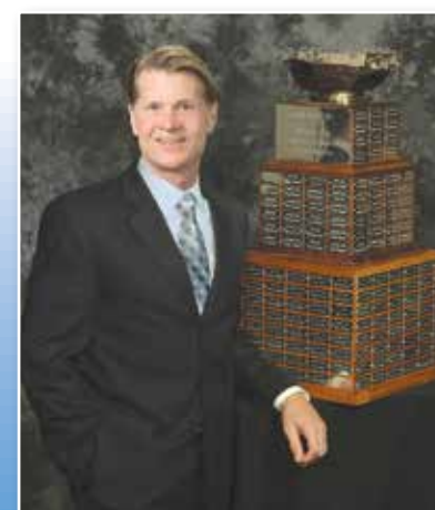
CalBRE Lic. #01110953