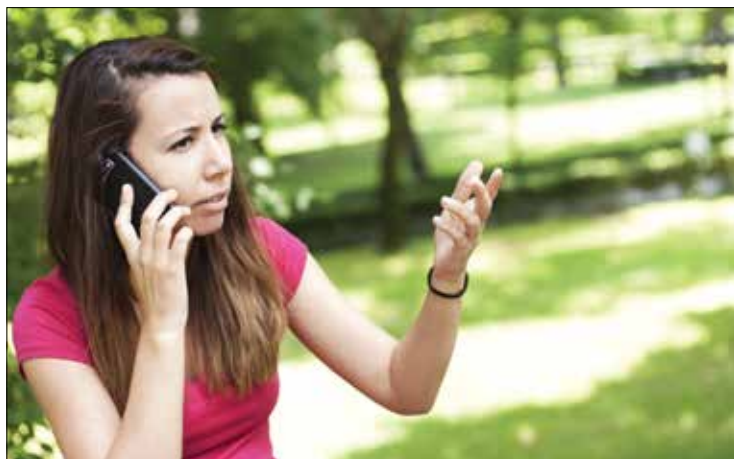
Use Caller ID to screen calls, and consider not even answering unfamiliar numbers. If it's important, they will leave a message and you can call back.

• Use Caller ID to screen calls, and consider not even answering unfamiliar numbers. If it's important, they will leave a message and you can call back.