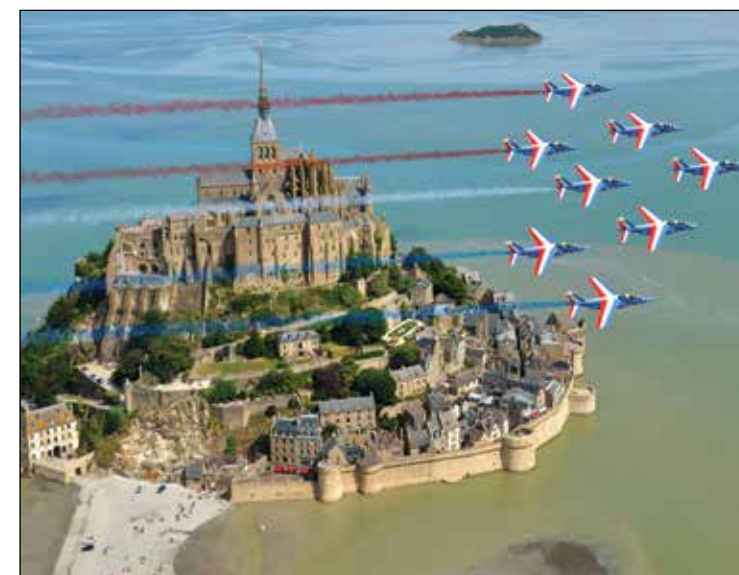
The Patrouille de France flight team will perform at Mather Air Field in Rancho Cordova on Saturday April 15. Gates open at 10am, the show will begin at noon. The California Capital Airshow will be sponsoring the event. The CCA gives back to the community through scholarships, charitable group donations and exciting educational youth programming throughout the year.

PRSR STD ECRWSS U.S. POSTAGE PAID EDDM RETAIL