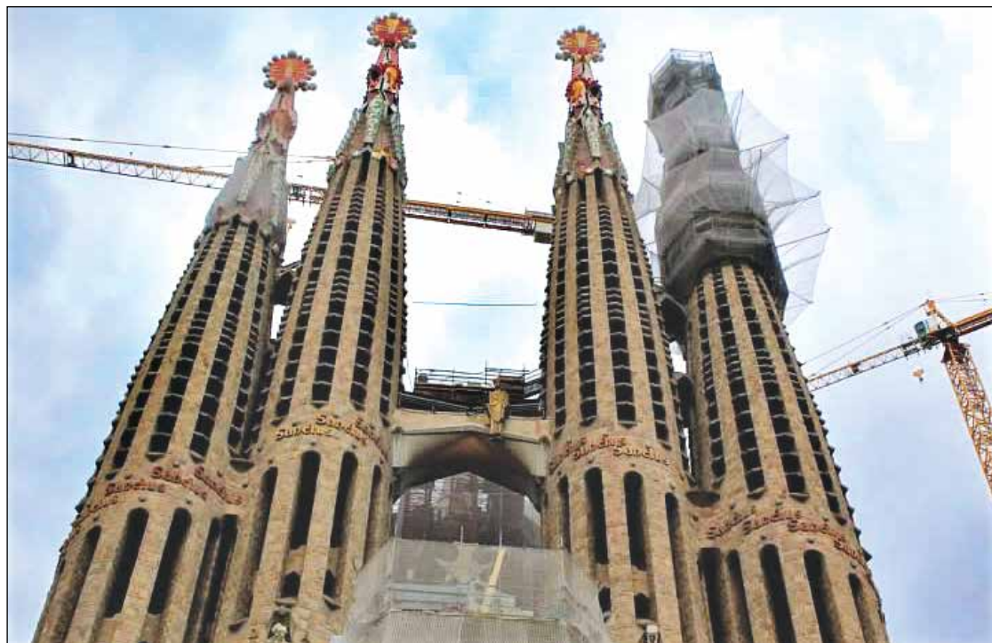
Antoni Gaudi's magnum opus, the Sagrada Familia, is Barcelona's most iconic landmark.

Visit Santorini, www.visitgreece.gr/en/greek_islands/cyclades/santorini ★