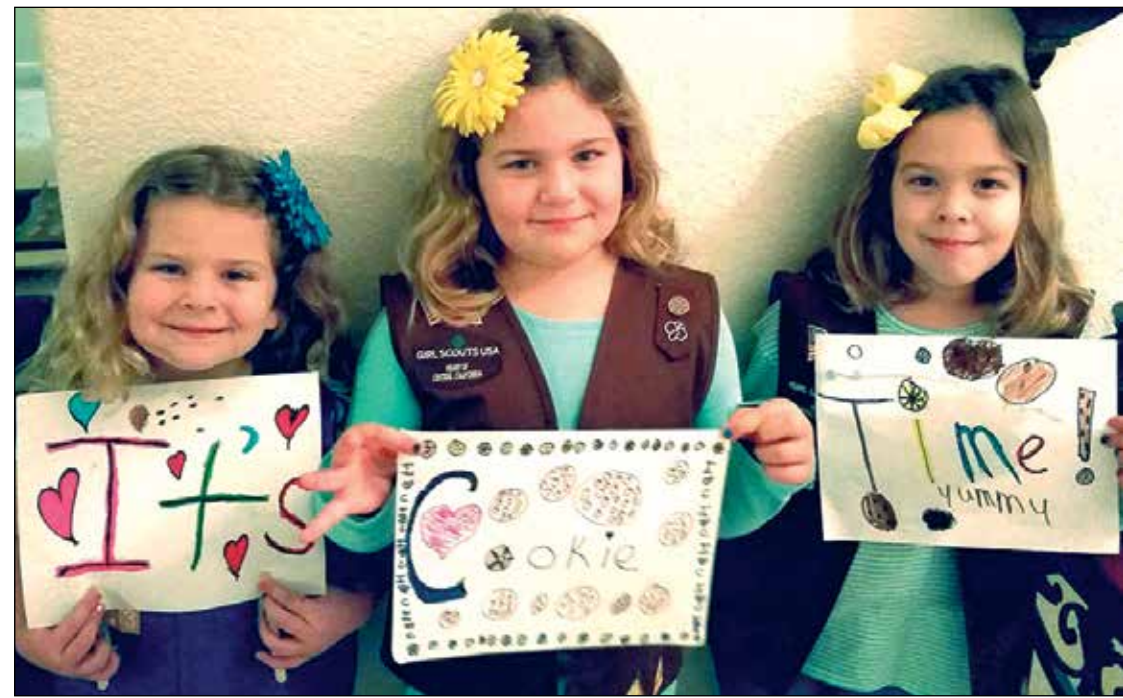
The five skills that participating in Girl Scouts build in future Girl Leaders are: goal setting, decision making, money management, people skills and business ethics.

Building Girl Leaders One Package At A Time