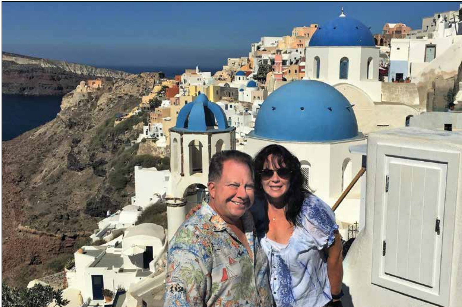
The "money shot" of any visit Santorini has Oia's noted white and blue domed houses in the background.

Spain's second-largest metropolis is the whole package, offering everything you want from a cruise port without need of a shore excursion or private guide. The city of Gaudi, Picasso and Miro doesn't take an expert to find spectacular sights, superb shopping, a breathtaking beach and fabulous food and drink. People watching also is bar none; Barcelona is blessed with model citizens – meaning so many of its people look like models!