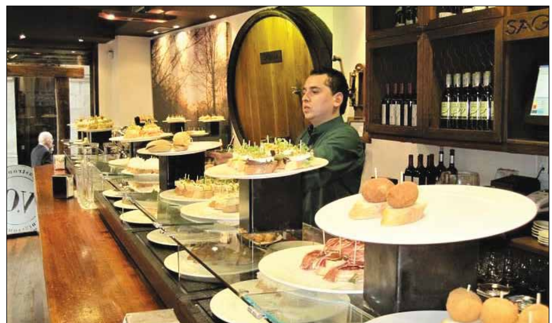
Tapas are a quick, easy and usually economical way to get your fill in Barcelona.