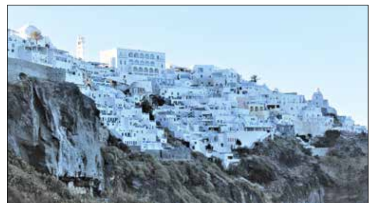
The climb up to Fira can be arduous for one's patience, legs and nose, but a worthy must when visiting Santorini.

Whoever said "getting there is half the fun" never went to the Taj Mahal or Greece's most picturesque, dramatic and tourism-dependent island. India isn't on the Mediterranean, so we'll leave the ghastly drive from New Delhi to Agra for another story. As for Santorini, there's no getting around a tender ride and a 400-meter climb up the cliffs of a caldera to reach Fira, a pretty town in itself, but not as picturesque as Oia a half-hour cab or bus ride northwest. Almost every shore excursion begins in Fira. Your