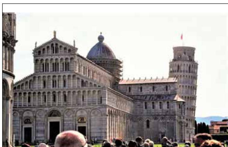
The Leaning Tower of Pisa is the main attraction in the city's architecturally rich Piazza del Duomo.