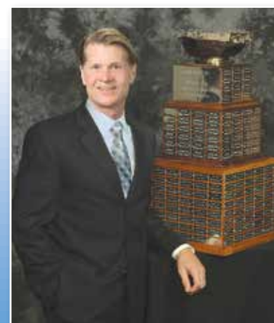
CalBRE Lic. #01110953