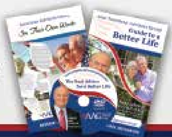
Former Senator Fred Thompson AAG Paid Spokesperson

Call now for your FREE DVD and Info Pack 1-888-928-0984