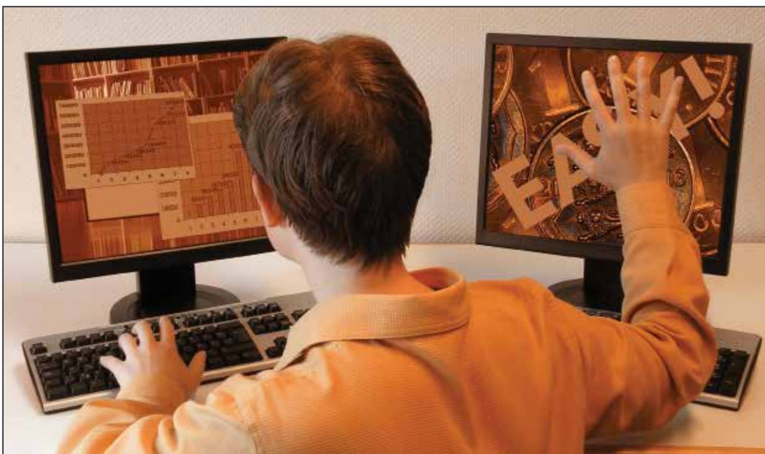
Better Business Bureau serving northeast California gathered information from consumers, federal agencies and internally to cultivate a list of the top scams of 2012.

SACRAMENTO REGION, CA – (MPG) Better Business Bureau serving northeast California gathered information from consumers, federal agencies and internally to cultivate a list of the top scams of 2012.