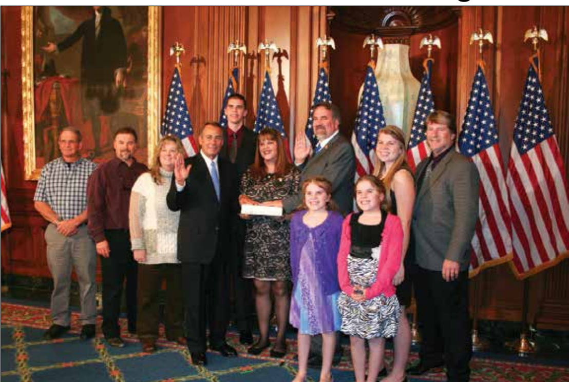
Representative LaMalfa is joined by his family as Speaker John Boehner administers the oath of office.

WASHINGTON, DC – Rep. Doug LaMalfa (R-CA) took the oath of office in the Chambers of the United States House of Representatives on January 3rd and joined the 113th Congress of the United States. The 84 freshman members, when joined with the freshman members from 2011, mean that a large portion of the House has spent two or fewer years in the Capitol.