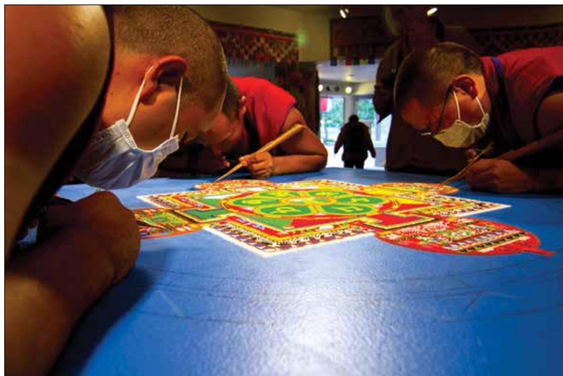
Monks will construct a sand mandala.