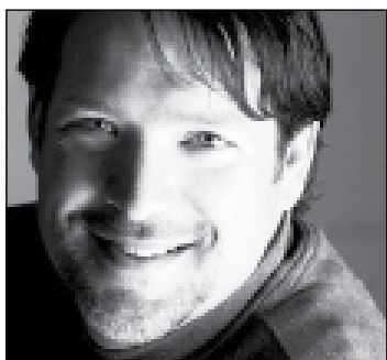
By Ronnie McBrayer

Imagine that tomorrow morning I deposit into your bank account $86,400. This money is all yours to do with as you please, no strings attached. Now, not only am I going to deposit this amount into your account tomorrow, I'm going to do the same thing every day next week. That is a combined $604,800 that will be waiting for you. But I'm not finished. I'm going to make this daily deposit into your account every day for the next year (you are really using your imagination now). At the conclusion of twelve months you will have received more than $31.5 million. What if I told you that you have in your possession, today, something even more valuable than $31 million. I wonder if you would believe me. You see, every day that you awake to draw air into your lungs, you receive that deposit of sorts, though it's not measured in dollars. It's measured in seconds. Every day contains 86,400 seconds; every week more than 600,000; and every year more than 31 million. They are yours to spend as you please. The only catch is this: When each day is