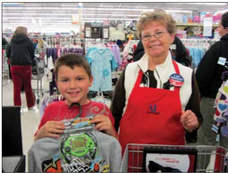
Student shopping with help of Assistance League member.

Funding for all Assistance League of Greater Placer programs is generated from sales in the all-volunteer Thrift Shop, fundraisers, donations, and grants. The Thrift Shop is located in the Fiddler Green Shopping Center, 1263 Grass Valley Hi-way in Auburn.