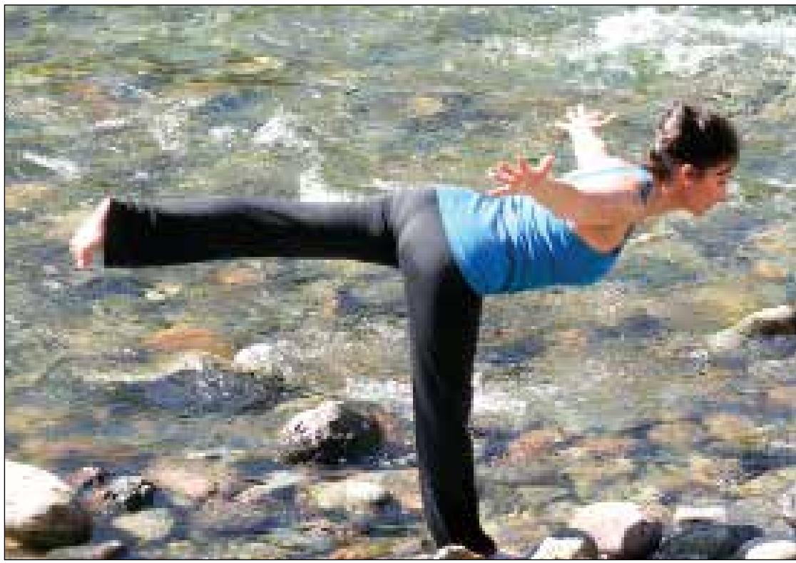
The feeling after yoga is a huge but gentle “ahhh”.