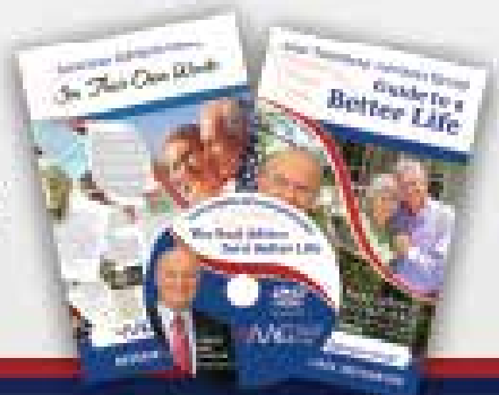
Former Senator Fred Thompson AAG Paid Spokesperson

Call now for your FREE DVD and Info Pack 1-888-928-0984