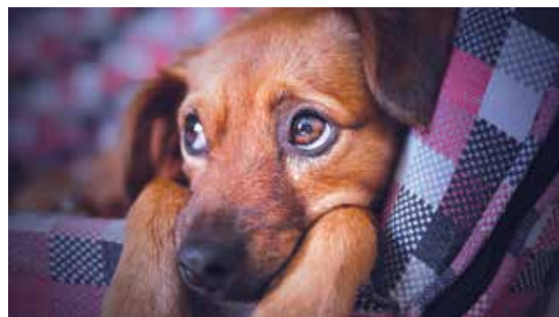
Adopting a pet during this event includes their spay/neuter surgery, microchipping, up-to-date vaccinations and microchipping, and a 1-year pet license for Sacramento County residents.

The Empty the Shelters program, which has successfully placed thousands of pets into loving homes, aims to make pet adoption