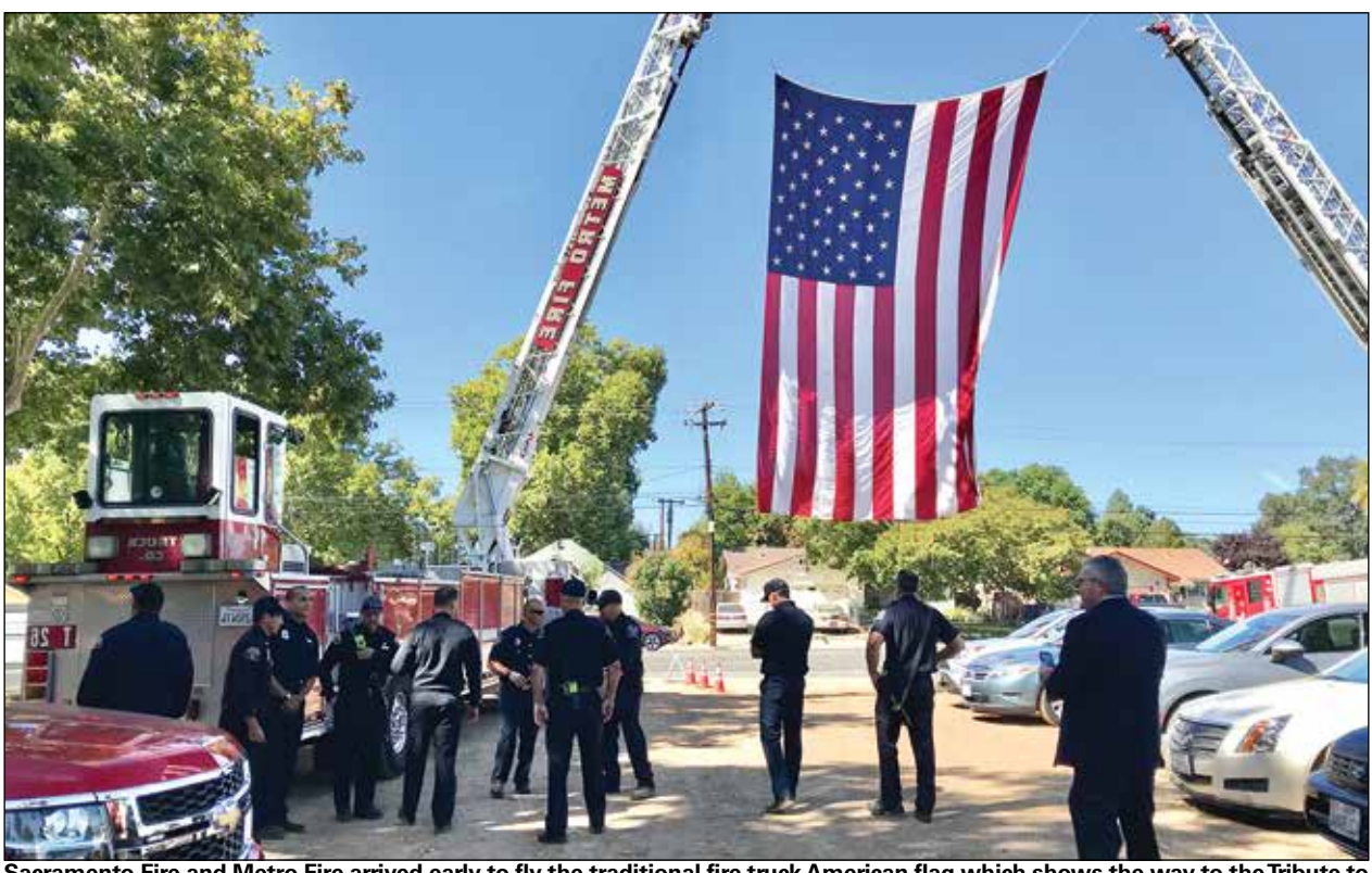
Sacramento Fire and Metro Fire arrived early to fly the traditional fire truck American flag which shows the way to the Tribute to Fallen Soldiers in Citrus Heights on Wednesday, September 27th.