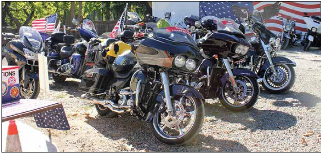
Veteran Riders are a close family. Dozens of riders journey every year with Tribute to Fallen Soldiers to stop at states throughout the country and honor their fellow soldiers who have fallen fighting for their country and our freedom.

It continues, "In remembrance of his everlasting call to bravery, honor and sacrifice in the name of country and duty. We as everyday Americans will always be grateful for your fallen hero's dedication to country and family. With this plaque