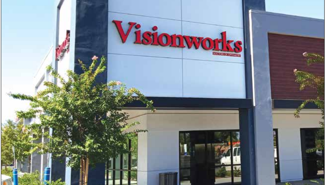
Visionworks – Doctors of Optometry celebrates its grand opening this week in the Sunrise Village Shopping Center at 7845 Madison Avenue in Citrus Heights.