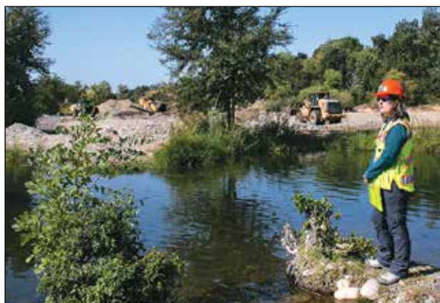
A $3.6 million project continues restoration of salmon spawning beds on the American River. Water Forum Habitat manager Erica Bishop watches excavation progress near Ancil Hoffman Park.

and steelhead return to home waters and can't find a place to spawn. Fish can't build nests without the right physical conditions.