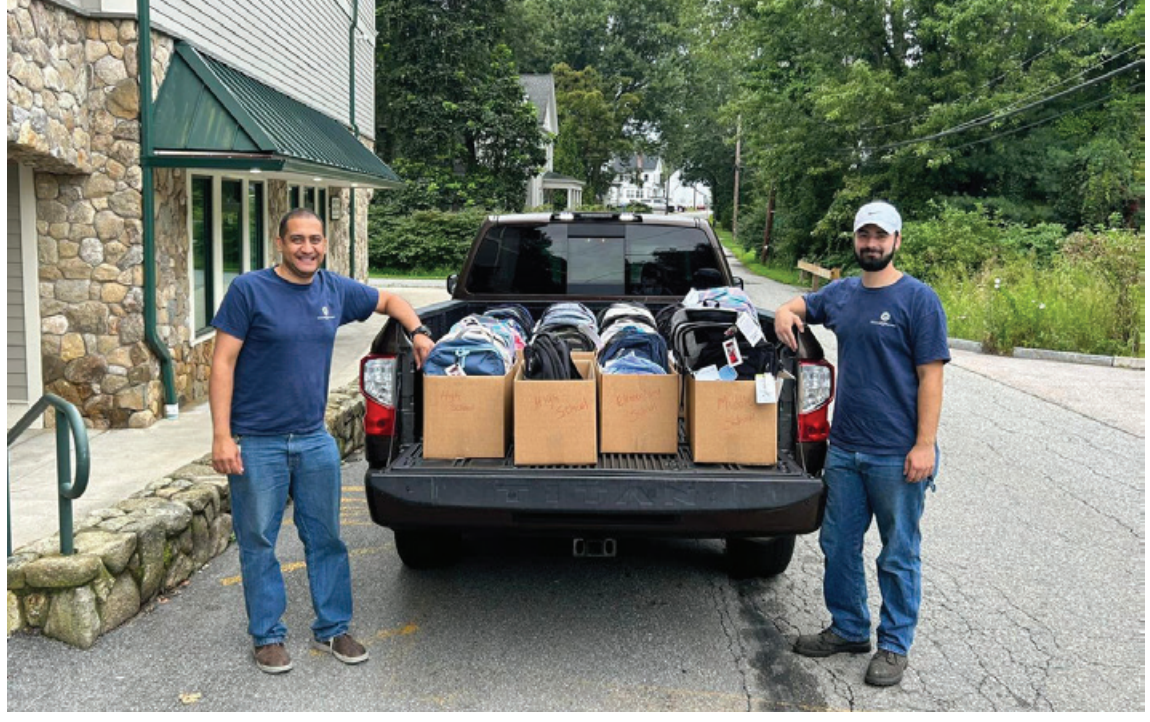
One of the Pantry's generous donors is Griffin Electric who has, for more than 10 years, provided backpacks and school supplies for each school-aged child within the Pantry.