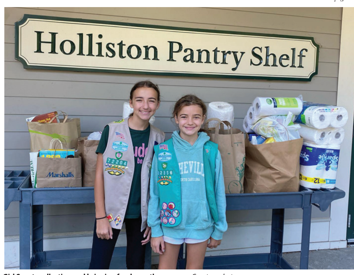
Girl Scouts collecting and bringing food over the summer.