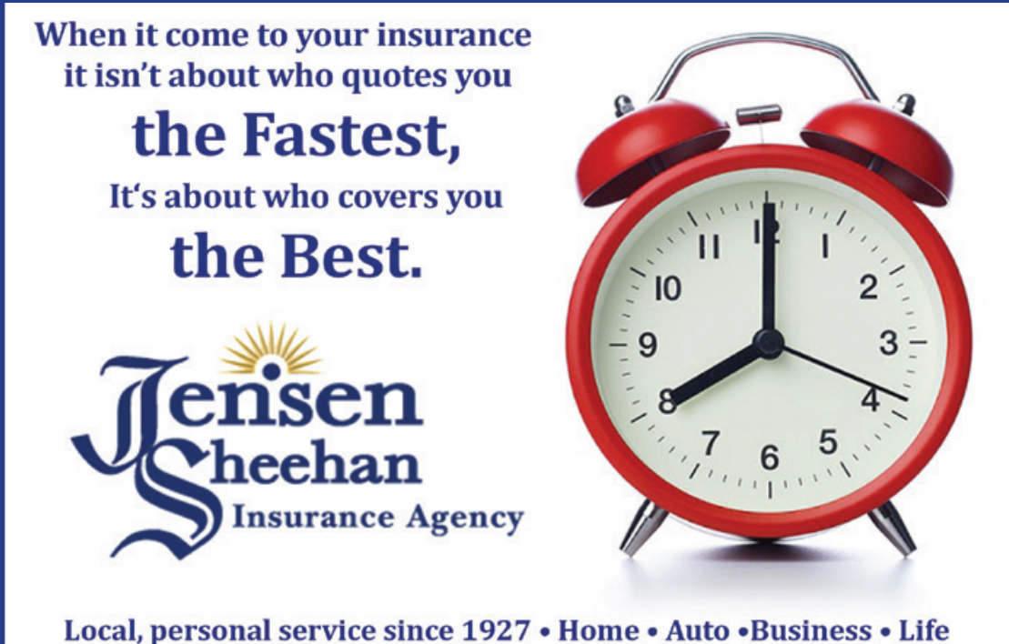
Visit us at our NEW location! 760 Washington St, Holliston MA

Thanksgiving Basket/gift card program, the Lions host 'Operation Mittens,' and the Knights of Columbus host a golf tournament to benefit the Pantry. The schools are also wonderful supporters of the Pantry. They collect items each month and the Girl Scout troops gather the items and bring them to the Pantry. The Girl Scouts do so much to support the Pantry, including