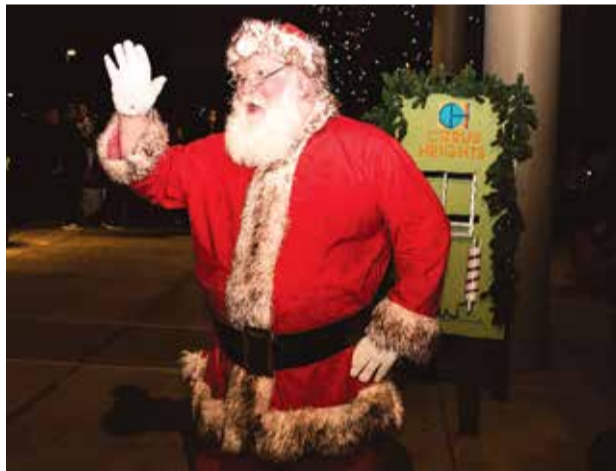
A Citrus Heights Santa gives a wave.

- Residents, community members, and neighbors are invited to the annual Holiday Tree Lighting at City Hall on Wednesday, December 6! The event will be held from 6 to 8:30 p.m. at Citrus Heights City Hall, 6360 Fountain Square Dr. Join Citrus Heights City Council, staff, and even Santa Claus for an evening of holiday cheer! Every year, we welcome guests of all ages to enjoy