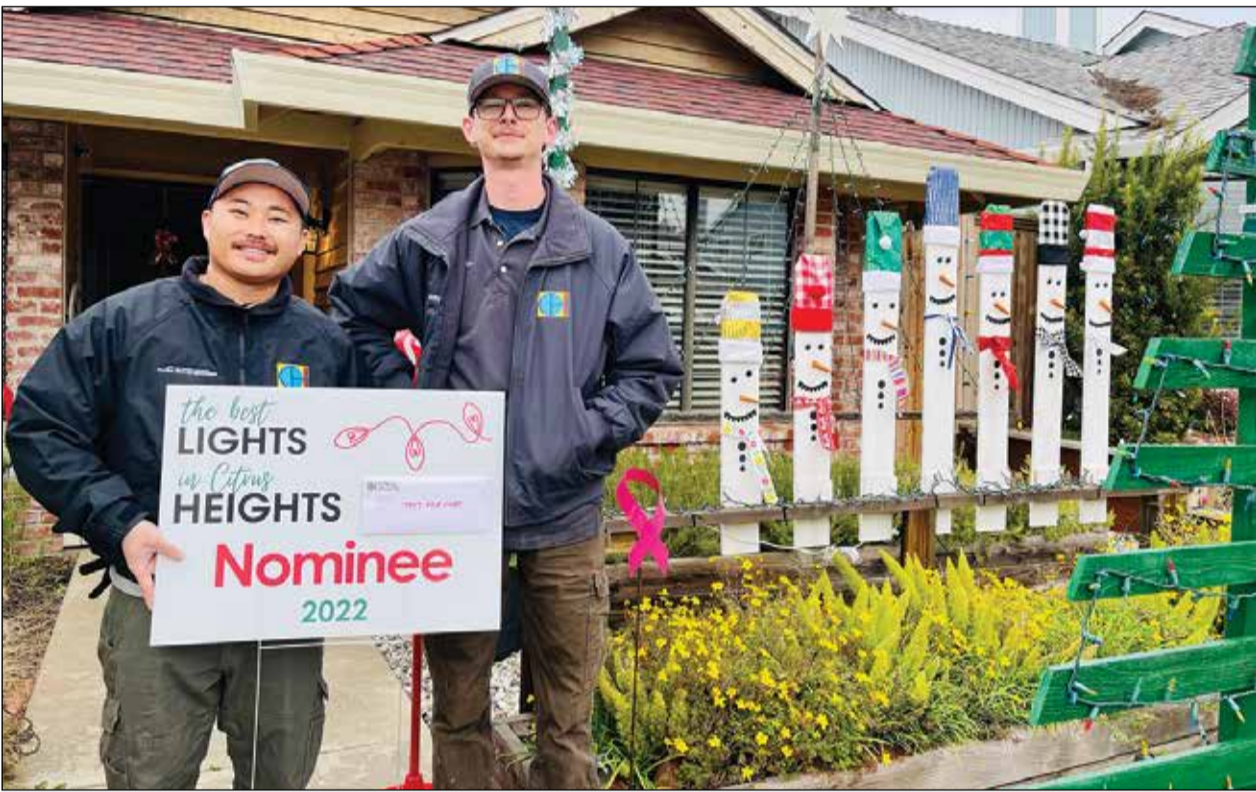
Nominate your neighbors and vote for your favorite Best Lights in Citrus Heights house.